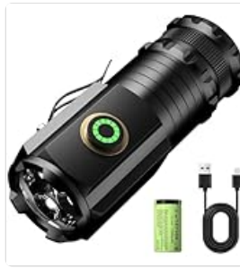
Image: Step-by-step guide for battery installation, showing how to insert the 26650 battery into the flashlight.