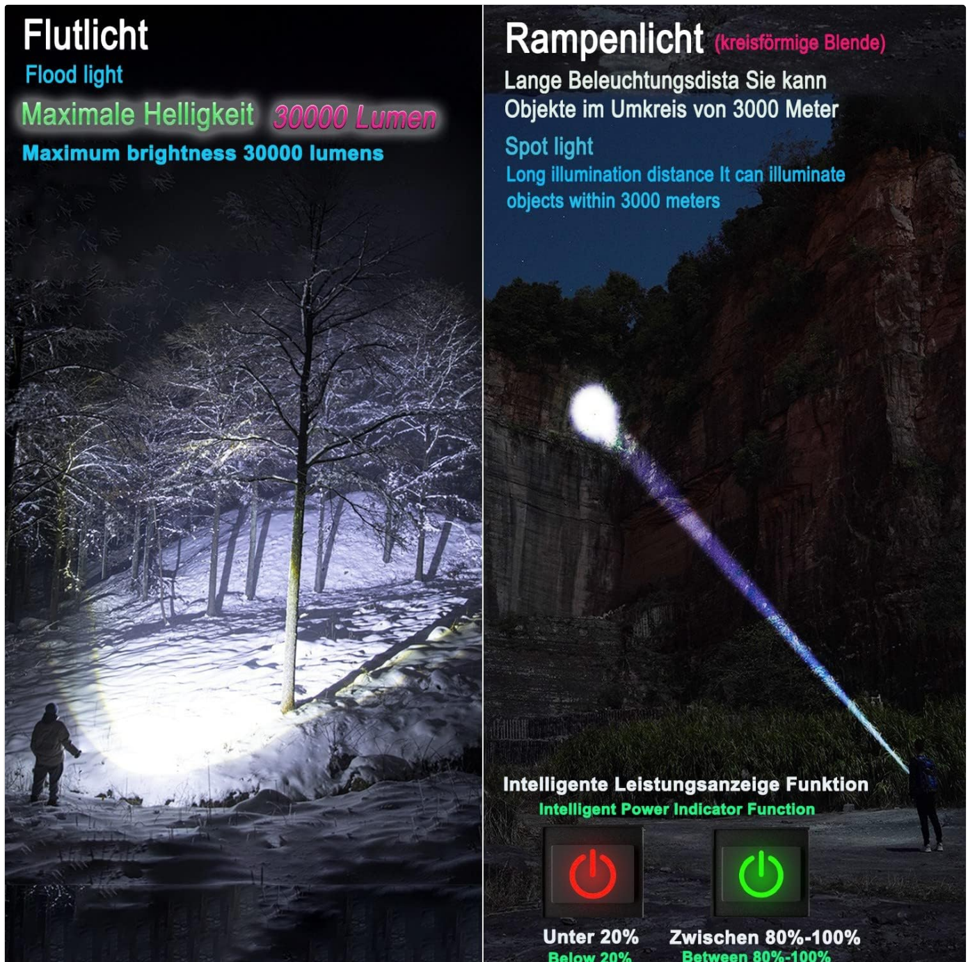
Image: A comparison demonstrating the difference between the wide floodlight beam and the focused spotlight beam, highlighting their respective illumination patterns.