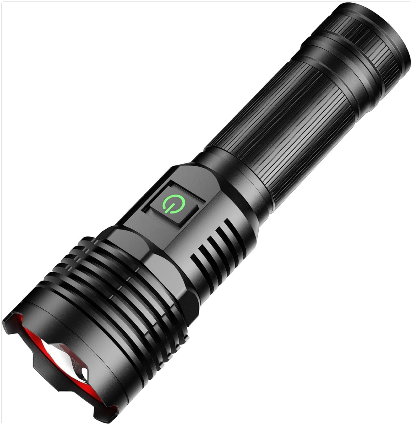
Image: The ASORT 30000 Lumen LED Flashlight shown with its included accessories, including the battery, charging cable, and various battery holders.