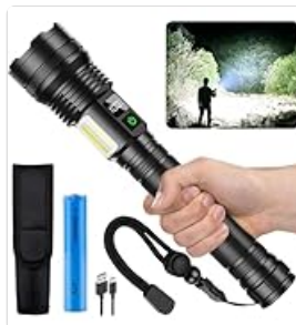
Image: The flashlight connected to a power adapter via its Type-C charging port, demonstrating the fast charging capability.