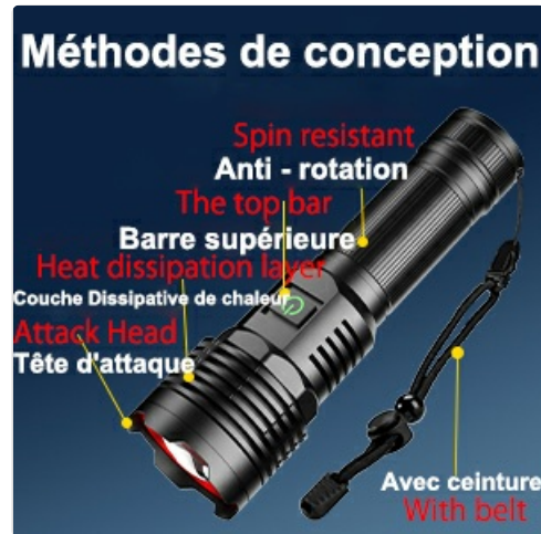
Image: Diagram illustrating key components of the flashlight, including the attack head, heat dissipation layer, top bar, and anti-rotation design, along with the hand strap.

Familiarize yourself with the components of your ASORT LED Flashlight: