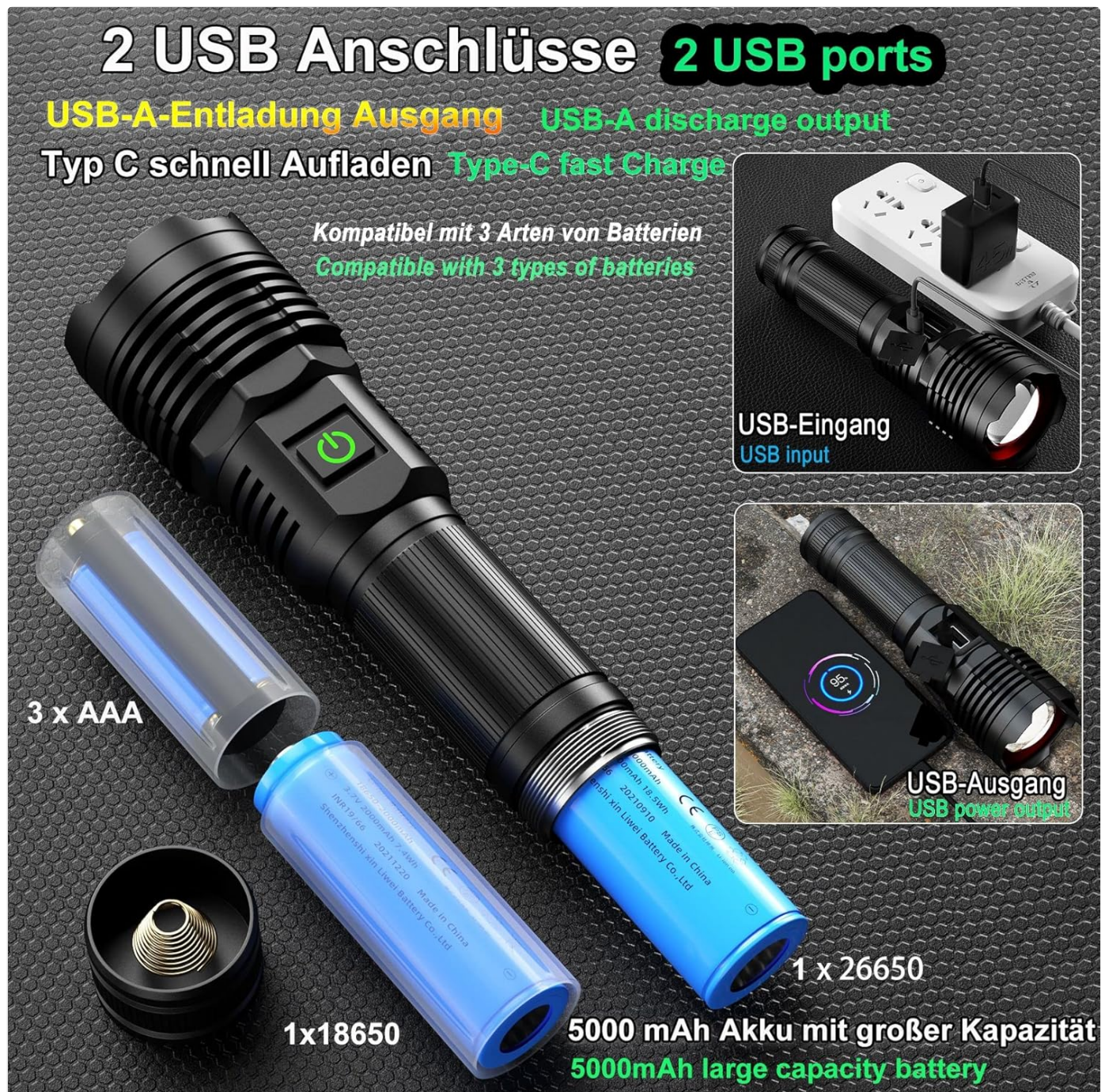
Image: The flashlight demonstrating its USB-A discharge output function, showing it charging a smartphone, and also highlighting its compatibility with three battery types.