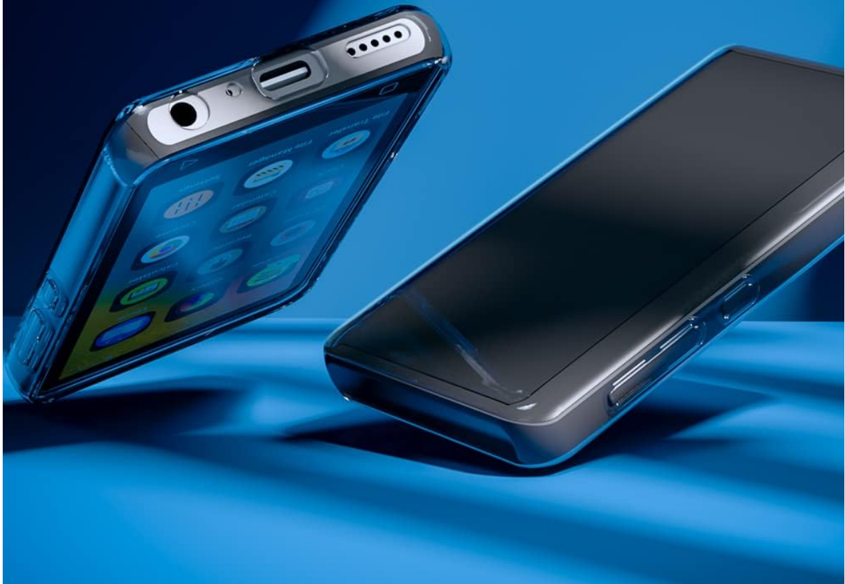
Image: Close-up view of the innioasis G1/G3 MP3 player within the clear case, demonstrating the precise cutouts for easy access to buttons and ports.

Precise cutouts, easy-press buttons ensure your player stays fully functional and has a more comfortable feel