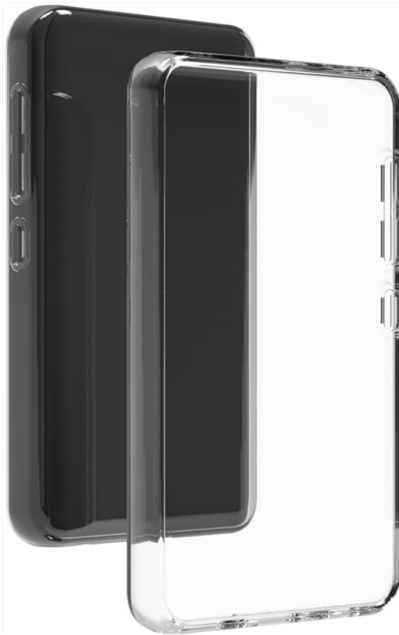
Image: The innioasis Crystal Clear Protective Case, designed for G1/G3 MP3 players.