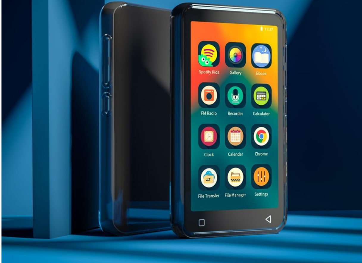
Image: innioasis G1/G3 MP3 player with the clear protective case installed, showcasing the device's screen and app icons.