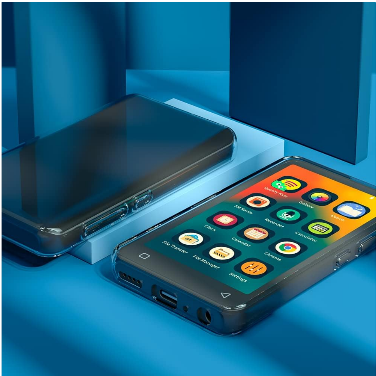
Image: Side view of the MP3 player with the clear case, demonstrating its slim and lightweight design.