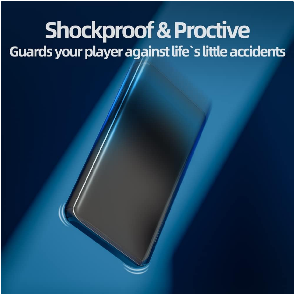
Image: Visual representation of the case's shock-absorbing capabilities protecting the MP3 player.