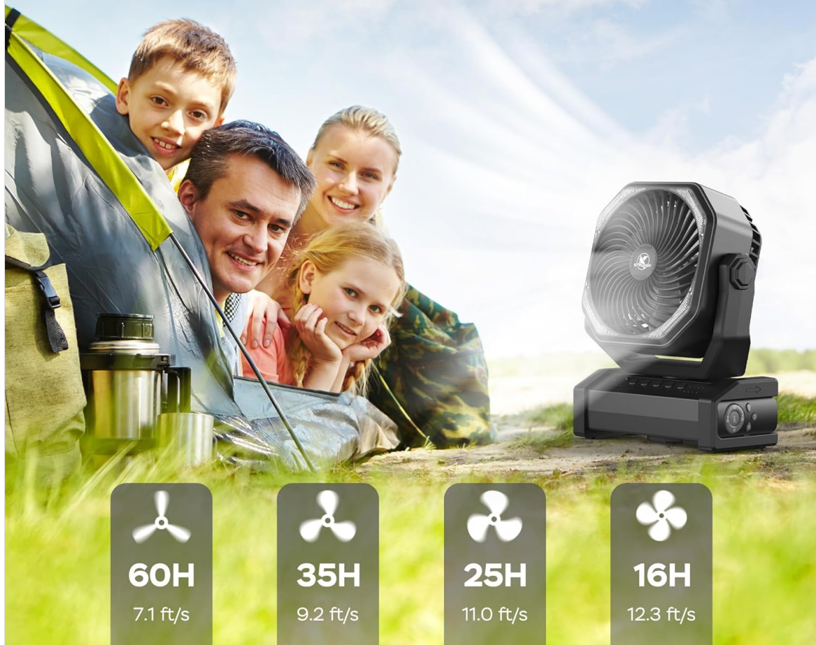
Figure 4: Fan speed settings and estimated run times.