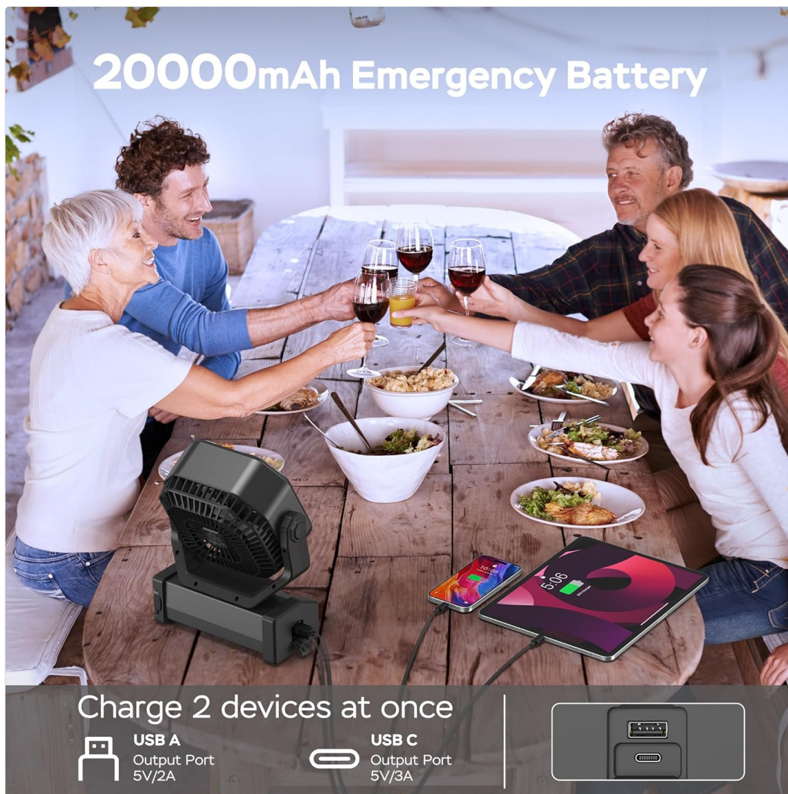
Figure 7: Charging external devices using the fan's power bank function.

Video 3: Overview of the portable camping fan's features, including its 20000mAh battery and various functions.