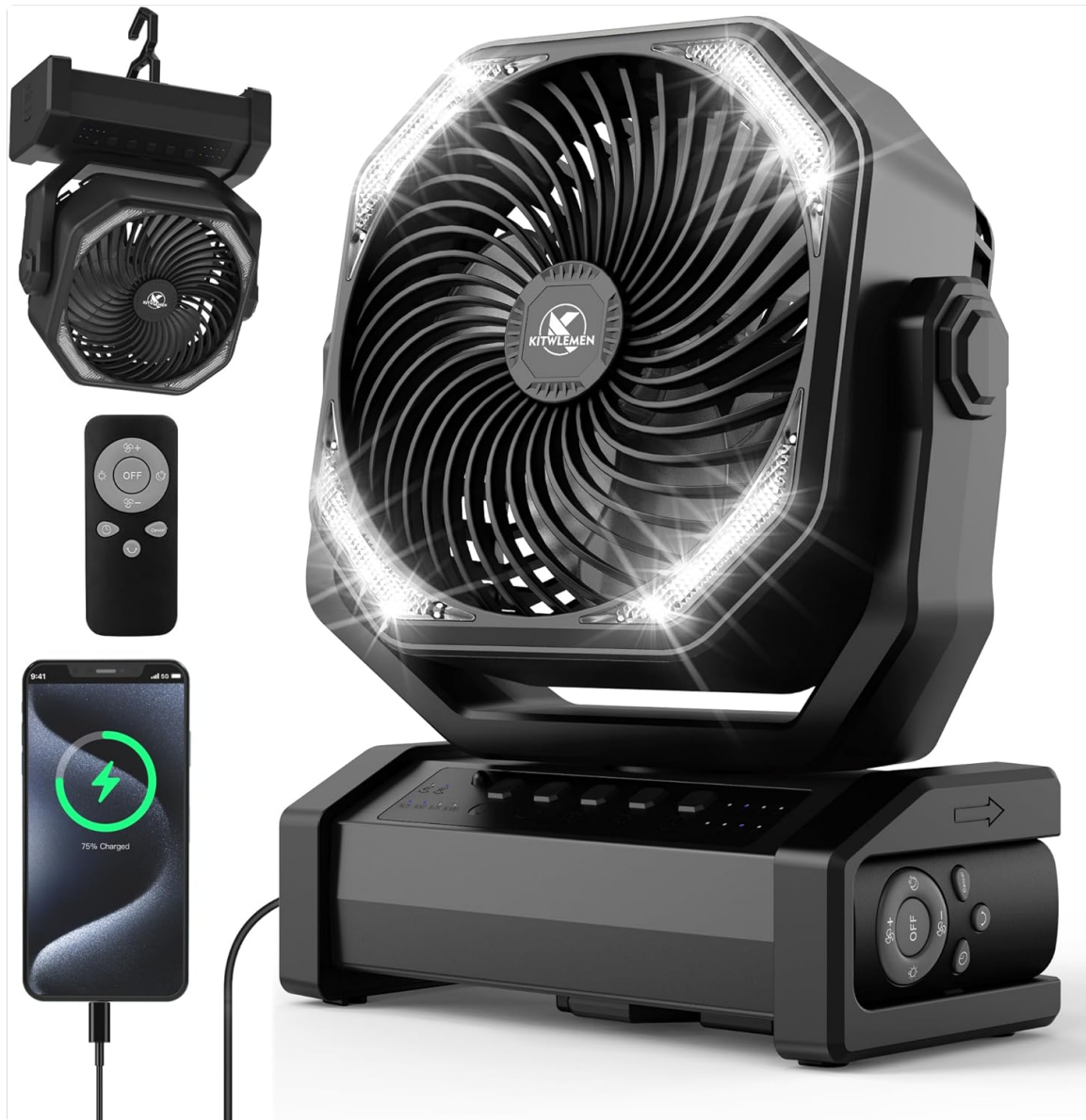
Figure 1: Main components of the KITWLEMEN Camping Fan.

or hanging. The fan head can pivot 270 degrees for directional airflow.