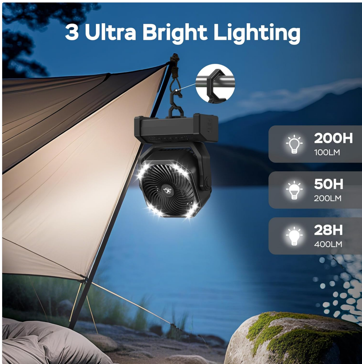
Figure 5: LED lighting brightness levels.