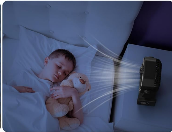
Figure 6: Oscillation and pivoting capabilities.

Video 2: Demonstration of the fan's auto-oscillating function and remote control usage.