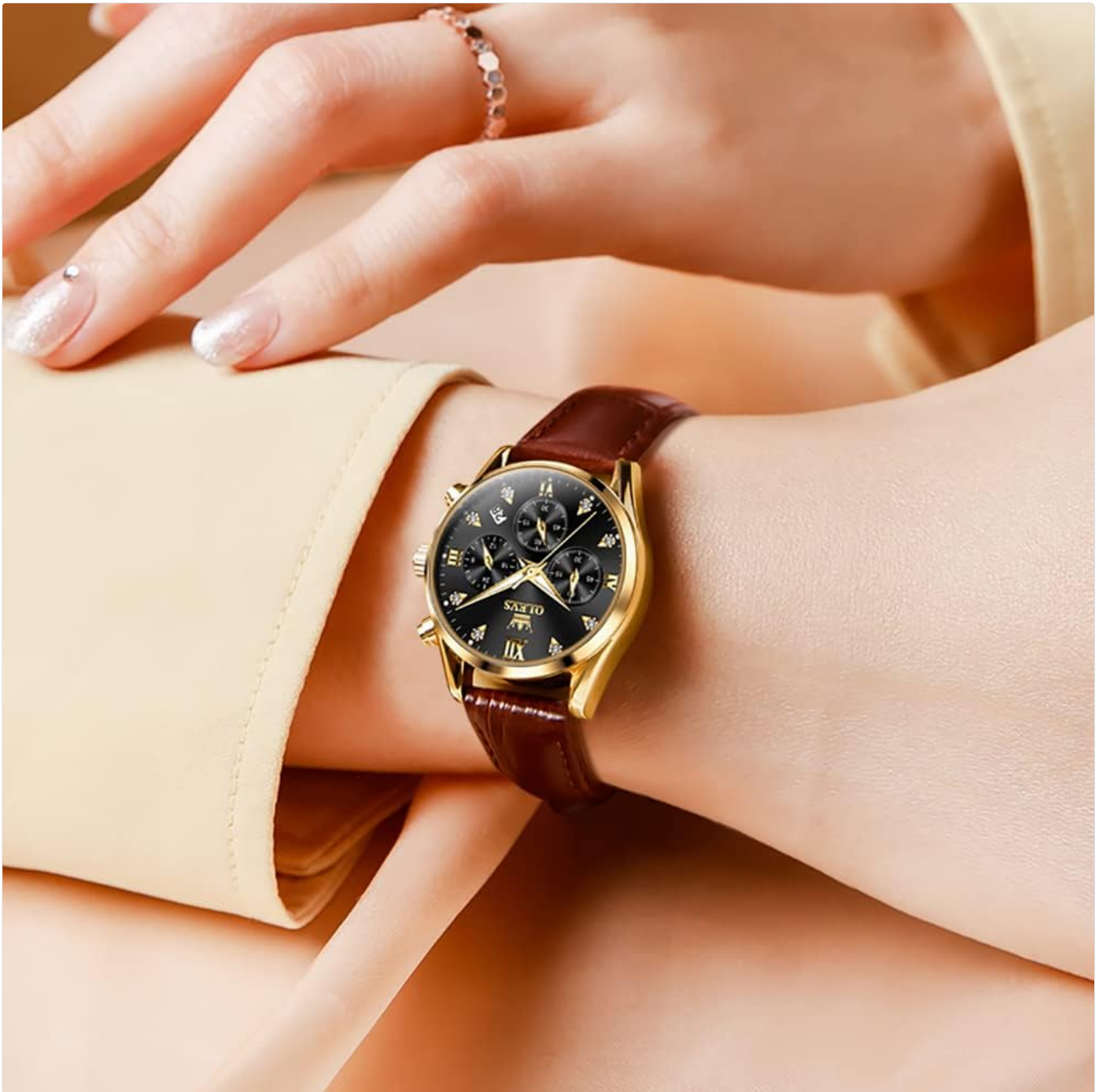
The OLEVS watch comfortably worn on a wrist, highlighting the fit of the brown leather strap.