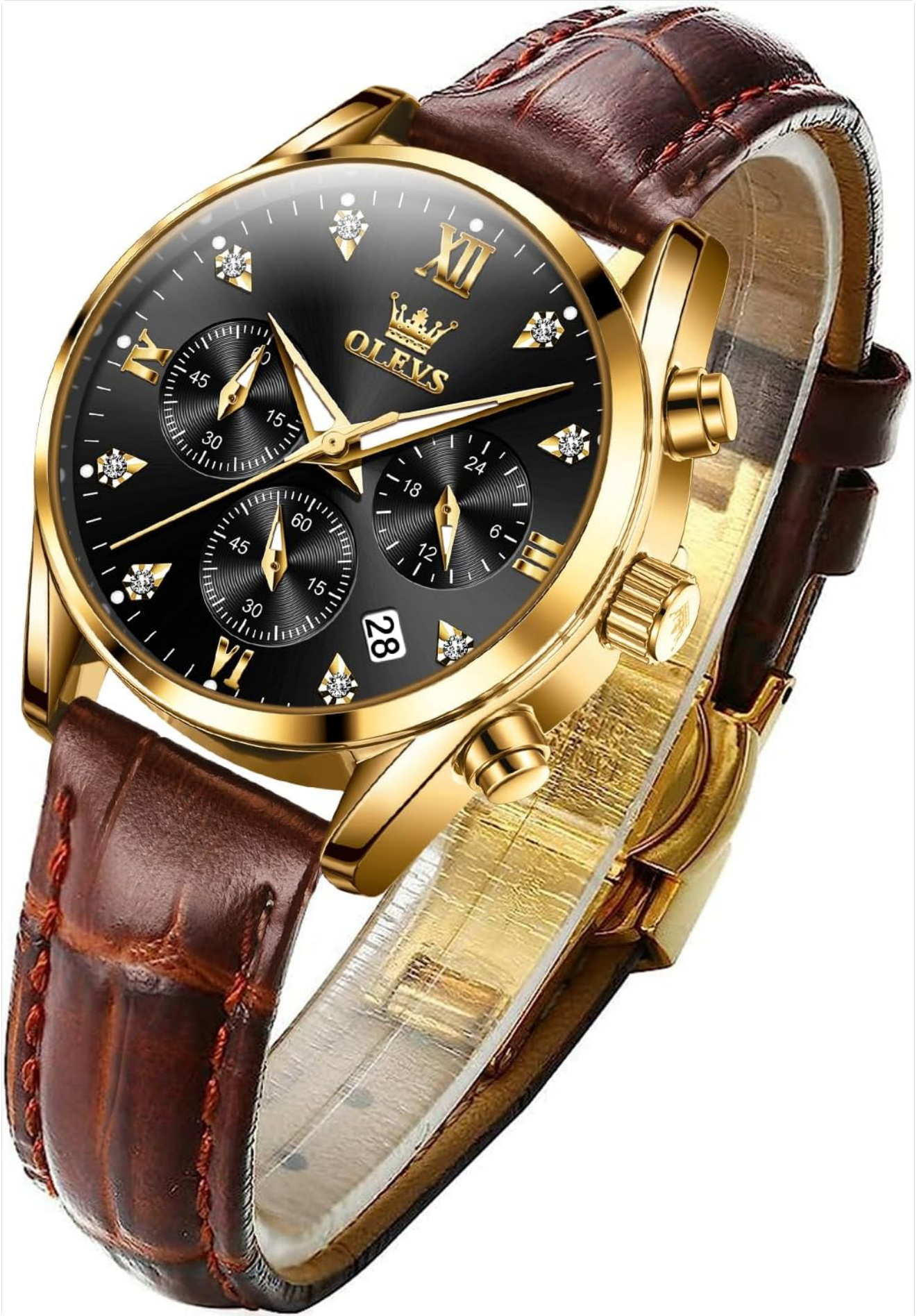
Front view of the OLEVS Women's Multifunction Chronograph Watch, featuring a gold-tone case, black dial with diamond markers, and a brown leather strap.