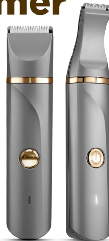
Image 5: The Body Hair Trimmer (BG220) in action for full body grooming.

Your browser does not support the video tag.