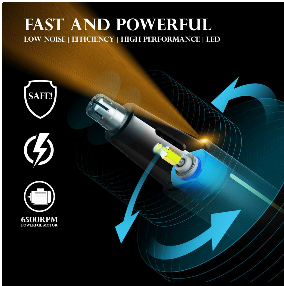
Image 6: The nose and ear trimmer head is washable for easy cleaning.