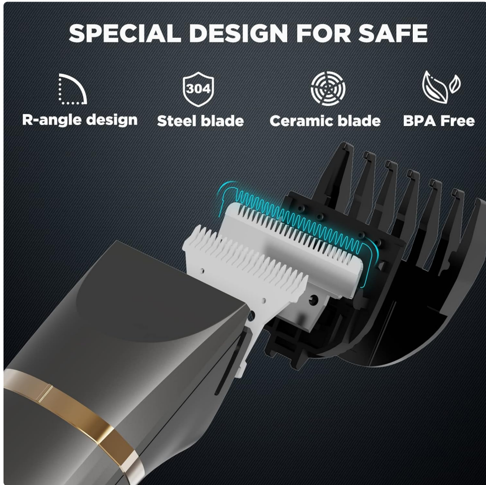
Image 7: Key safety and design features of the Body Hair Trimmer (BG220).