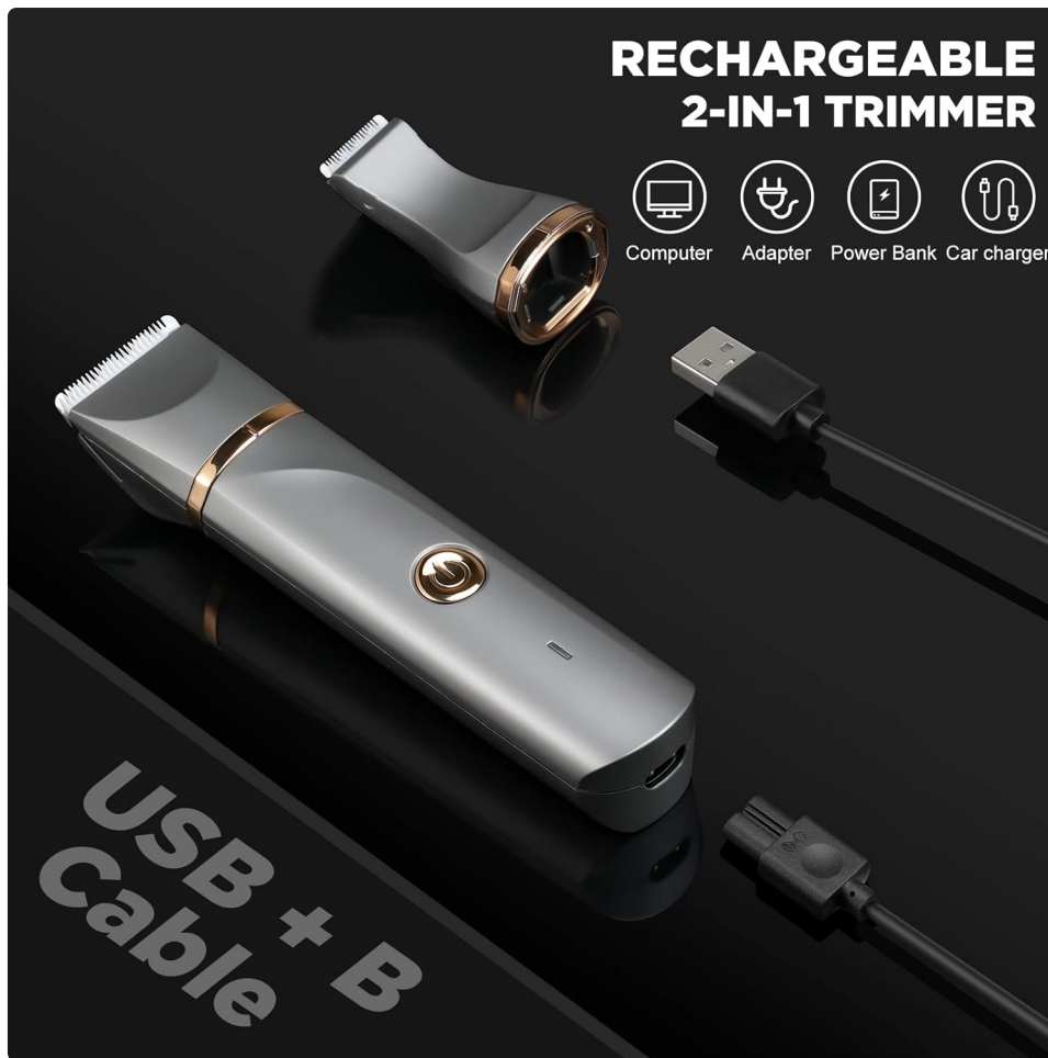
Image 3: The Body Hair Trimmer (BG220) being charged via USB cable.