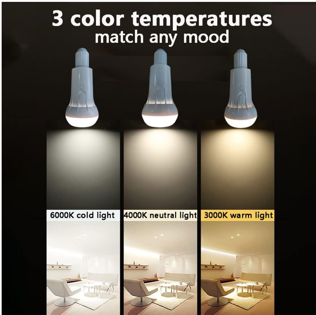
Image: Examples of the three available color temperatures.