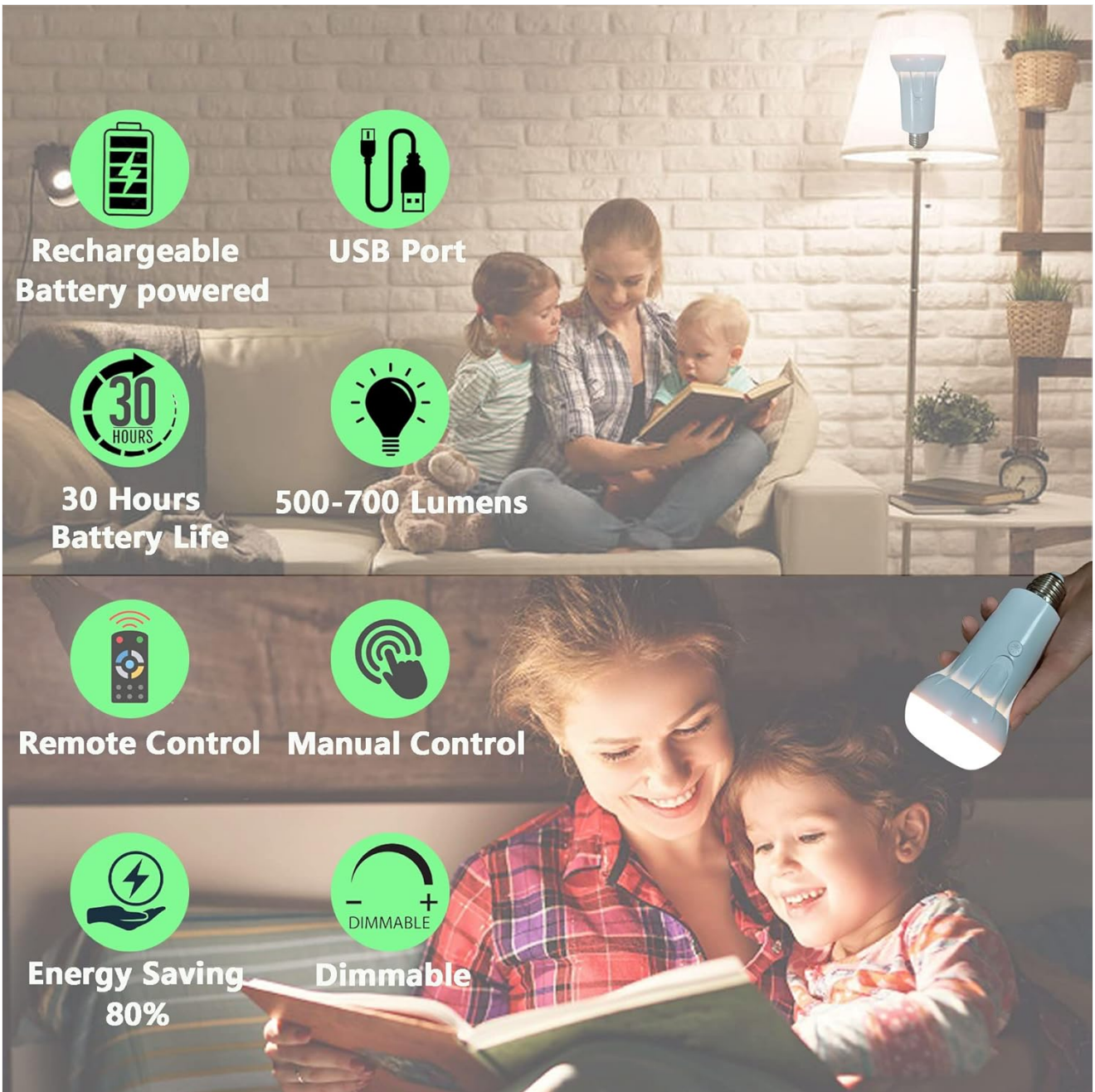
Image: Overview of the bulb's main features and benefits.