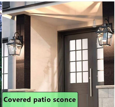
Covered patio sconce