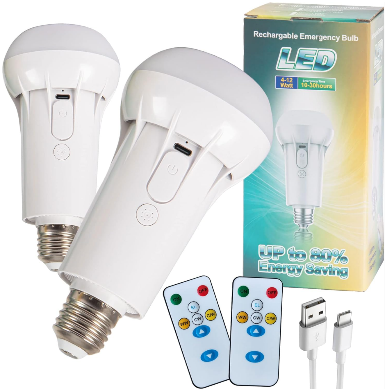
Image: Contents of the Civaza 2-Pack, including two bulbs, two remotes, and two USB charging cables.