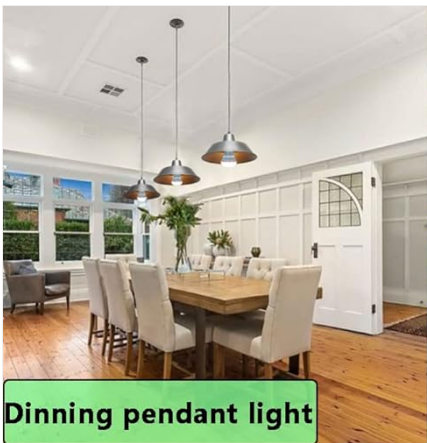
Dinning pendant light