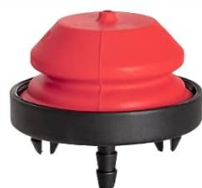
Primer Bulb x 1