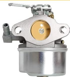
Carburetor x 1