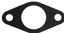
Gasket x 1