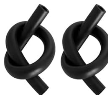
Fuel Line x 1 Primer Line x 1