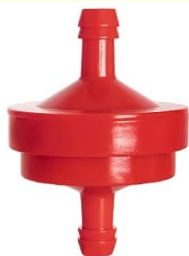
Fuel Filter x 1