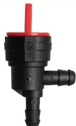
Fuel Shutoff Valve x 1