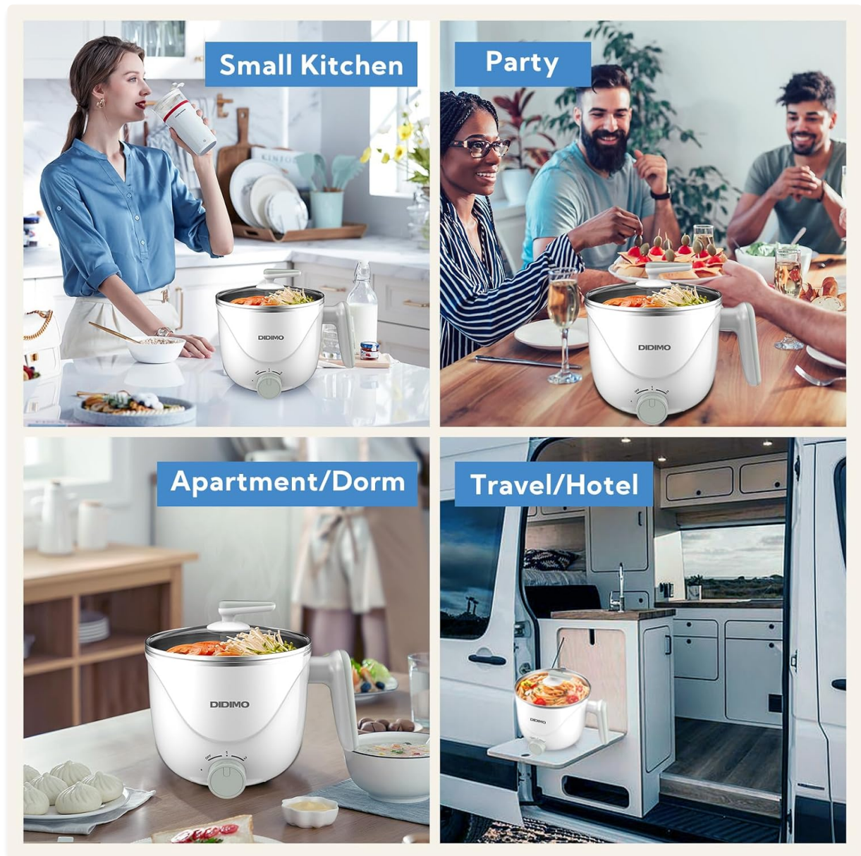
Image: The hot pot is suitable for various environments, from dorms to travel.