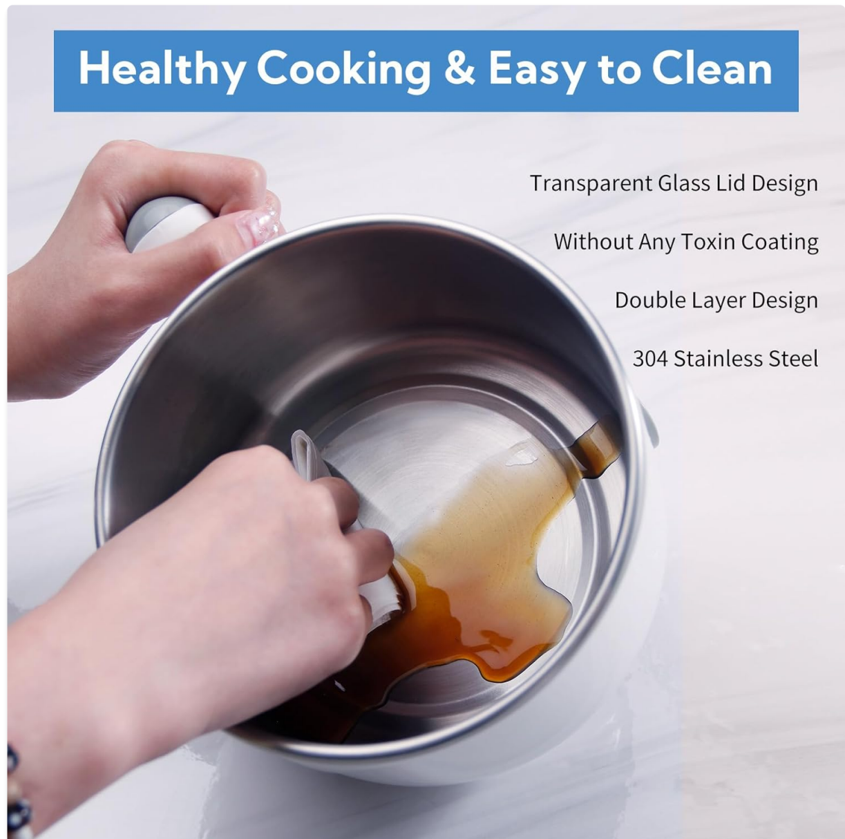
Image: The 304 stainless steel interior is designed for healthy cooking and easy cleaning.