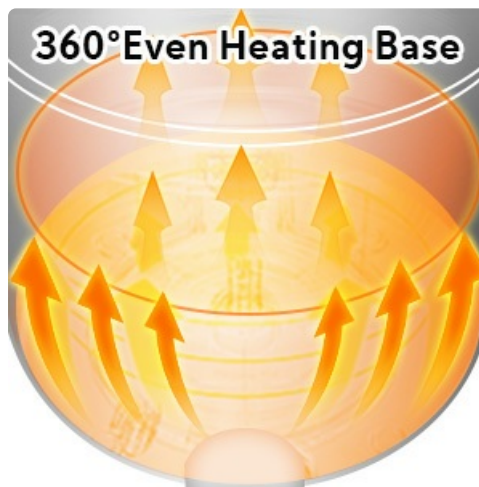
Image: The hot pot includes overheat and dry-boil protection for user safety.