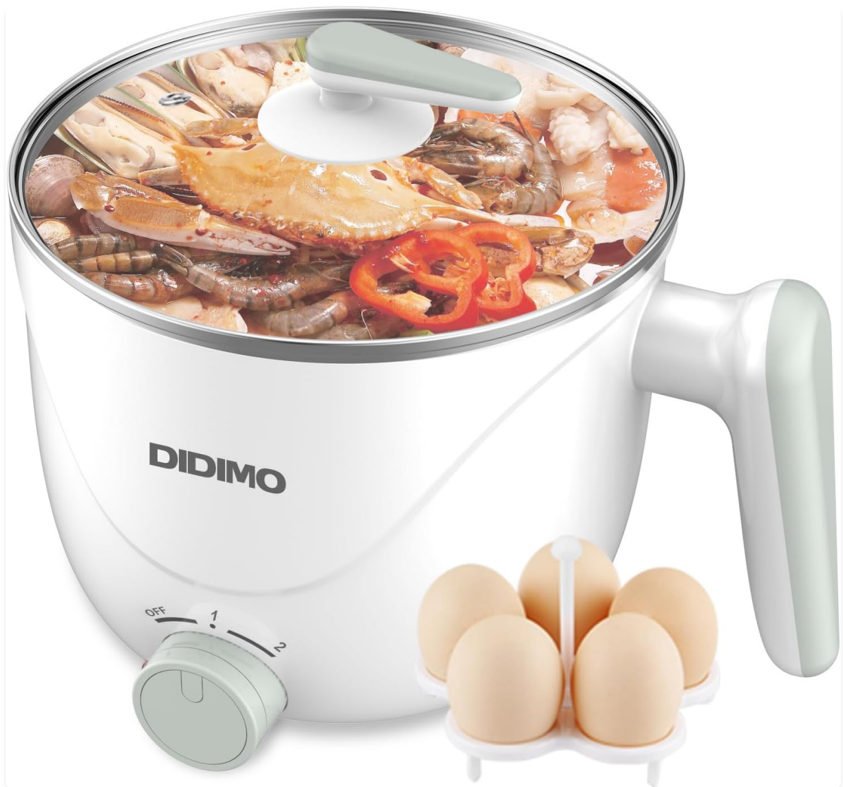
Image: The DiDimo 1.5L Electric Hot Pot, showcasing its compact design and a meal being prepared.