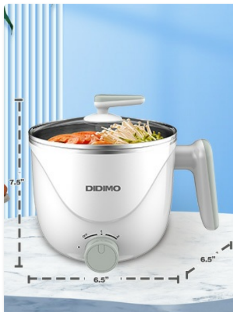
Image: Product dimensions for the DiDimo Electric Hot Pot.