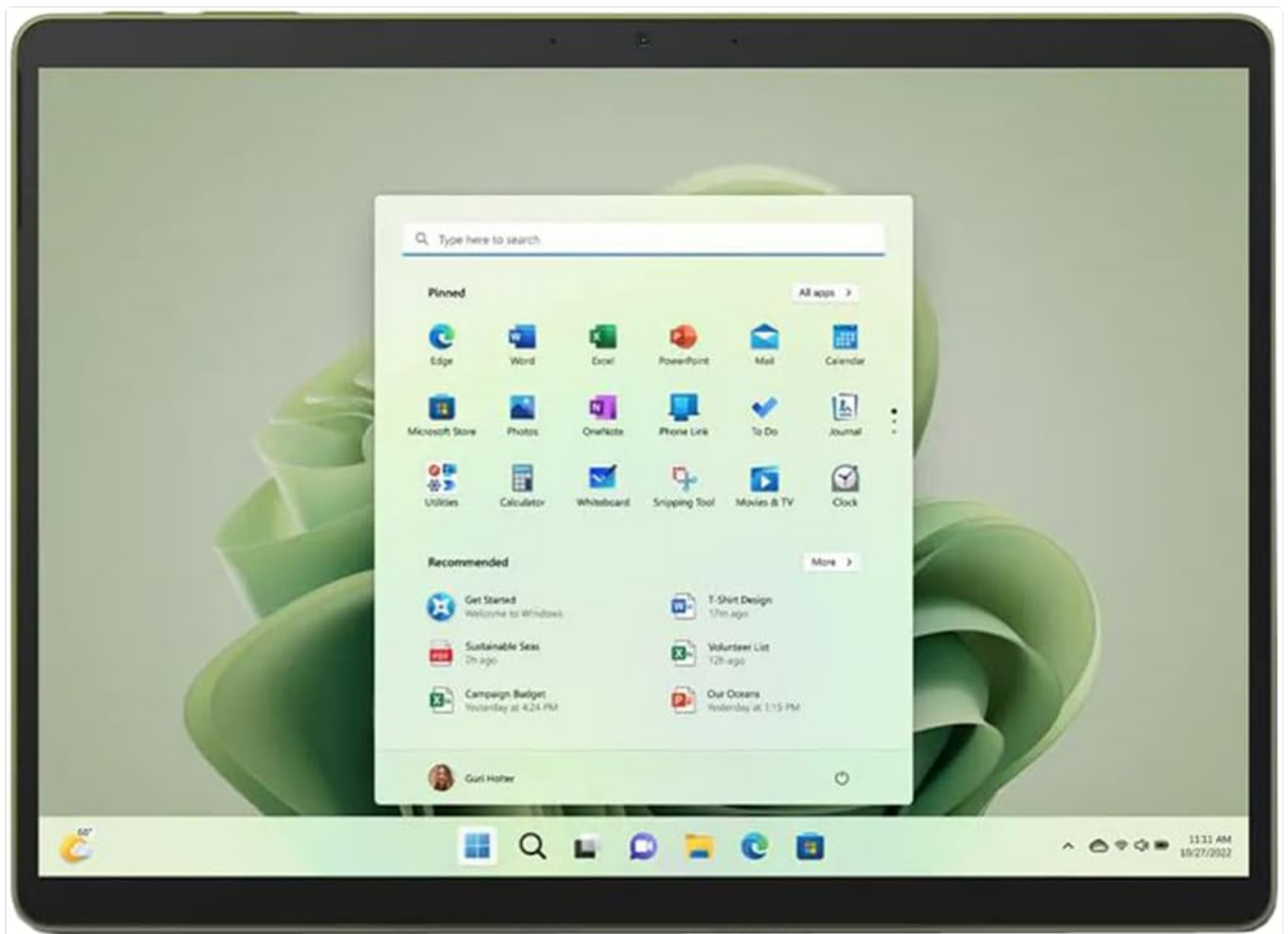
Figure 2: Surface Pro 9 in tablet mode, showcasing the Windows 11 interface.