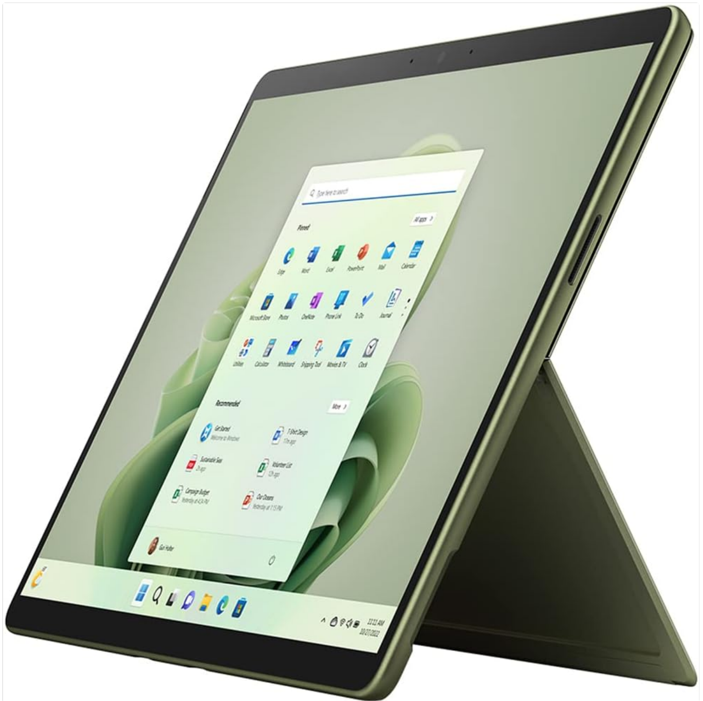
Figure 3: Surface Pro 9 with its adjustable kickstand, providing versatile viewing angles.