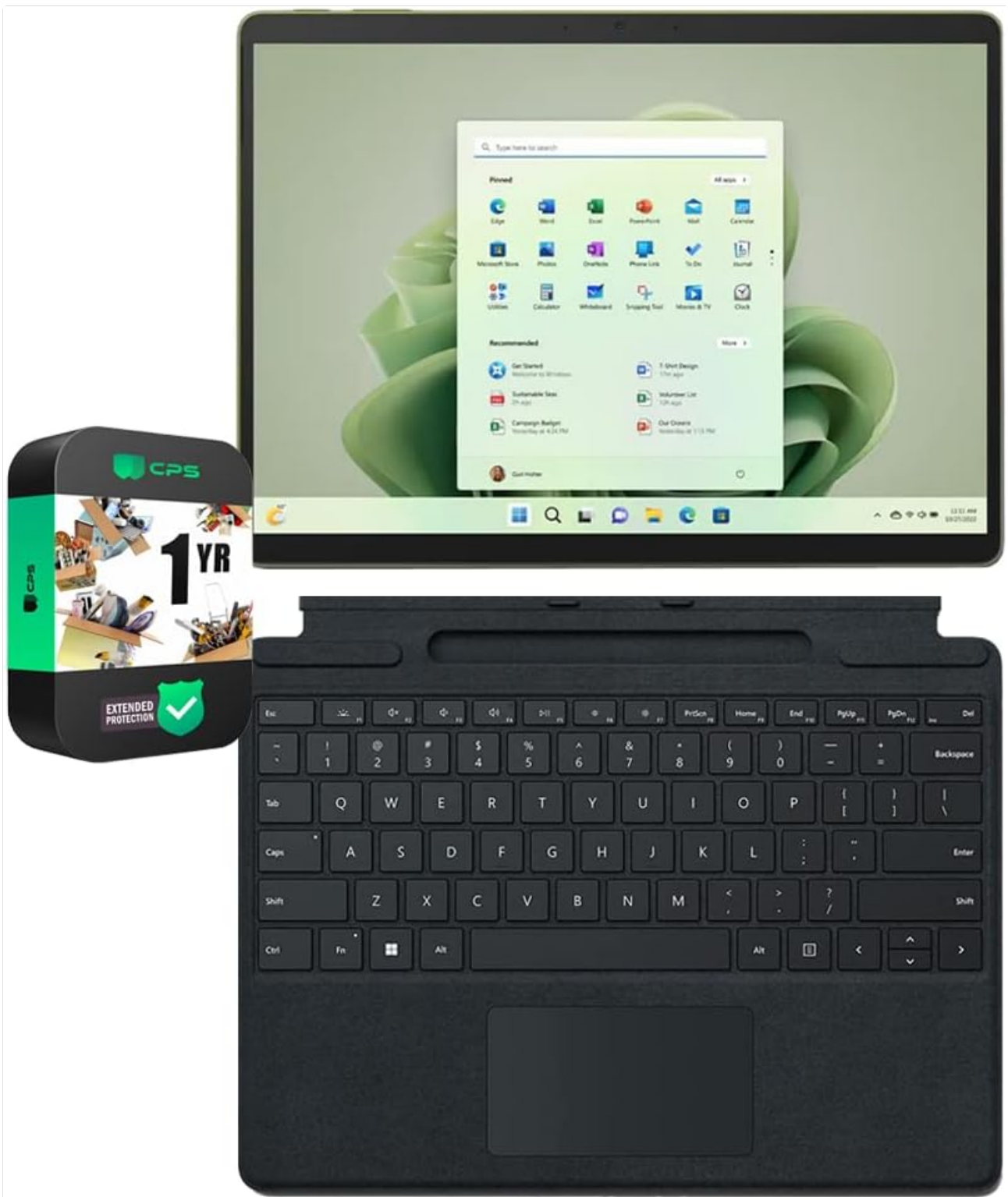
Figure 1: Microsoft Surface Pro 9 with detachable keyboard and included 1-year protection pack.