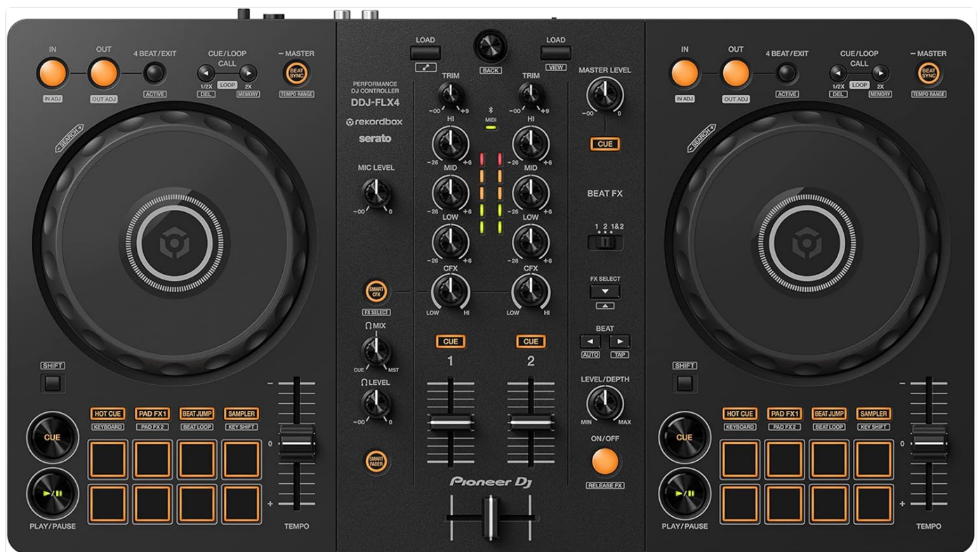
Figure 1: Top view of the Pioneer DJ DDJ-FLX4 controller, showcasing its two decks, central mixer section, and performance pads.

The Pioneer DJ DDJ-FLX4 is a versatile 2-channel DJ controller designed for both aspiring and experienced DJs. It offers a user-friendly interface and professional-grade features, compatible with rekordbox and Serato DJ software. This manual provides essential information for setting up, operating, maintaining, and troubleshooting your DDJ-FLX4 controller to ensure optimal performance and longevity.