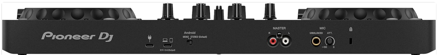
Figure 2: Rear panel of the DDJ-FLX4, displaying the USB-C port for connection and power, along with master audio outputs and microphone input.

Connect the DDJ-FLX4 to your computer or mobile device using the supplied USB Type-C cable. The controller draws power via USB, eliminating the need for an external power adapter.