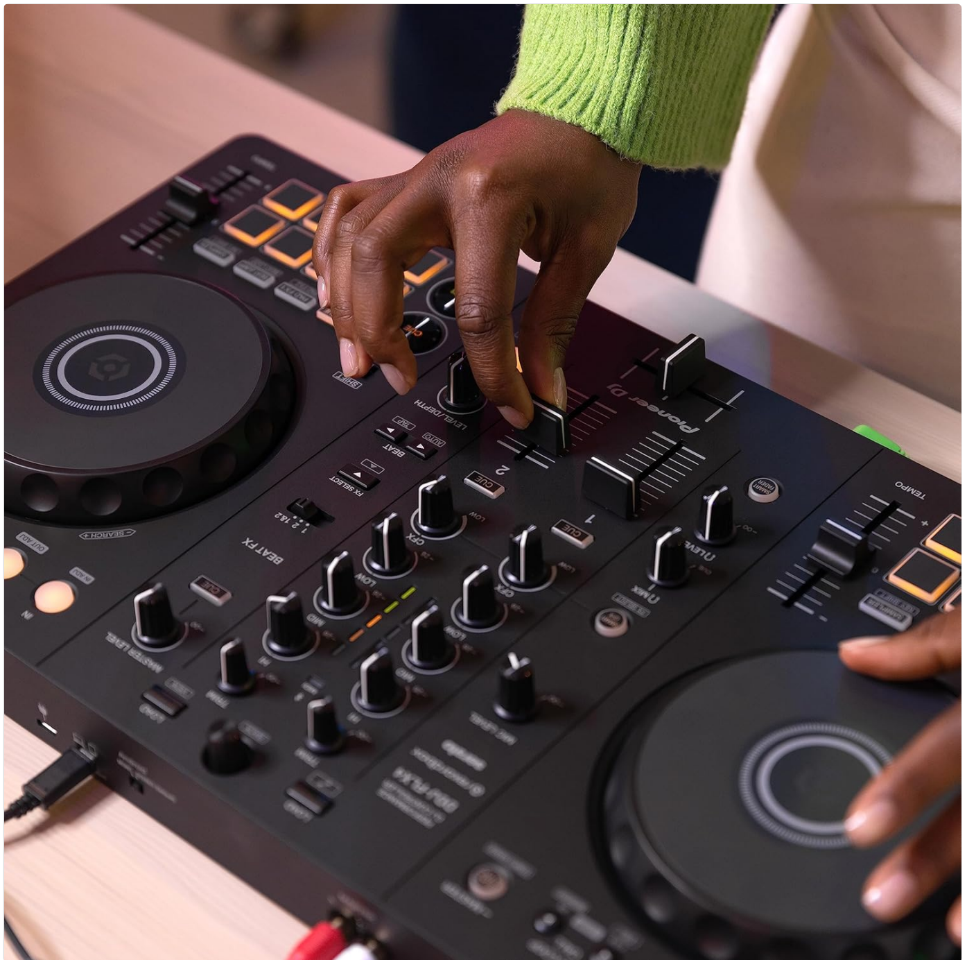
Figure 5: Detail of the central mixer section, showing hands adjusting the EQ and filter knobs, and the channel faders.