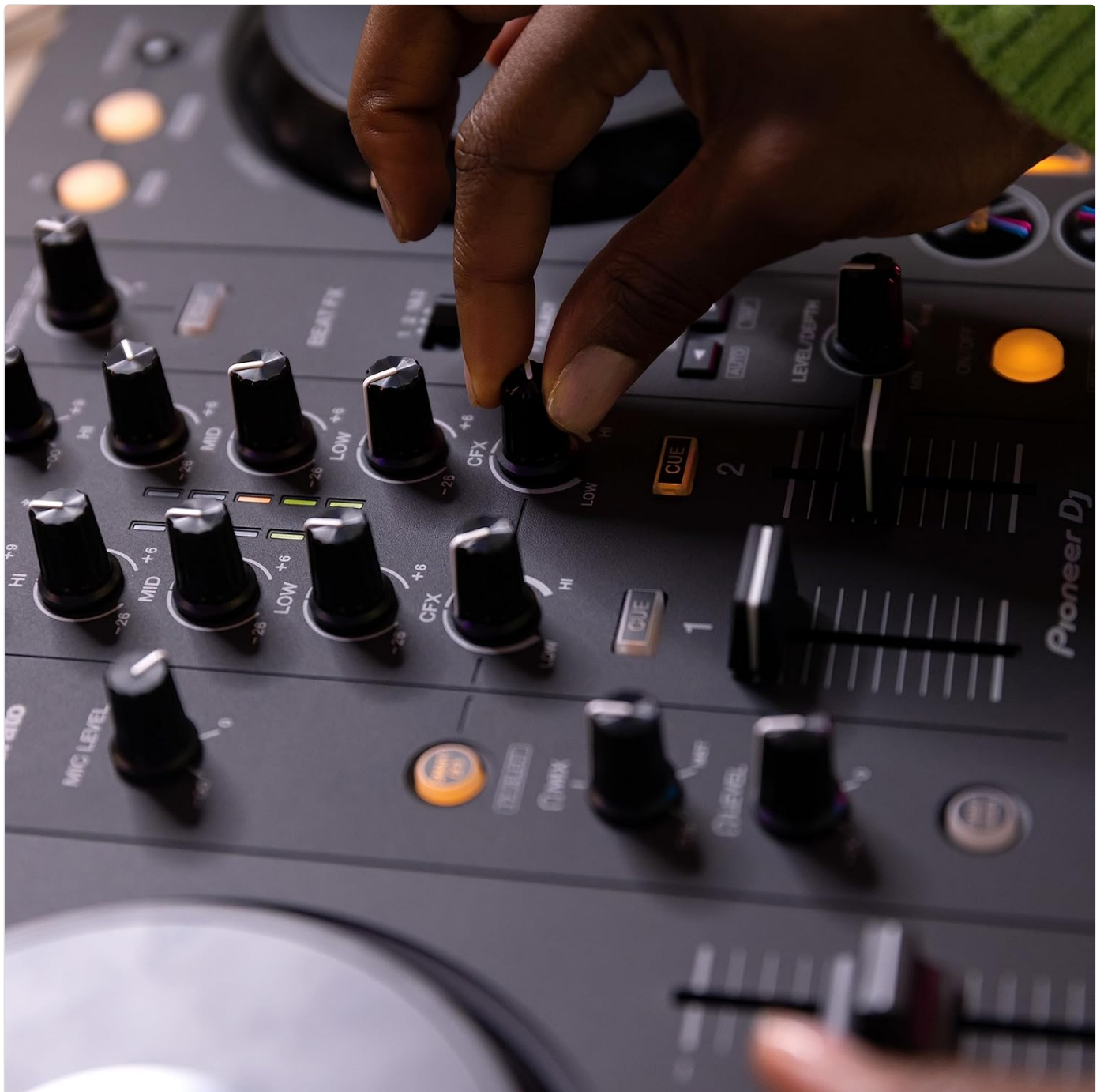
Figure 6: A close-up view of the Smart CFX button, highlighting its position near the filter knobs for easy access during performance.