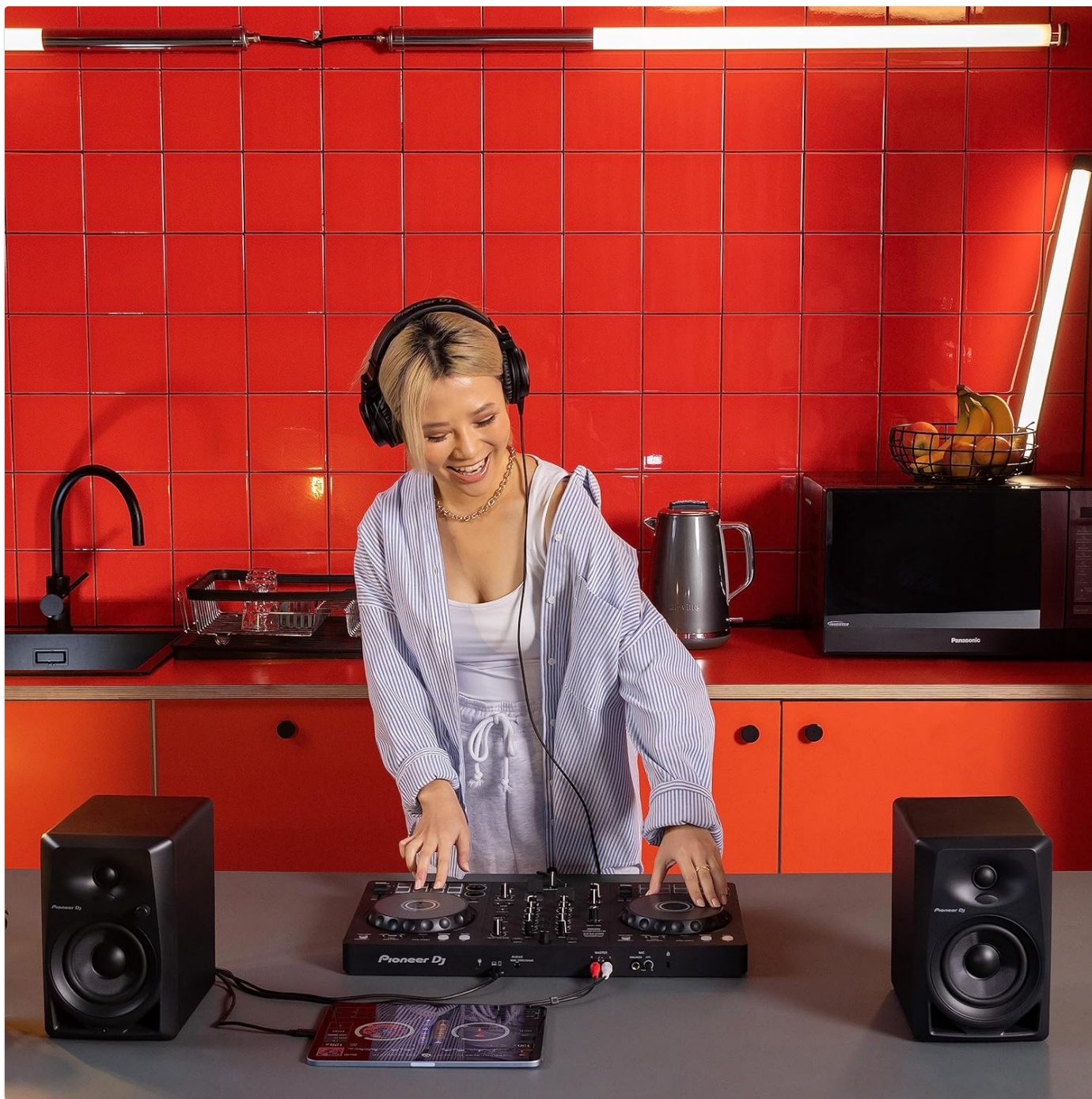
Figure 8: A DJ utilizing the microphone input on the DDJ-FLX4, demonstrating its use in a live streaming or recording environment.

The controller includes a microphone input with dedicated level control, allowing you to add vocals or announcements to your mixes.