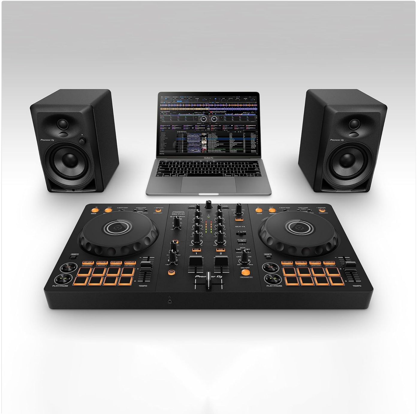
Figure 4: A typical setup showing the DDJ-FLX4 connected to a laptop and external studio monitors, ready for performance.

headphones to the headphone jack on the front of the unit.