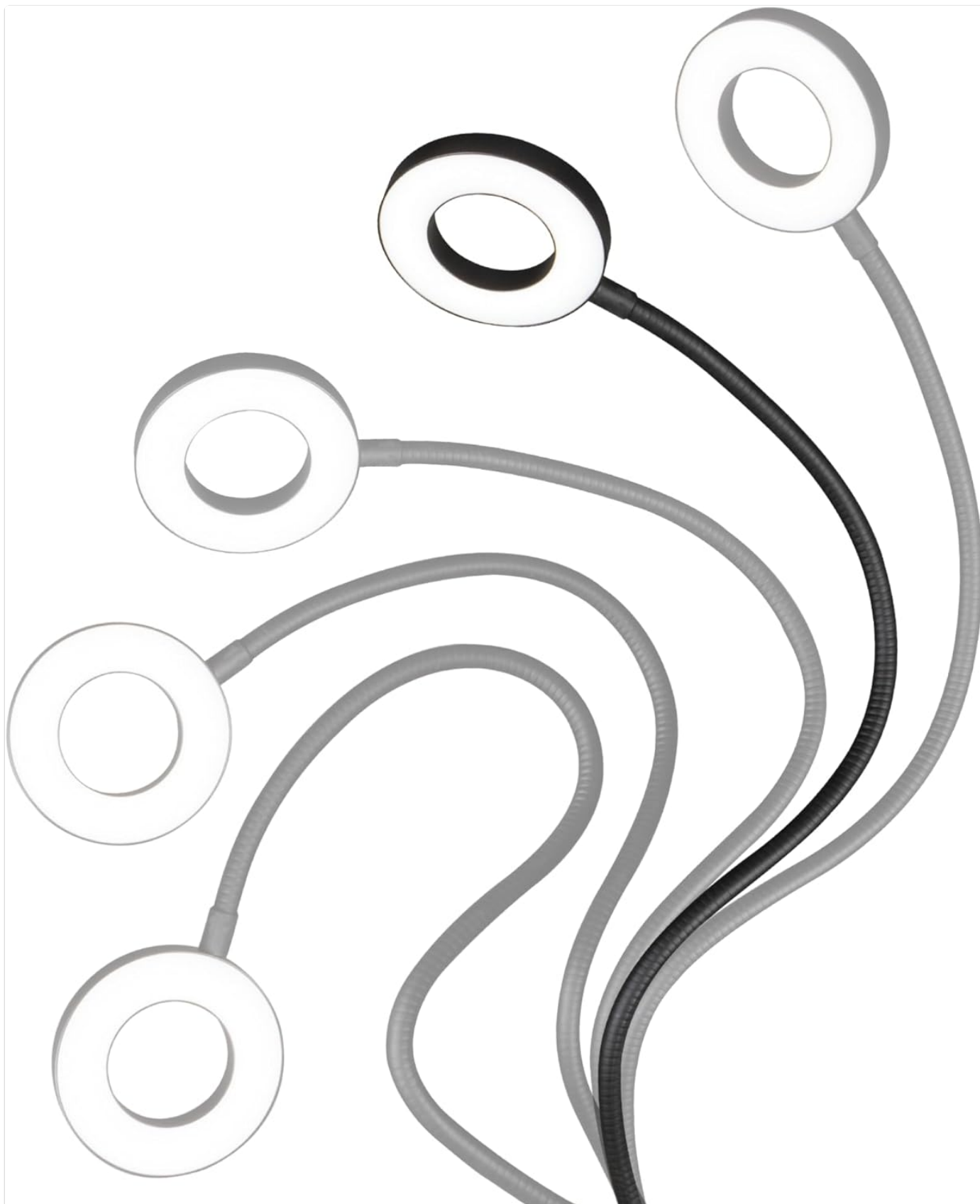
Figure 2: The flexible gooseneck of the OttLite LED Ring Light, allowing for various adjustments to direct illumination.