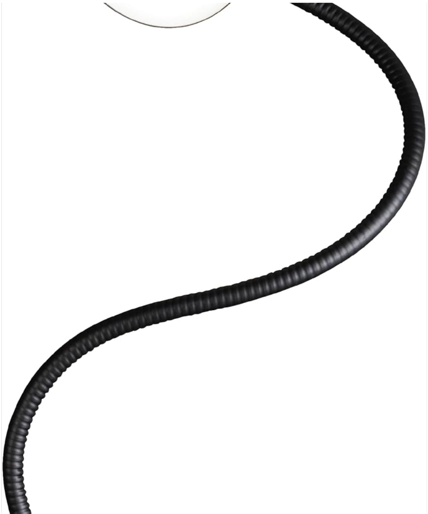
Figure 5: A detailed view of the illuminated LED ring light, showcasing its even and bright output.