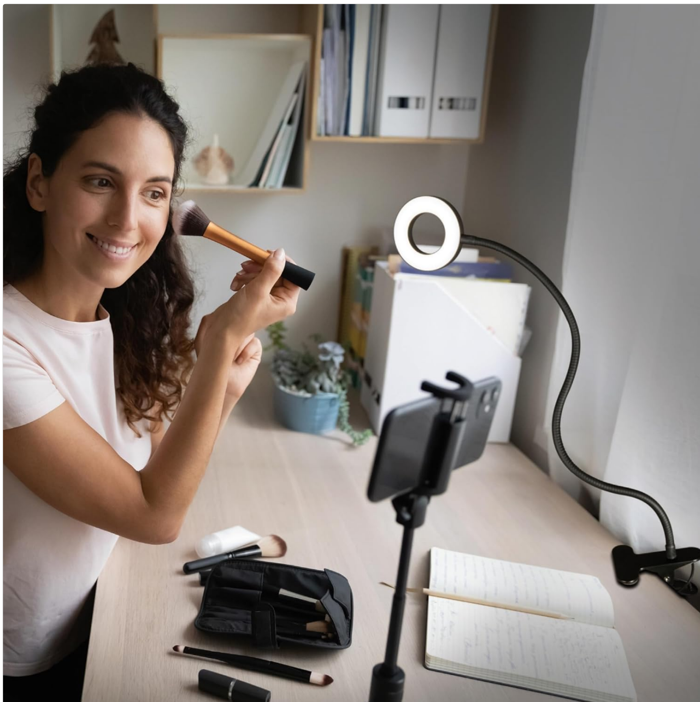
Figure 4: The OttLite LED Ring Light displaying its three distinct color temperature modes: Warm White, Bright White, and Natural Daylight.