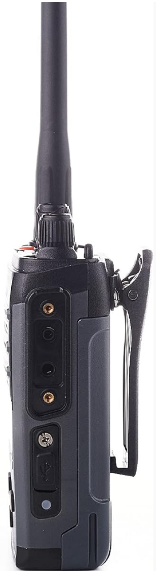
Image: Side view of the Dynascan LP-50 walkie-talkie showing the accessory port with its protective cover. This cover must be securely closed to maintain the device's IP67 rating.