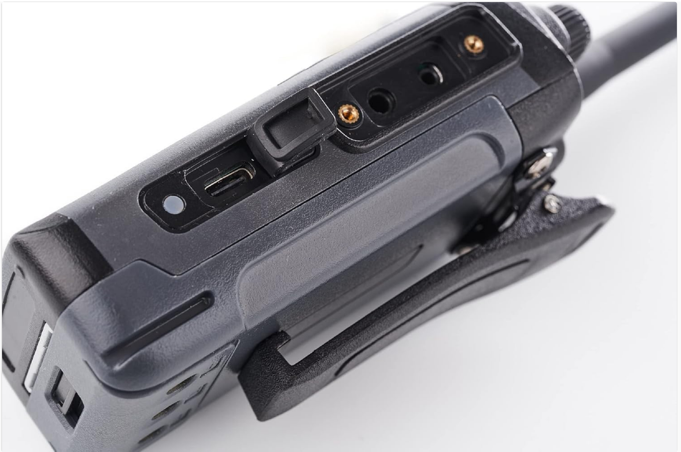
Image: Close-up of the Dynascan LP-50 walkie-talkie showing the USB-C charging port with its protective cover open. This port allows for direct charging without the cradle.