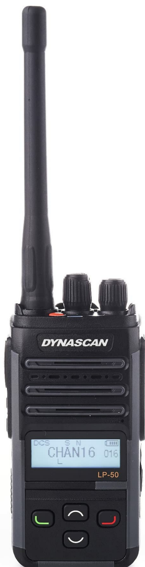
Image: Front view of the Dynascan LP-50 walkie-talkie, highlighting the LCD screen which displays the current channel (e.g., CHAN16 016) and the two control knobs at the top for power/volume and channel selection.

Use the Channel Selector knob (top-right knob) to select one of the 16 available channels. The selected channel number will be displayed on the LCD screen.