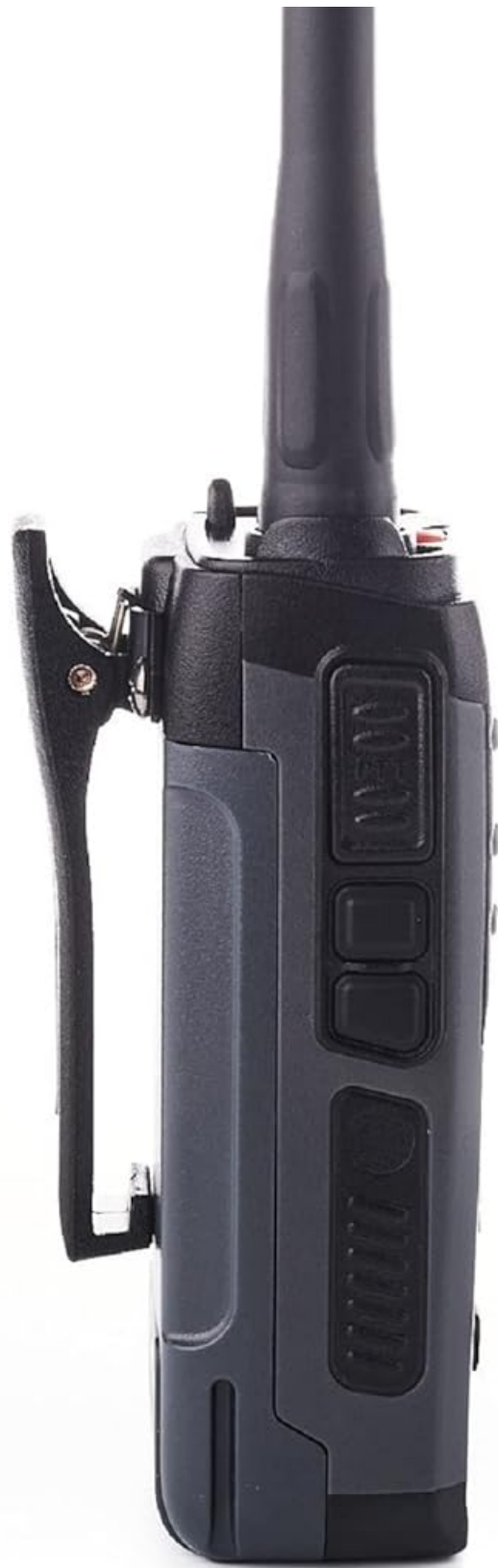
Image: Side view of the Dynascan LP-50 walkie-talkie with the belt clip attached, showing how it can be worn.