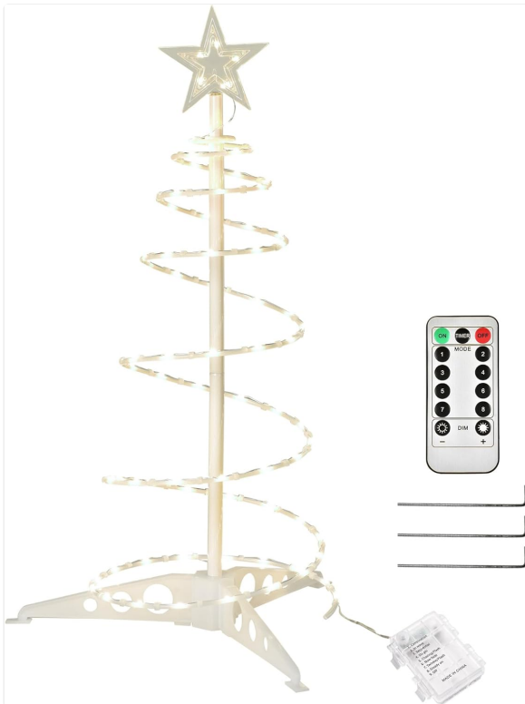
Image: The fully assembled LED spiral tree light, showing the remote and ground stakes.