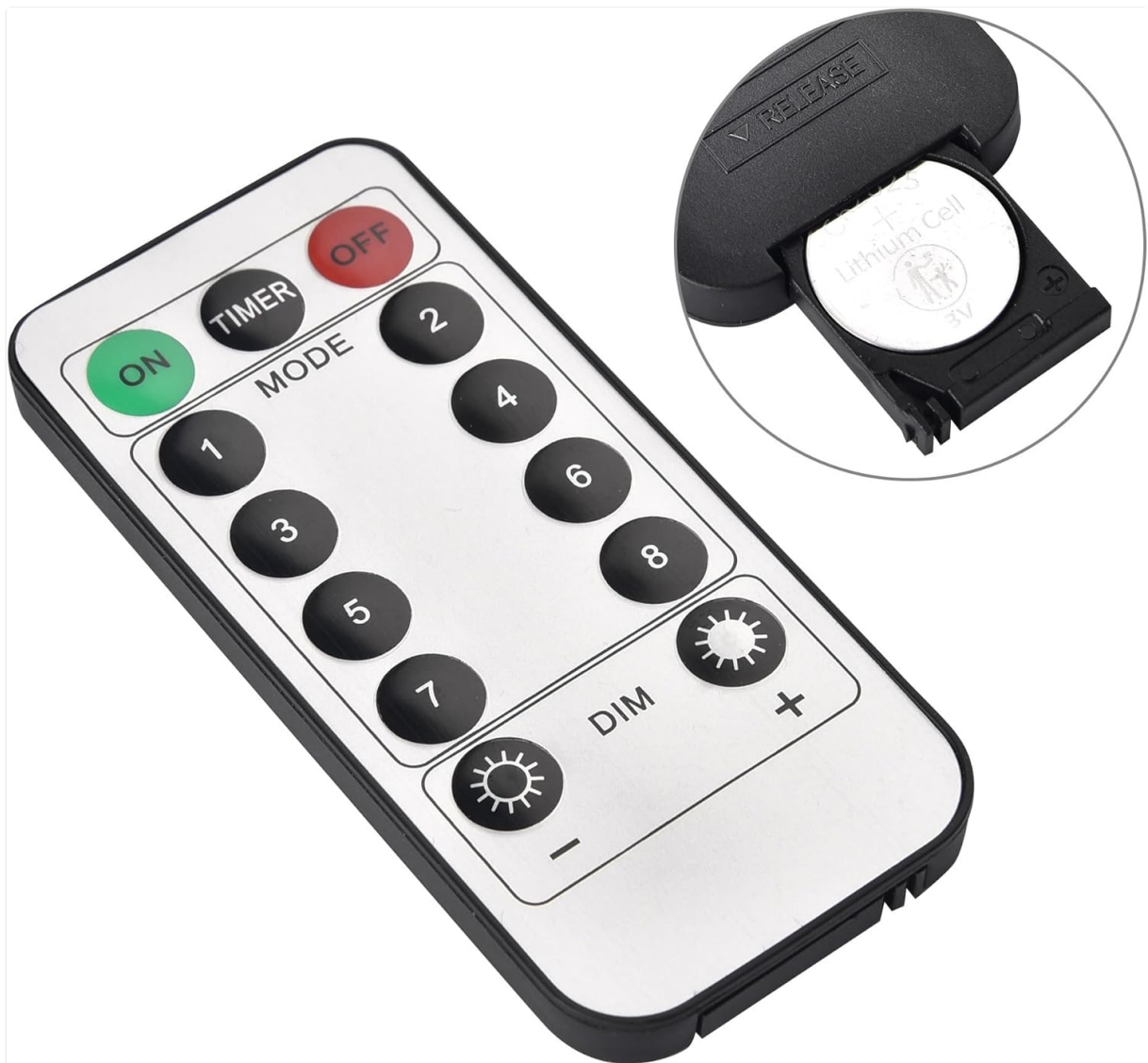
Image: Remote control with various function buttons.