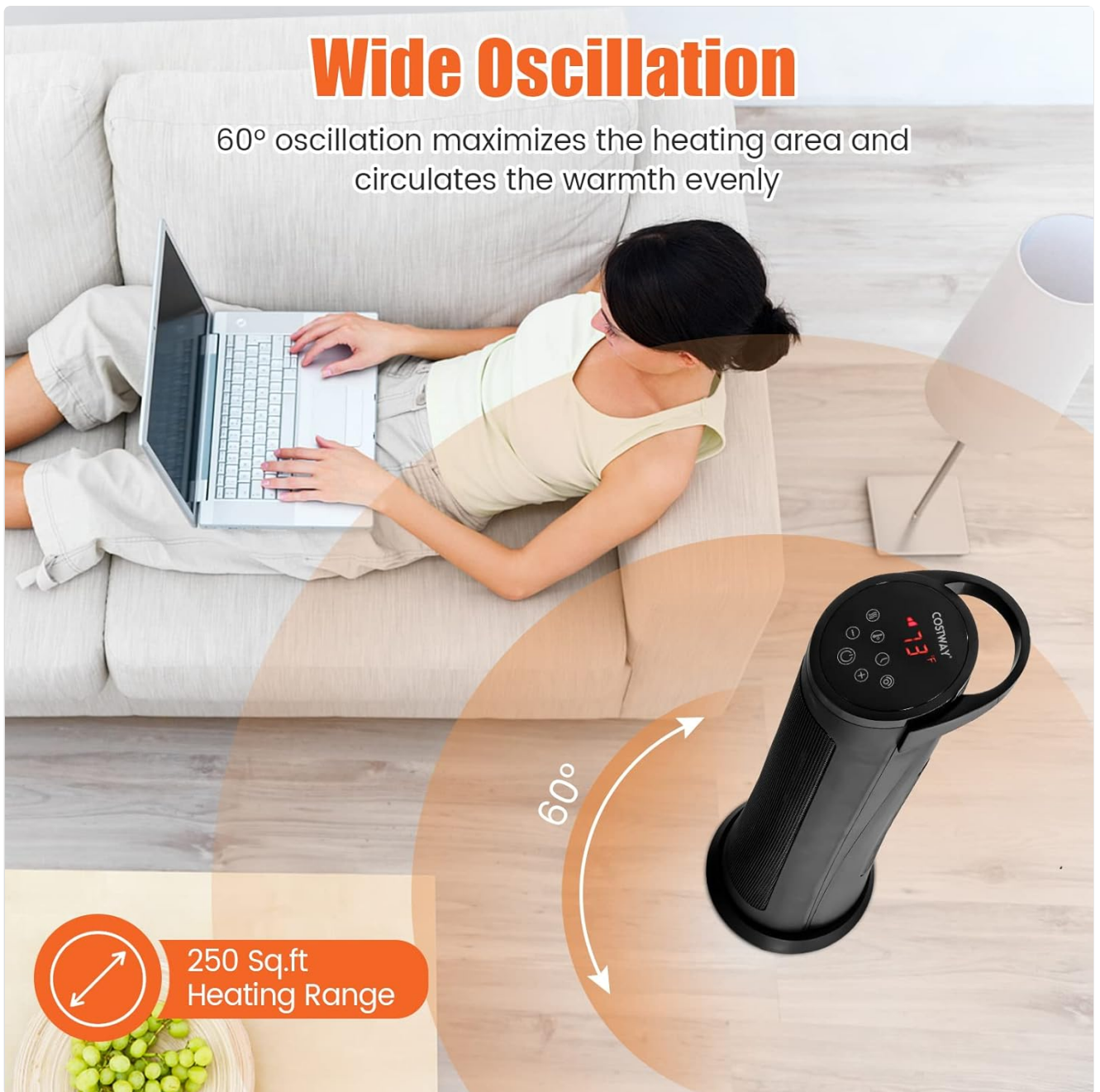
Figure 5: Heater demonstrating 60° oscillation for wide heat distribution.