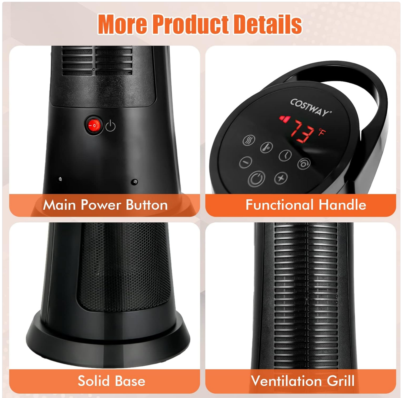
Figure 2: Key components of the heater including the main power button, functional handle, solid base, and ventilation grill.