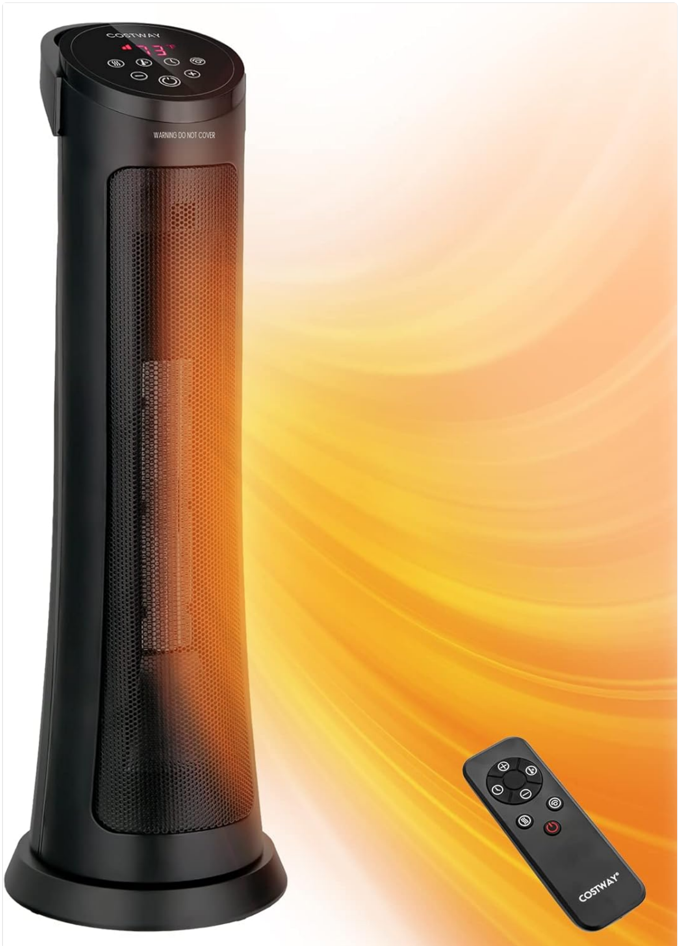
Figure 1: Front view of the COSTWAY 1500W PTC Ceramic Space Heater.