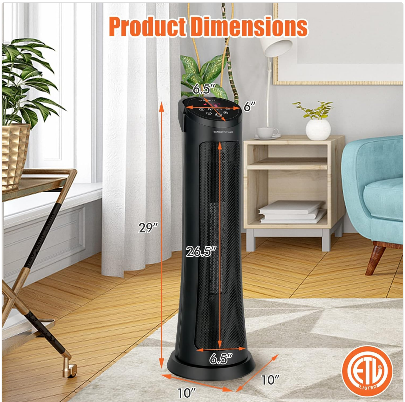
Figure 7: Product dimensions for the COSTWAY Space Heater.