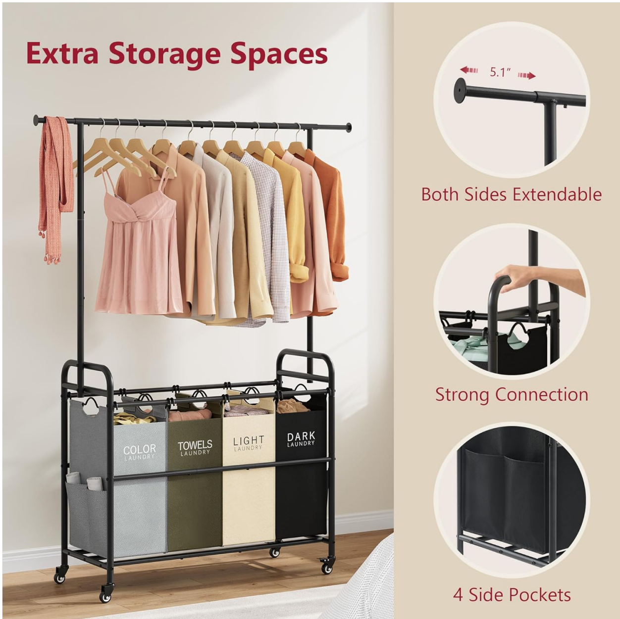
Image: Details of the extendable hanging bar, robust frame connections, and convenient side pockets on the laundry bags.

7. Final Check: Verify that all screws are tightened and the frame is stable.