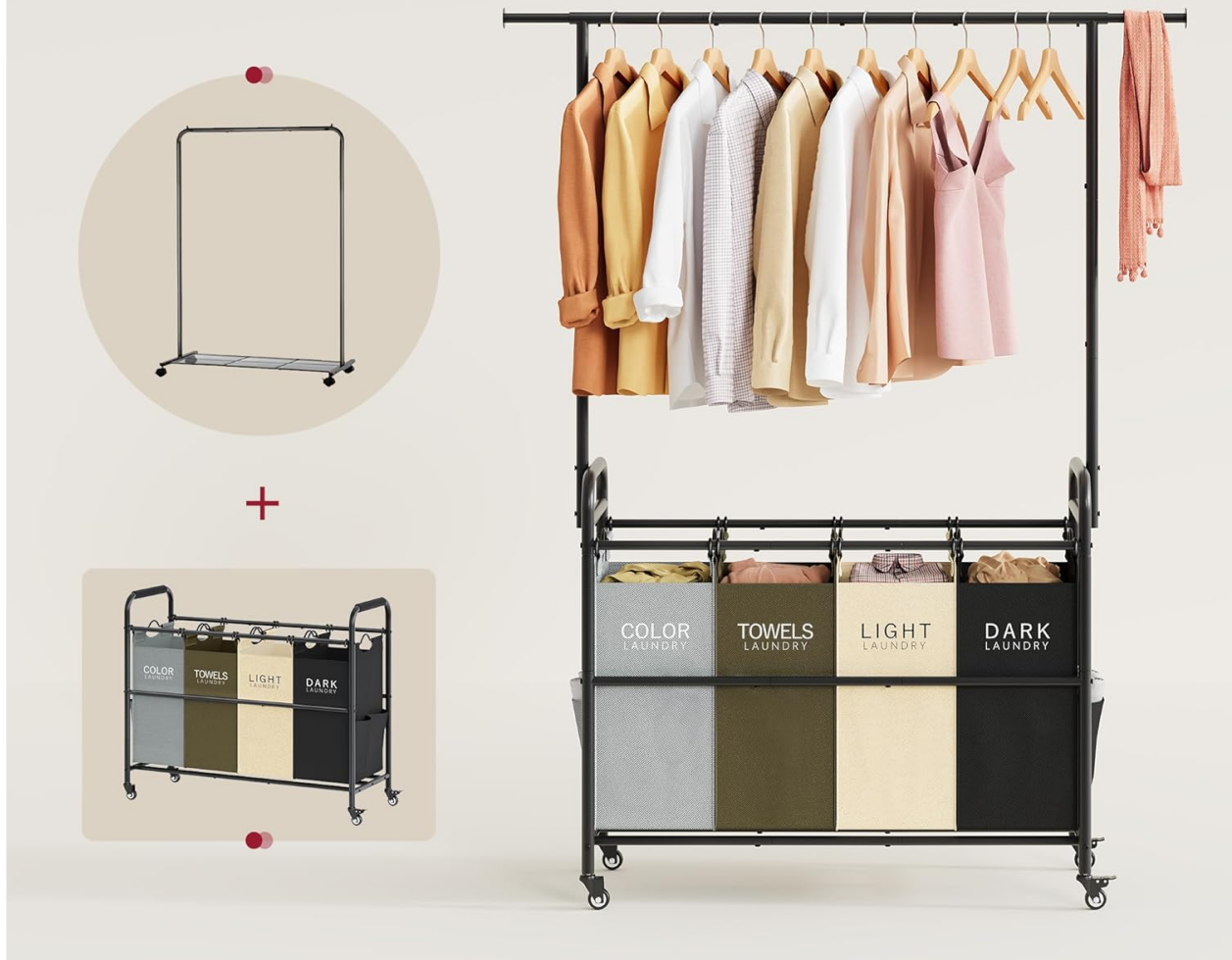
Image: Overview of the laundry cart's components, illustrating the 2-in-1 design with the hanging rack and the four-section sorter.

Efficient all-in-one solutions to meet all your laundry needs