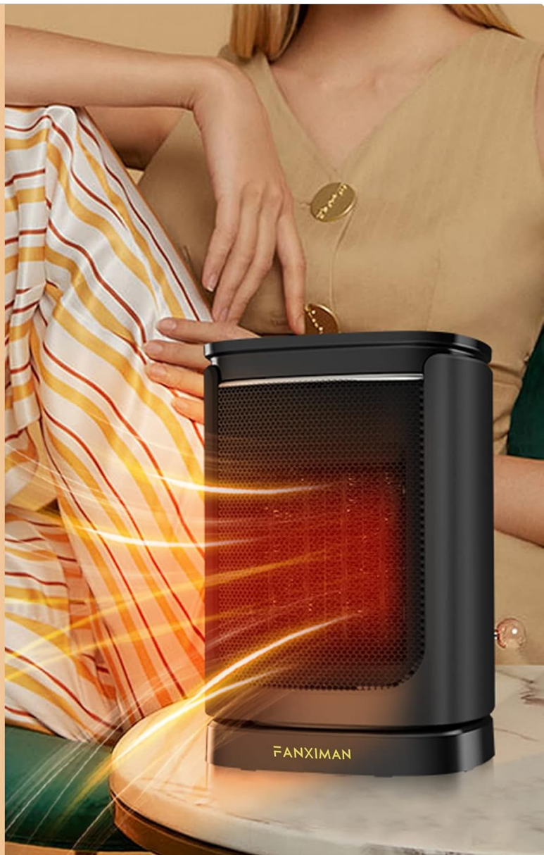
Image: An illustration highlighting six advantages of the FANXIMAN BG-EH010 heater: Cooling and Cold Use, Circular Air, Great Angle (Oscillation), 12H Timing, Remote Control, and Mute operation.