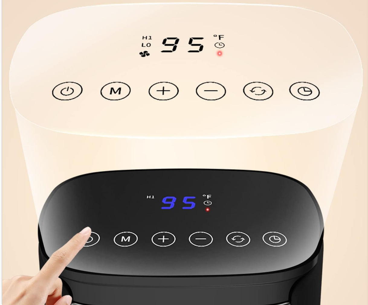
Image: Close-up view of the FANXIMAN BG-EH010 heater's top control panel, showing the LCD display and touch buttons for power, mode, temperature adjustment, oscillation, and timer. The display shows '95°F'.

Touch your fingertips, and warm up at your fingertips