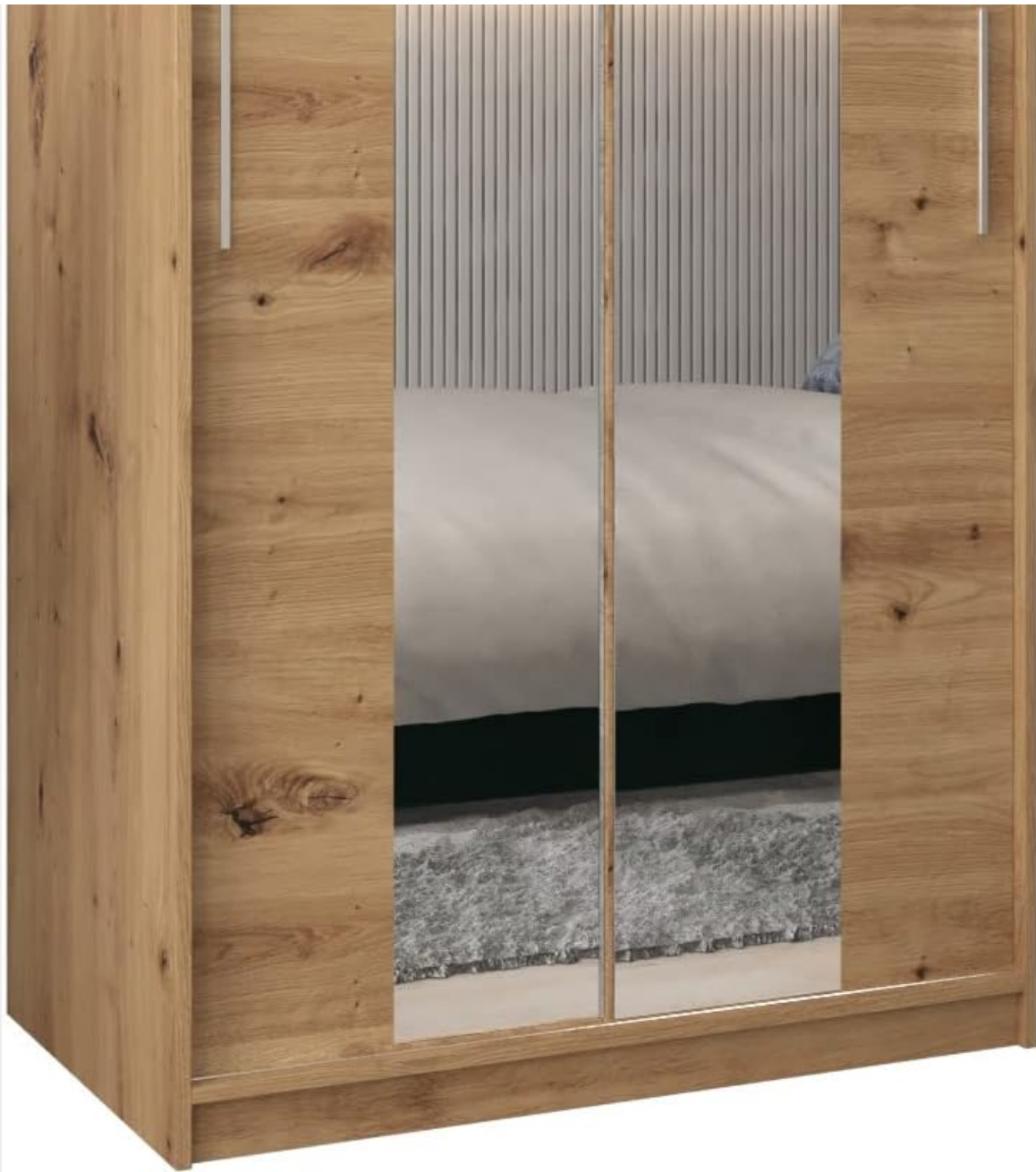
Image 1.1: Front view of the ABIKSMEBLE Tokio 100 Wardrobe with mirror doors.