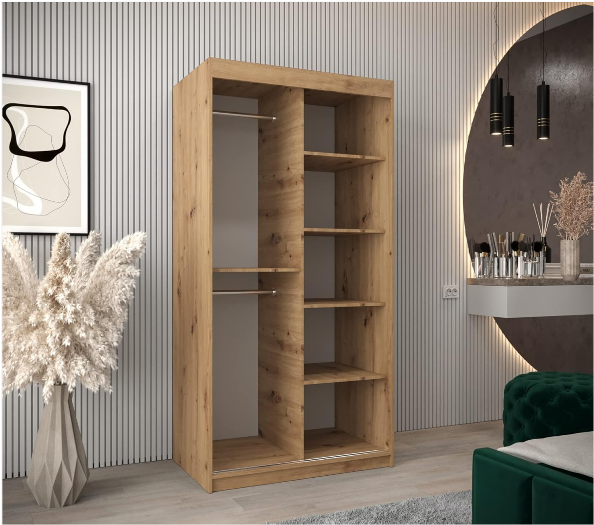
Image 3.1: Internal configuration of the wardrobe, highlighting storage options.