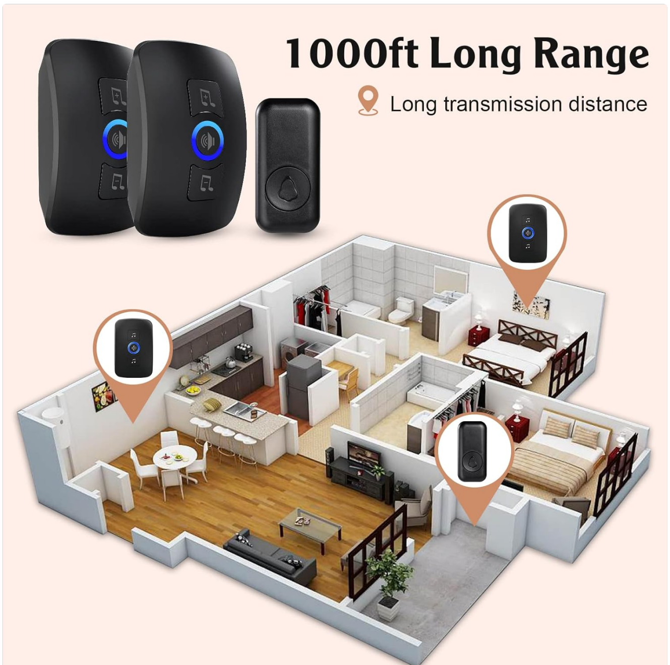
Image: Illustration of the doorbell's 1000ft long-range capability, suitable for various home layouts.