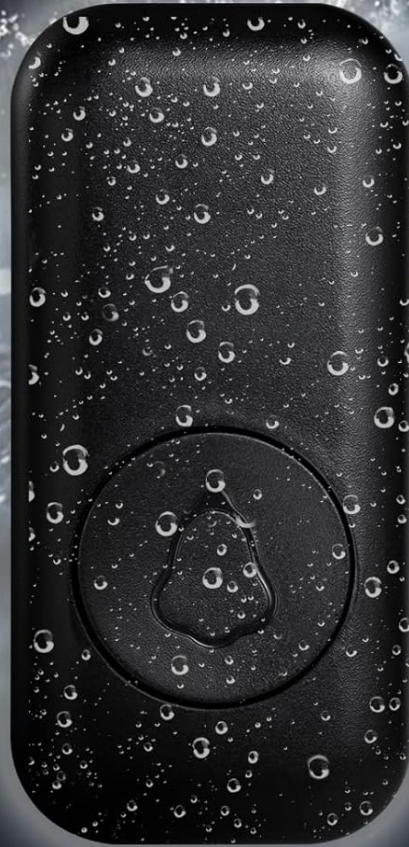
Image: The IP55 waterproof push button is built to endure outdoor elements, ensuring durability.