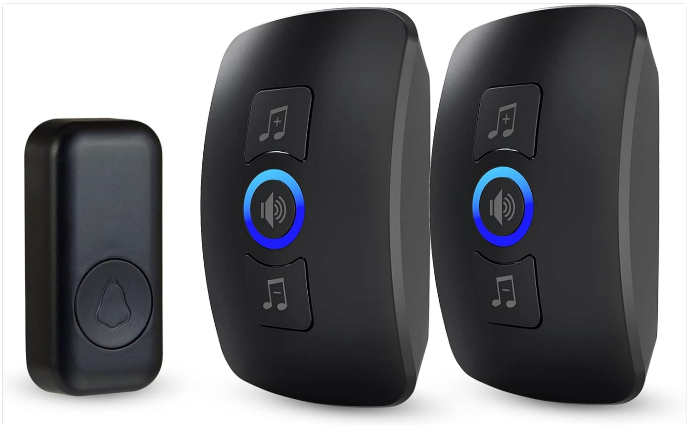
Image: The complete KERUI Wireless Doorbell Kit, including the outdoor push button and two indoor plug-in receivers.

The KERUI Wireless Doorbell Kit provides a reliable and convenient solution for home and office security. It features a waterproof push button transmitter and two plug-in receivers, offering a wide range of customizable melodies and adjustable volume levels. Designed for easy installation, this kit ensures you never miss a visitor.