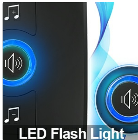
Image: The receiver's LED flash light provides a visual alert when the doorbell is pressed.

In addition to the audible chime, the receivers feature an LED flash indicator. This visual alert is particularly useful for the elderly, in noisy environments, or for individuals with hearing impairments.