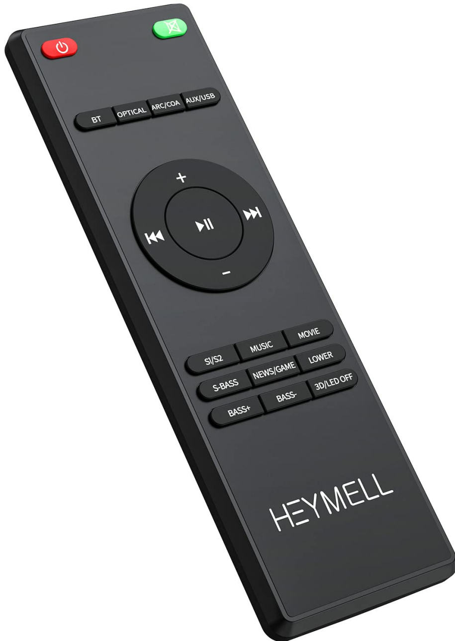
Figure 1: Heymell Remote Control for Voyage203 Soundbar. This image displays the remote control with its various buttons for power, input selection, volume, playback, and sound modes.

The Heymell Remote Control is an infrared (IR) remote designed to control the Heymell Soundbar Voyage203. It provides access to all essential functions of the soundbar, including power, volume, input selection, and various sound modes.