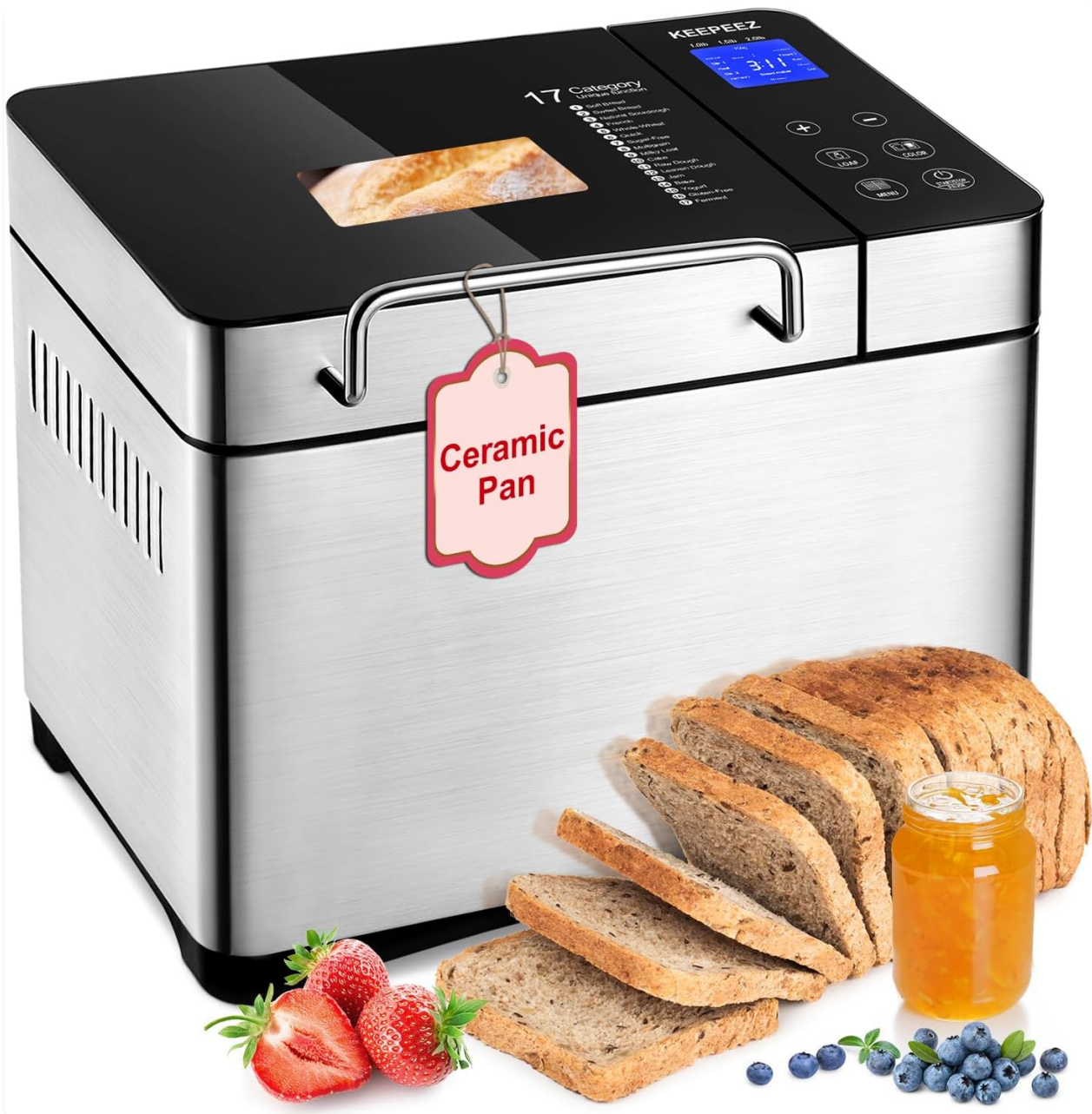
Figure 1: KEEPEEZ 17-IN-1 Stainless Steel Bread Maker with accessories and freshly baked bread.