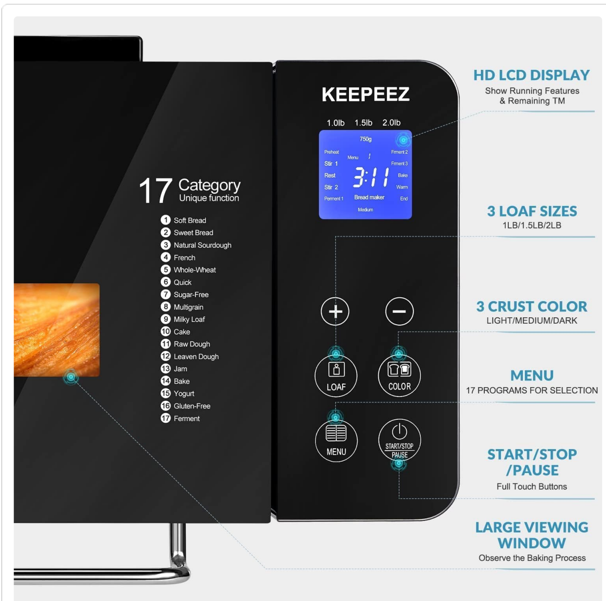
Figure 2: Detailed view of the digital touch panel, displaying 17 unique functions, loaf size options (1.0lb, 1.5lb, 2.0lb), and crust color selections (Light, Medium, Dark).