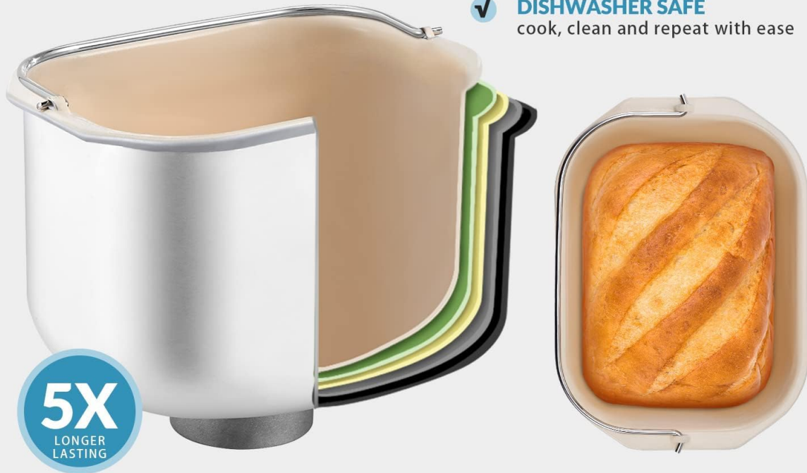
Figure 4: Cross-sectional view of the premium 5-layer ceramic pan, emphasizing its non-stick, toxin-free, and durable construction for healthy baking.