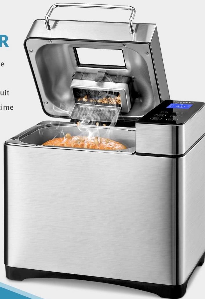
Figure 5: The automatic fruit and nut dispenser, designed for convenient, hands-free addition of ingredients during the baking process.