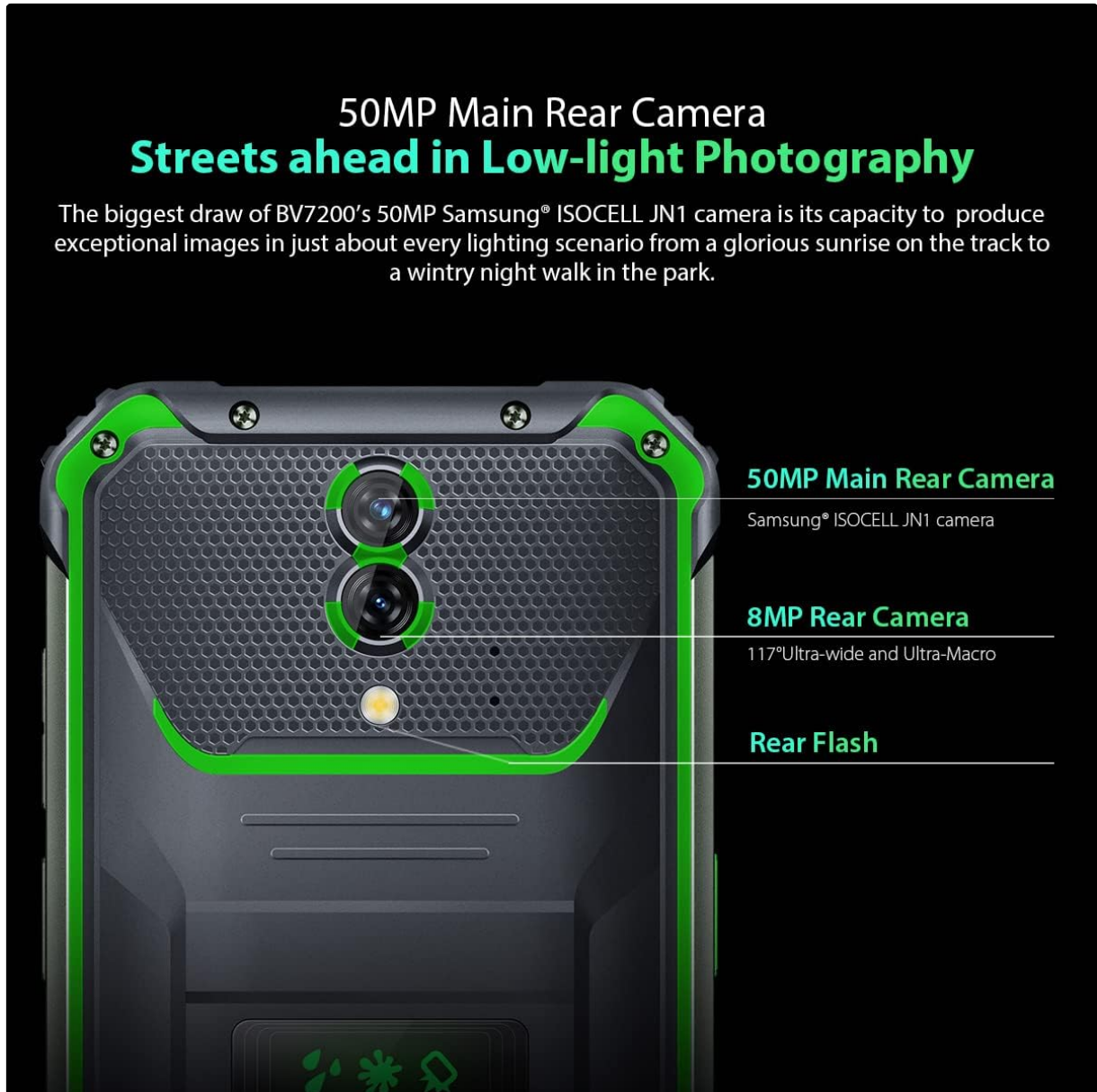
Image: Diagram illustrating the Blackview BV7200's 50MP Samsung ISOCELL JN1 main rear camera, 8MP ultra-wide and ultra-macro rear camera, and rear flash, highlighting its photographic capabilities.