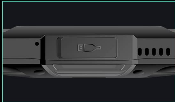
Tightly-fit cap for charging port for enhanced water-resistance

Image: Close-up views of the Blackview BV7200's rugged construction, including aluminum alloy frame, double-shot molding TPU rubber, thickened rubber corners, and the tightly-fit cap for the charging port, emphasizing its durability and water resistance.