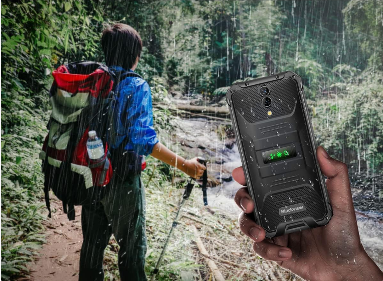
Image: A person holding the Blackview BV7200 near a stream or waterfall, illustrating its water resistance and suitability for outdoor and aquatic activities.

Backed by cutting-edge IP68 and IP69K certified water and dust-proofness, BV7200 is poised to assist you in snapping your thrilling moments whether you are plunging into or having fun in a swimming pool, or in a flowing river or a placid lake.