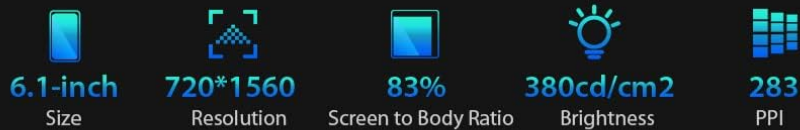
Image: Graphic detailing the Blackview BV7200's 6.1-inch HD+ display specifications, including resolution (720x1560), screen-to-body ratio (83%), brightness (380cd/cm 2 ), and PPI (283), emphasizing its visual quality and durability with Corning Gorilla Glass 3.