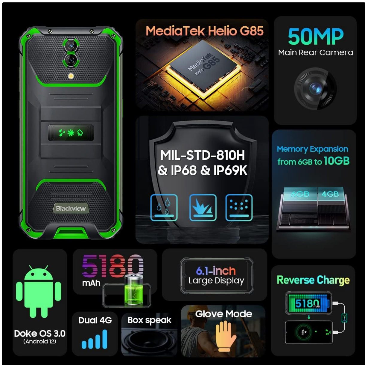
Image: Overview of the Blackview BV7200 Rugged Smartphone, highlighting its MediaTek Helio G85 processor, 50MP camera, IP68/IP69K ratings, 5180mAh battery, 6.1-inch display, and Glove Mode.