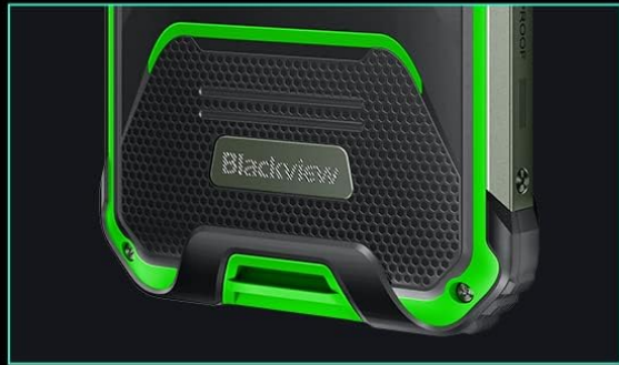
Double-shot molding TPU soft rubber for great protection against drops and cracks