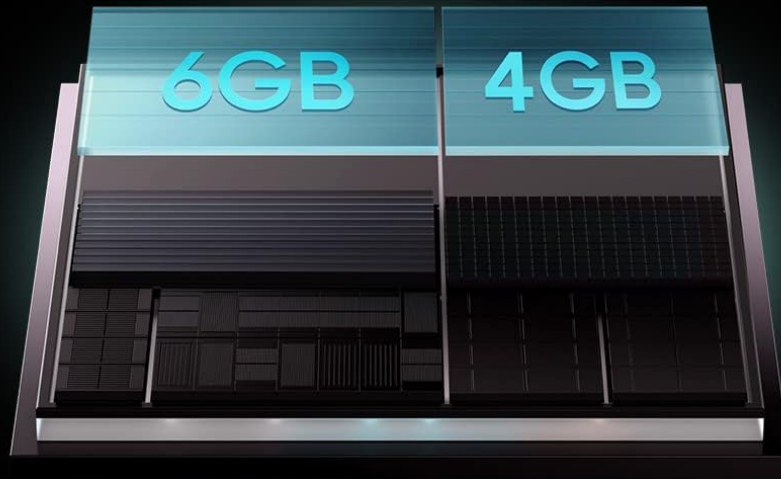
Image: Graphic illustrating the memory expansion feature of the Blackview BV7200, showing 6GB of physical RAM and an additional 4GB of virtual RAM, combining for a total of 10GB for improved performance.

To further expand memory without extra cost, BV7200 provides Memory Expansion Technology that can compress data and save them in RAM to enlarge memory capacity to 10GB. BV7200 gives you an edge to multitask with ultra-smoothness and remarkable fluency whether you are gaming, streaming or working.