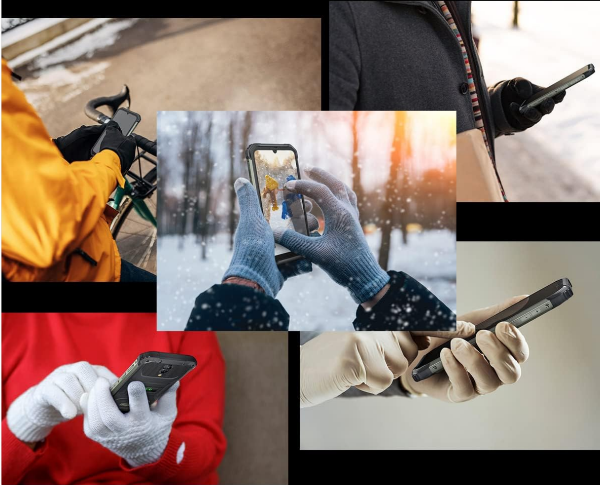
Image: Collage demonstrating the Blackview BV7200's Glove Mode in various scenarios, showing users operating the phone while wearing different types of gloves, emphasizing its utility in cold or industrial environments.

With the idea of convenient smartphone usage firmly in mind, Blackview designs BV7200 with specialized Glove-mode that is capable of responding to different gloves-on conditions