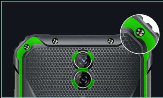
Aluminium alloy frame fixed with screws for reduced risks of falling apart

BV7200 is the next mighty solution to severe and demanding-environment by Blackview Team devoted to rugged smartphones for 9 years. BV7200 ticks all the boxes of ultra-durable device whether in sandy construction sites, in challenging hikes or exploration into a muddy jungle or in whatever harsh conditions.