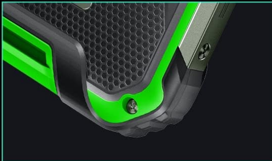
Thickened rubber corner for outstanding shockproof performance