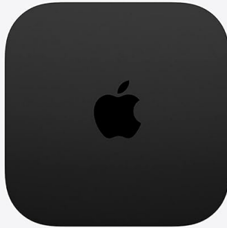
Apple TV 4K