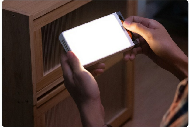
Image: The ZHIYUN FIVERAY M40 video light being placed into a pocket, illustrating its compact and portable design.

Embedded with 176 LED chips that bring an incredible peak illuminance of 14000 lux, ZHIYUN M40 rivals the key light provided by bigger equipment.