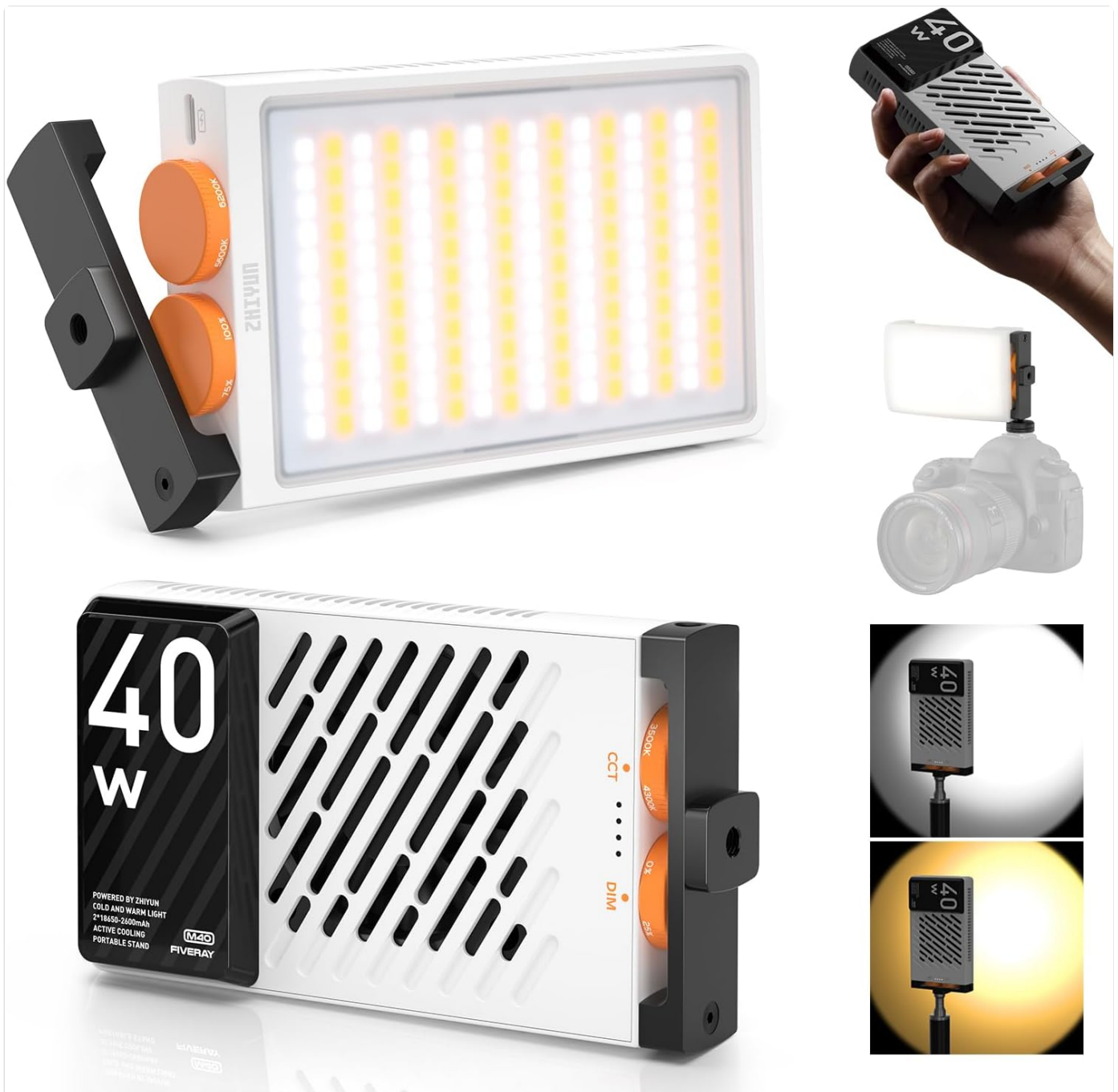
Image: Front view of the ZHIYUN FIVERAY M40 Video Light, showcasing its compact design and LED panel.