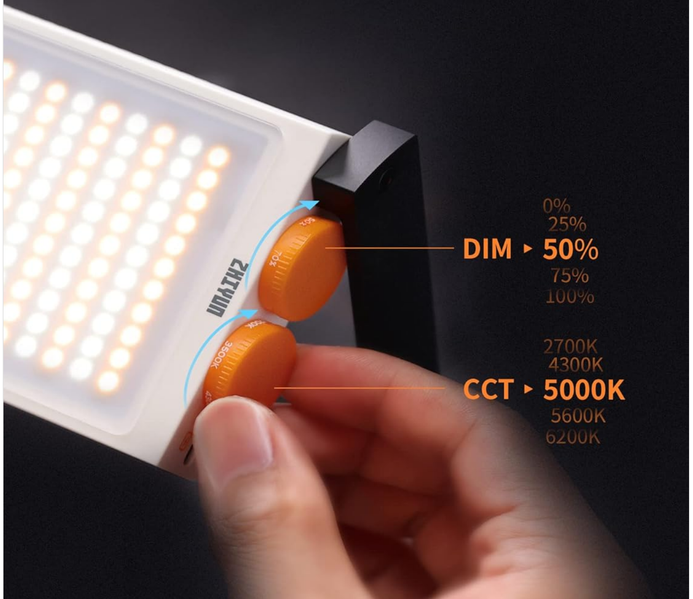
Image: The ZHIYUN FIVERAY M40 video light shown with its adjustable stand extended, demonstrating its versatility for positioning.