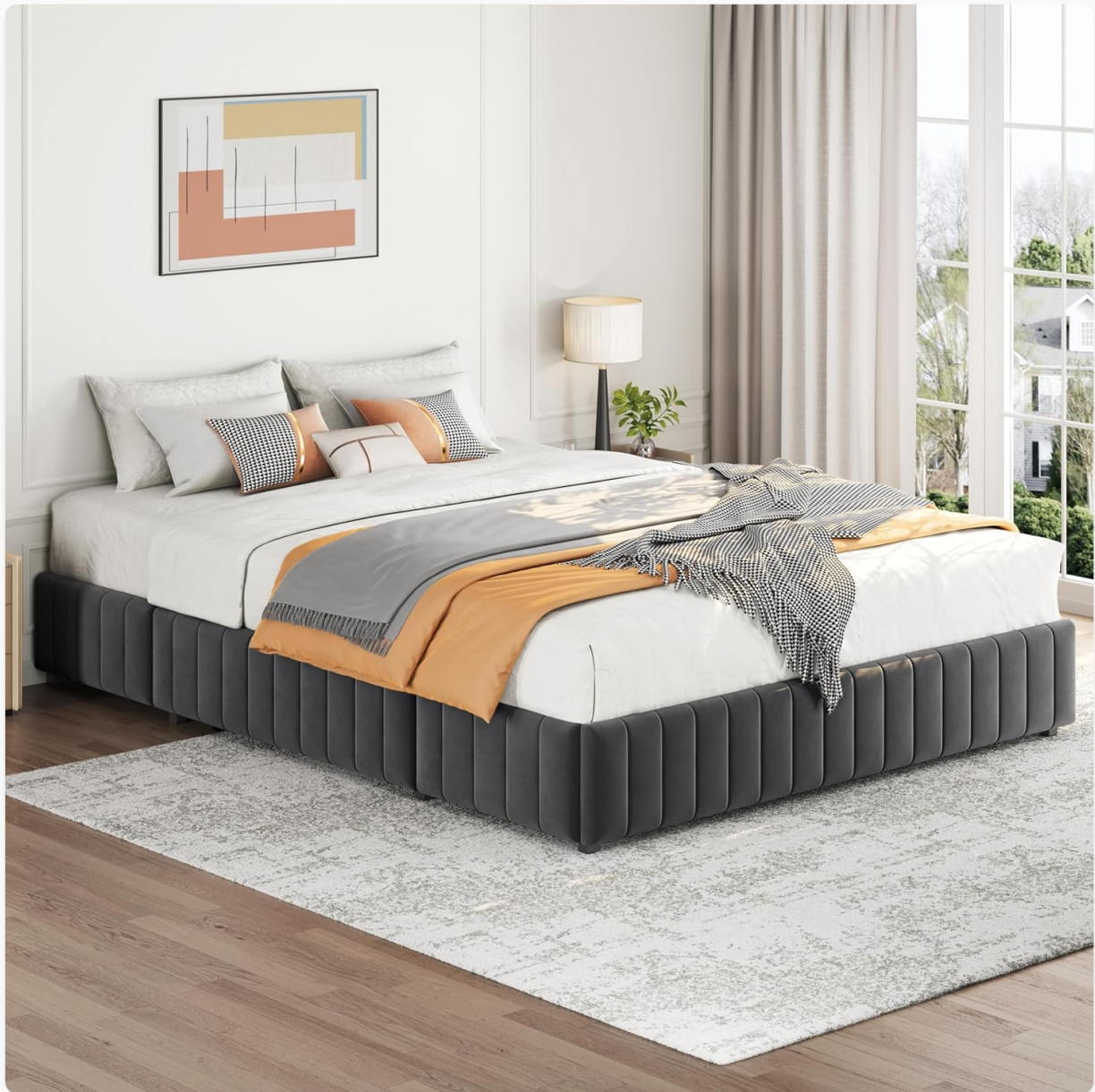
Image: Fully assembled Yaheetech Queen Upholstered Platform Bed in dark gray, showcasing its low-profile design and upholstered side panels.