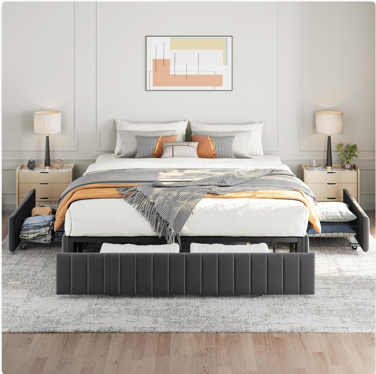
Image: The bed frame with its three wire netting storage drawers extended, showing ample space for bedding items.