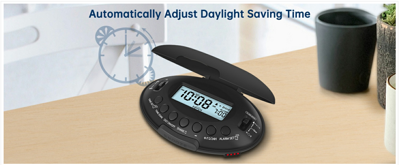
Figure 5: Automatic DST Adjustment. This image shows the alarm clock on a desk, highlighting its ability to automatically adjust for Daylight Saving Time.