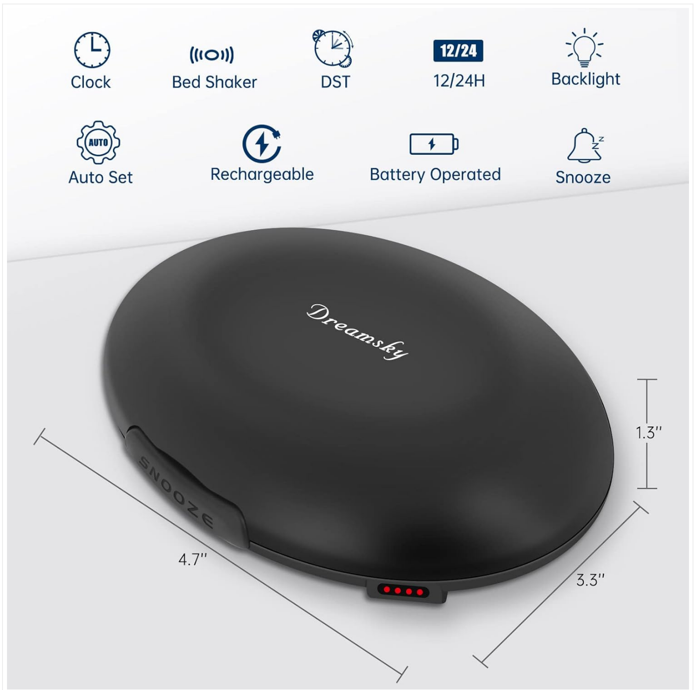
Figure 11: Product Dimensions. This image provides a visual representation of the alarm clock's width (4.7 inches) and height (1.3 inches).