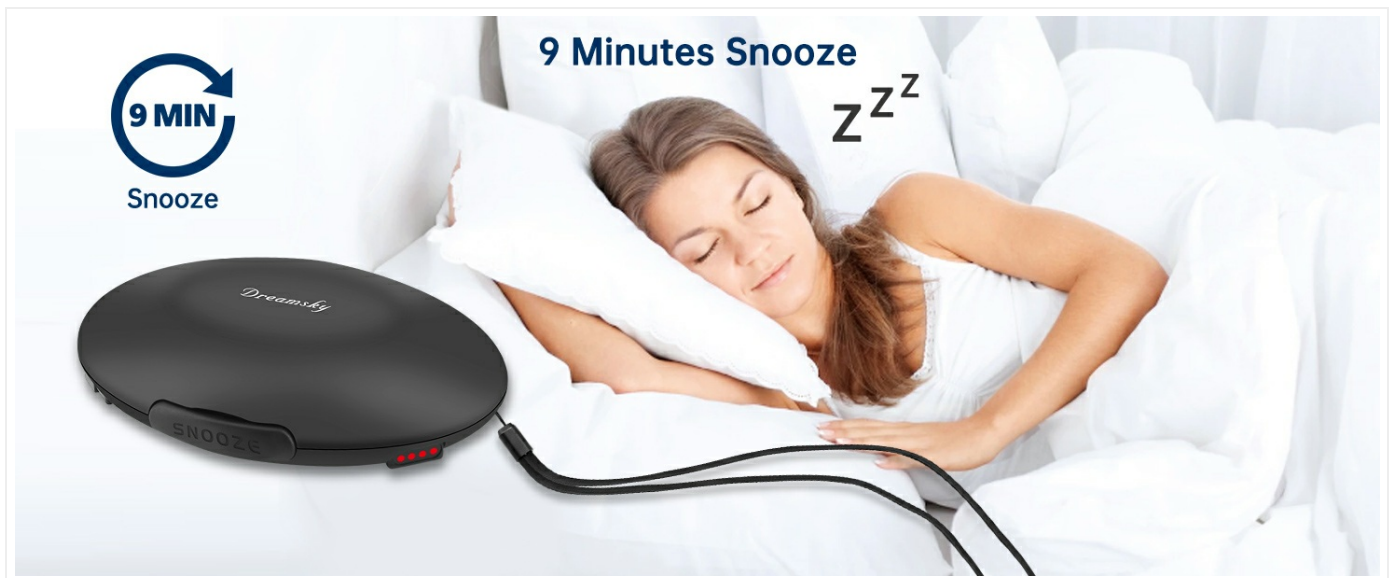
Figure 8: Snooze Function. This image shows the alarm clock under a pillow, illustrating the 9-minute snooze feature.