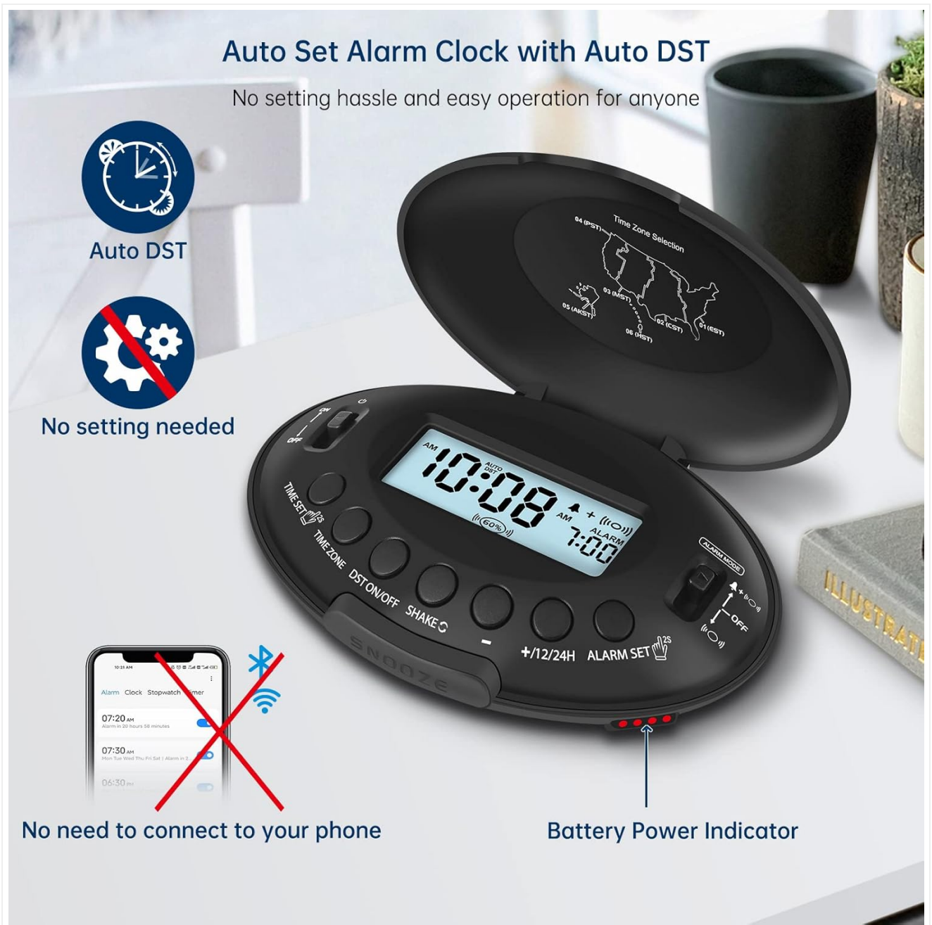
Figure 4: Auto Set and Time Zone. The image illustrates the clock's auto-setting capability and the time zone selection map located on the inside of the lid.