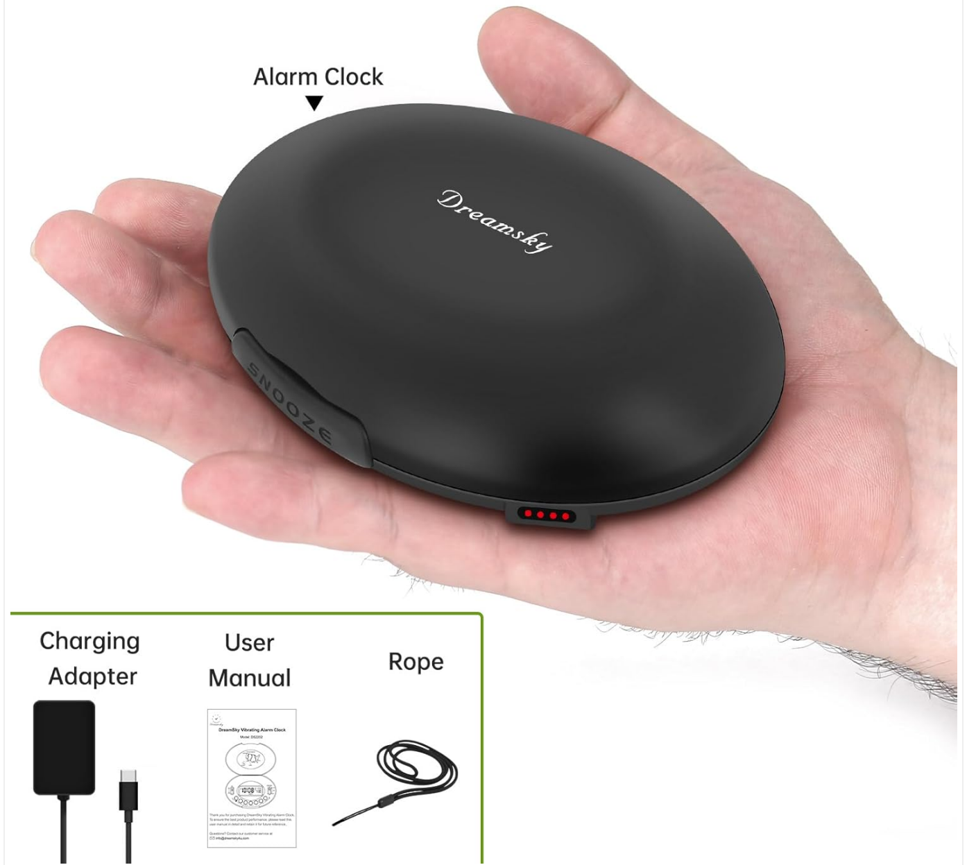
Figure 1: Package Contents. The image displays the DreamSky DS2202 alarm clock, a charging adapter, the user manual, and a lanyard/rope.