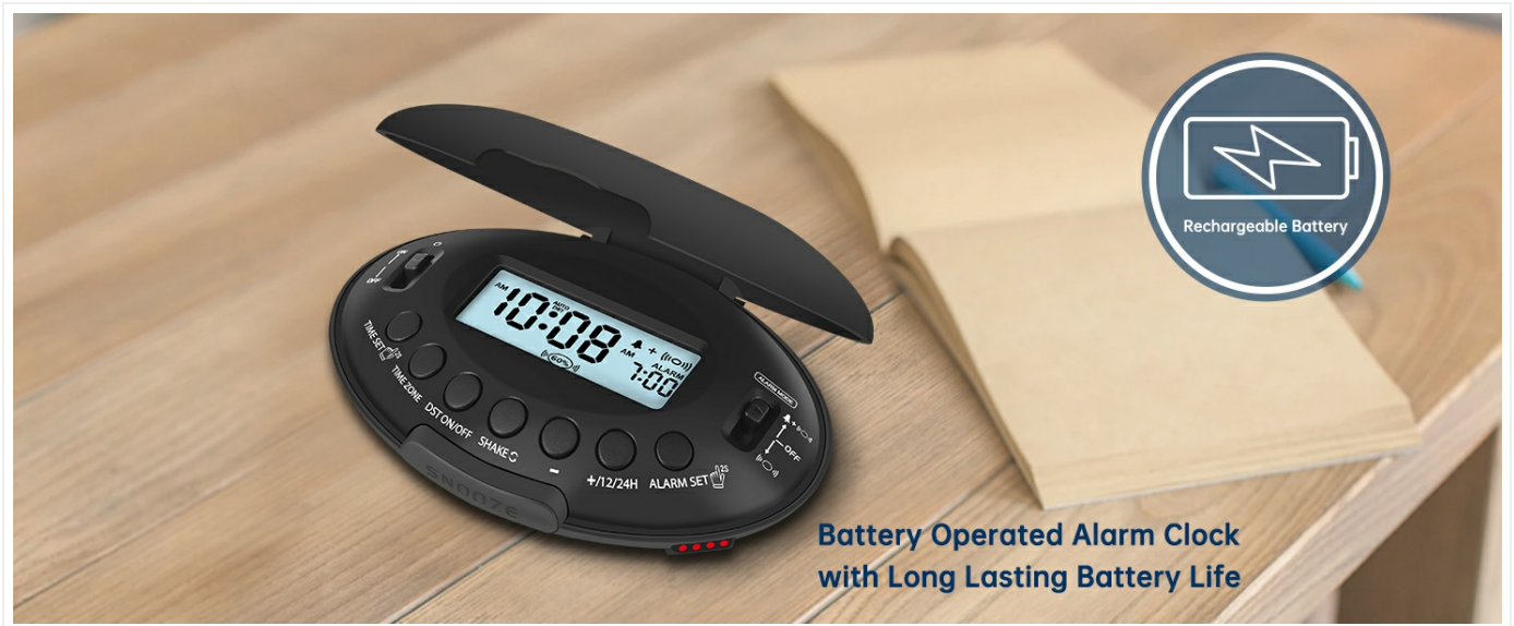
Figure 10: Rechargeable Battery. This image highlights the convenience of the alarm clock's rechargeable battery, ensuring extended use without frequent charging.