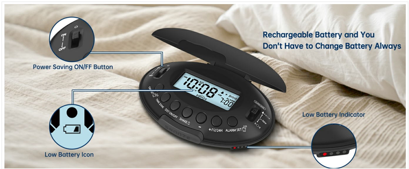
Figure 3: Power Button and Battery Indicator. This diagram highlights the power saving ON/OFF switch and the low battery indicator lights on the device.