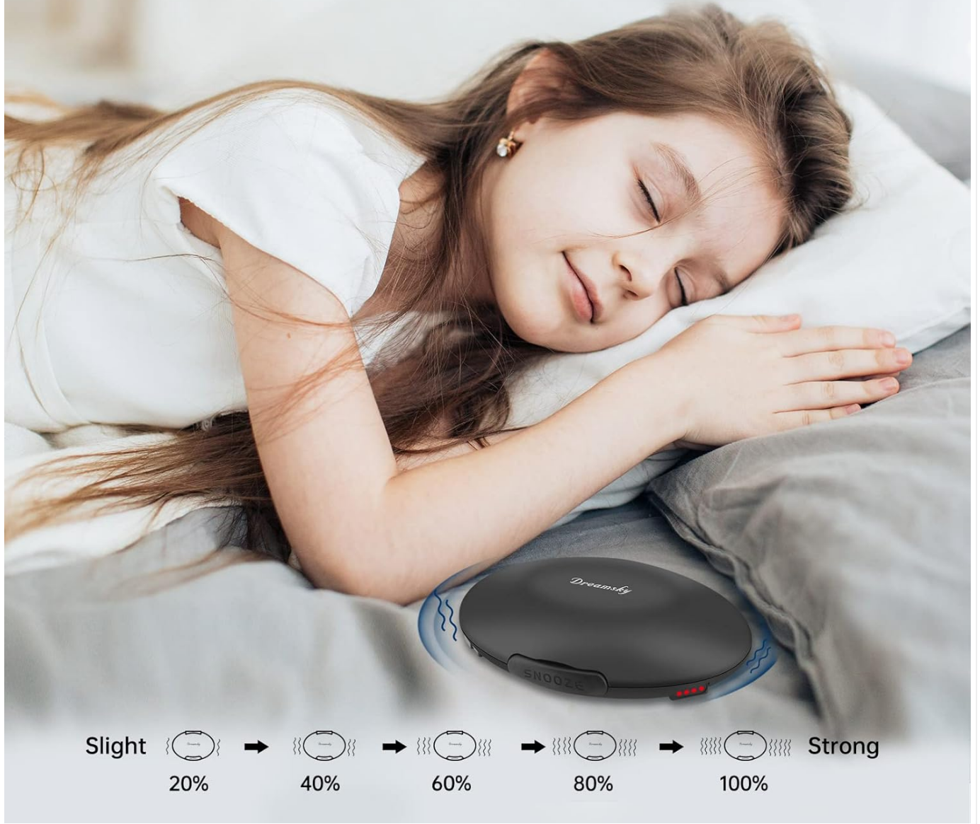
Figure 7: Customizable Vibration Levels. This image demonstrates the alarm clock's five adjustable vibration strengths, suitable for various sleep depths.

User-friendly as you can set the vibration strength to your need