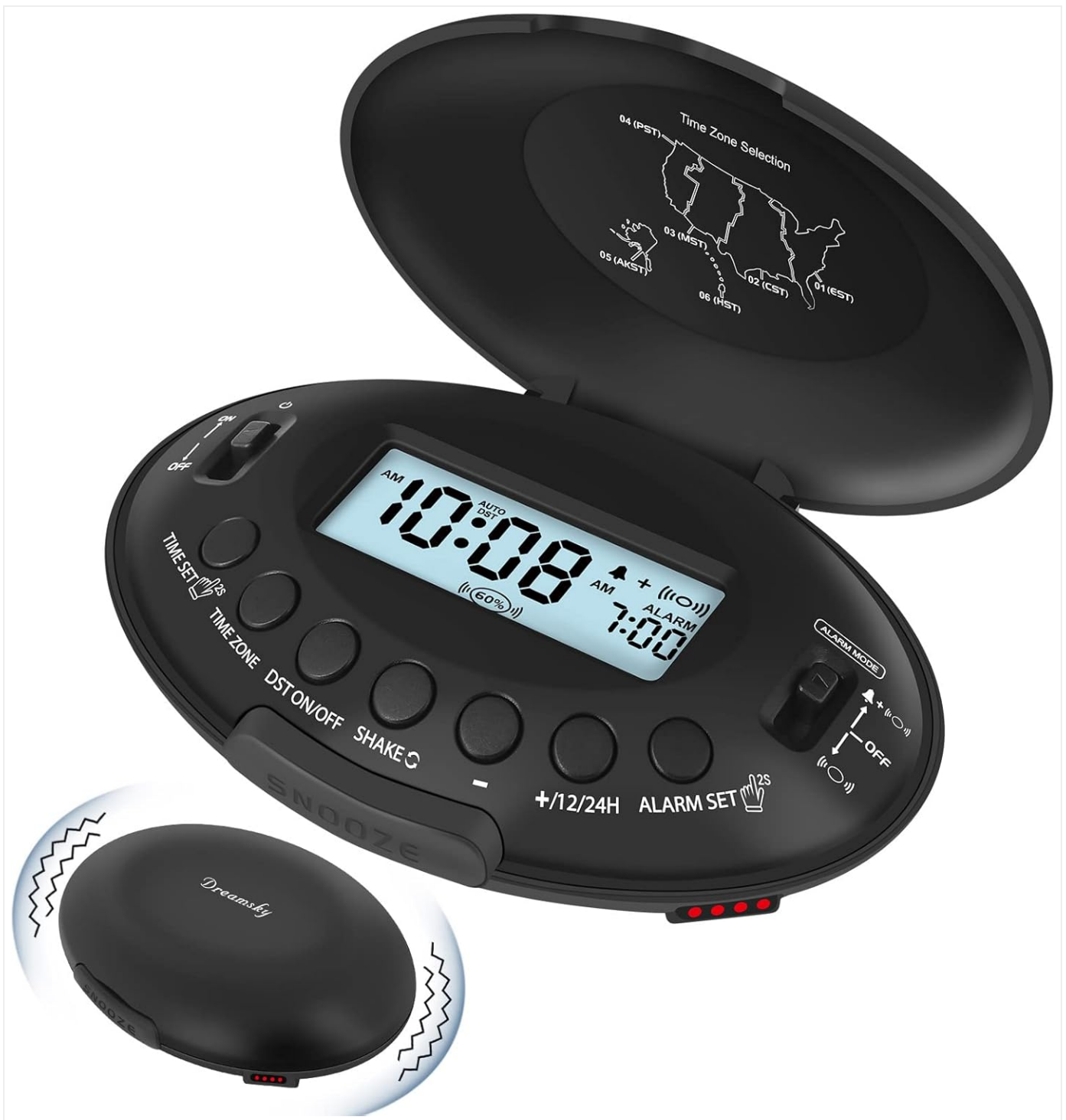
Figure 2: Front View of the Alarm Clock. This image shows the alarm clock with its protective lid open, revealing the LCD screen, time setting buttons, alarm setting buttons, and the snooze bar.