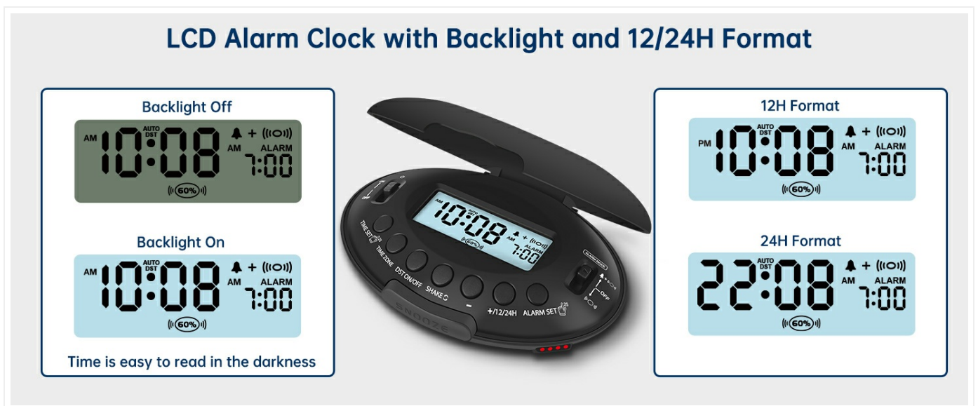
Figure 9: Time Format and Backlight. This image displays the alarm clock's LCD screen, demonstrating the 12-hour and 24-hour time formats, as well as the backlight functionality.