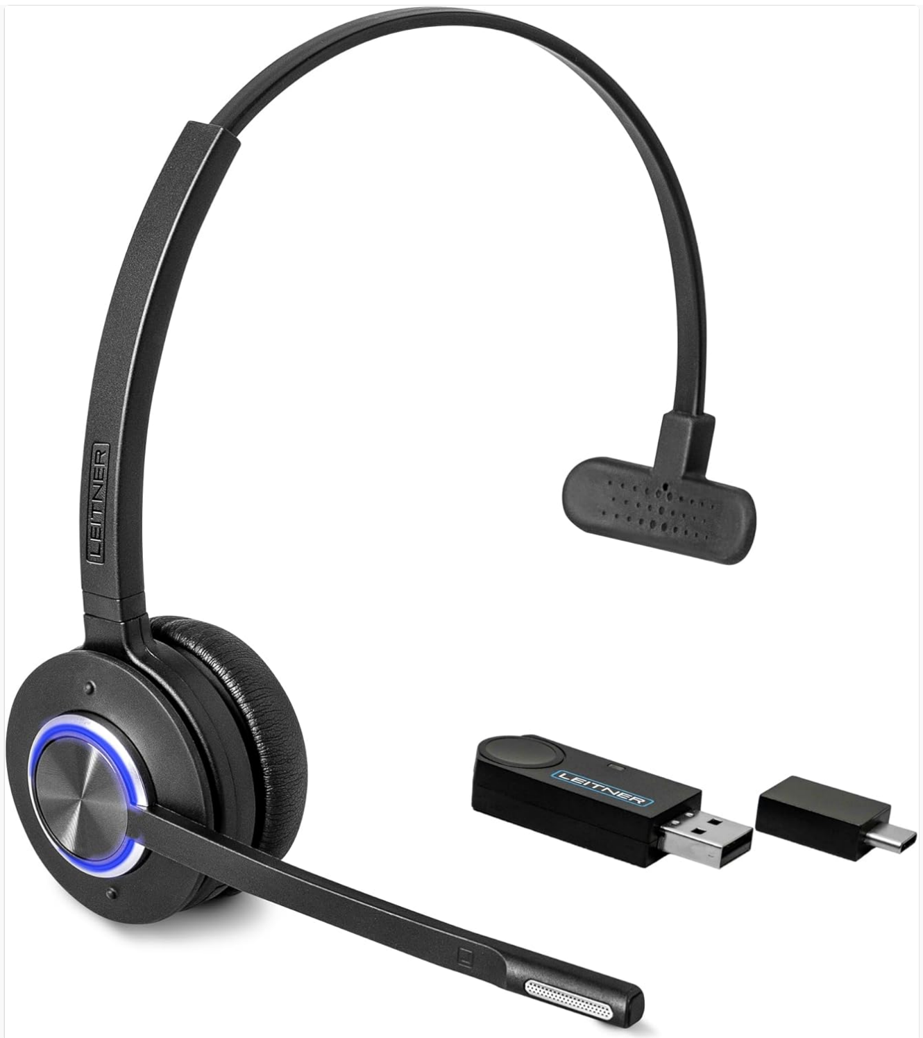
Image: Leitner LH470 Wireless Computer Headset, showing the single-ear headset, wireless USB dongle, and USB-A to USB-C converter.