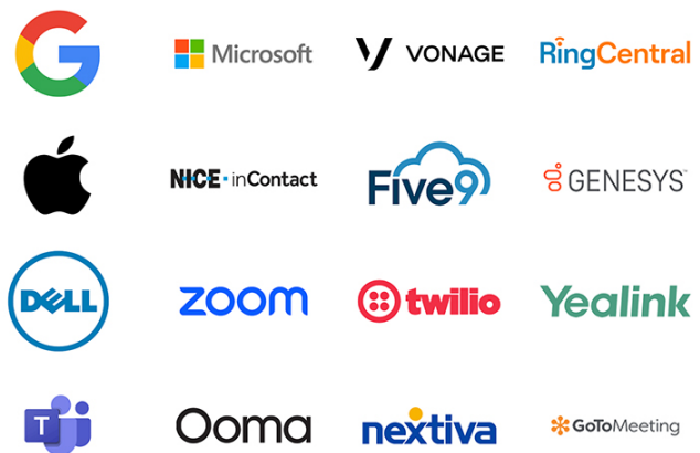
Image: Illustration of the Leitner LH470 headset's compatibility with various softphone applications and computer systems.

Compatible with 100% of softphones and computers