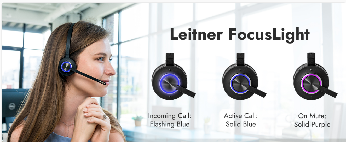
Image: Visual representation of the FocusLight LED ring indicating call status (incoming, active, muted).