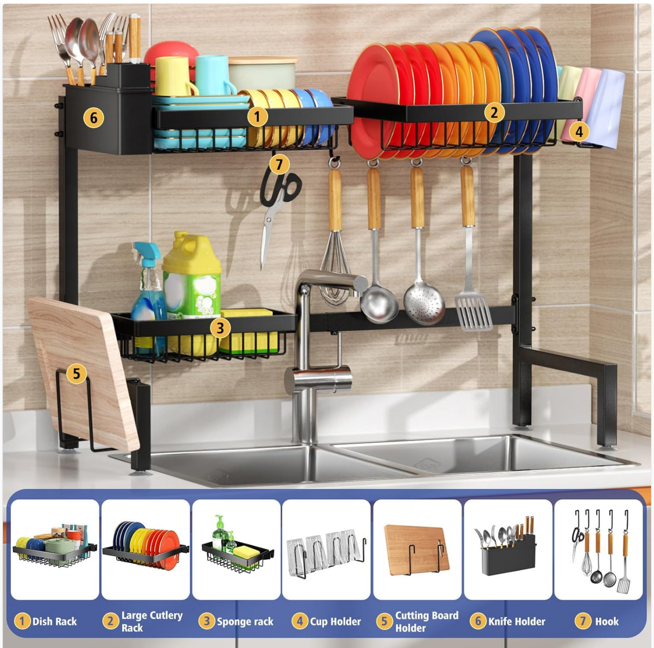
Image: Overview of all included components.