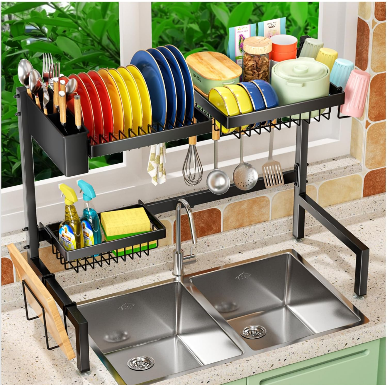
Image: The dish drying rack in typical use.