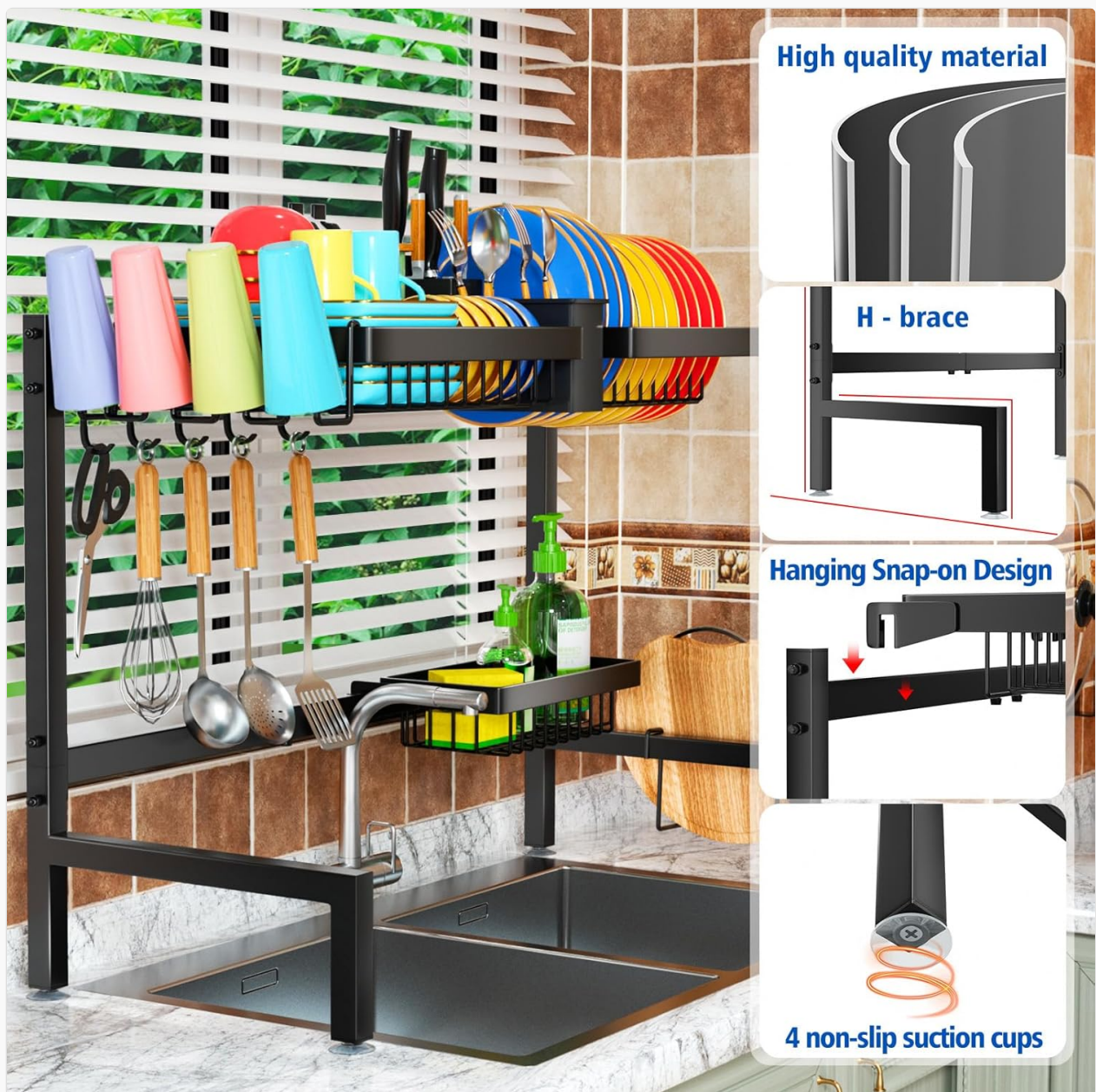
Image: Key structural features for assembly.