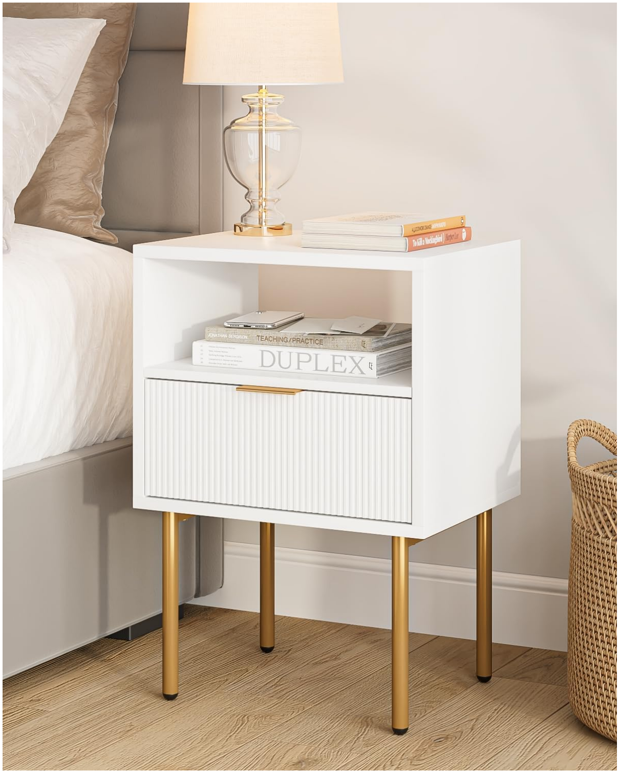
Image 1: The Masupu Nightstand (Model SW-2) in a typical bedroom environment, showcasing its white finish and gold legs.