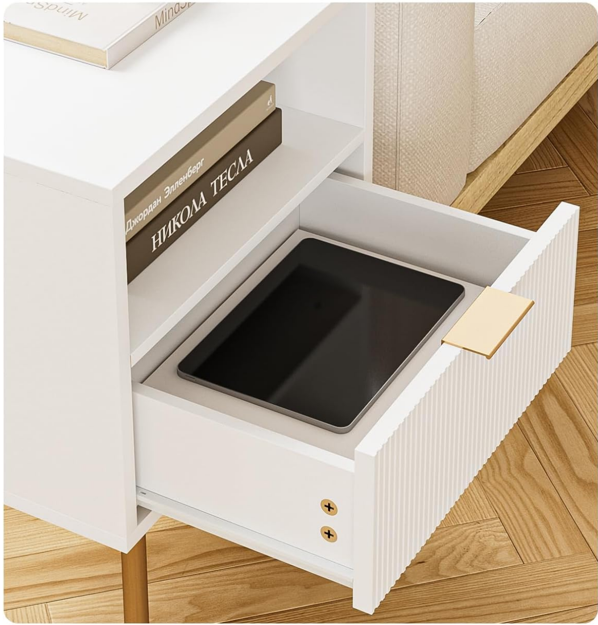
Image 5: The nightstand with its drawer open, demonstrating the storage capacity.