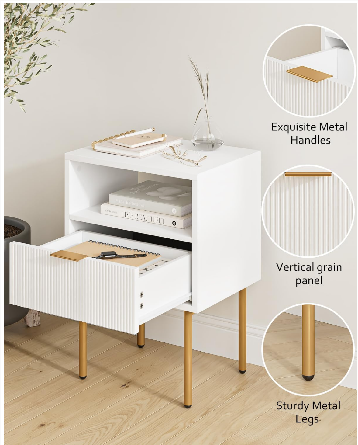
Image 4: Detail of the sturdy metal legs and the vertical grain panel of the drawer.

Secure the four metal legs to the underside of the bottom panel using the designated screws. Ensure they are tightened firmly. Apply the anti-slip rubber pads to the bottom of each leg.