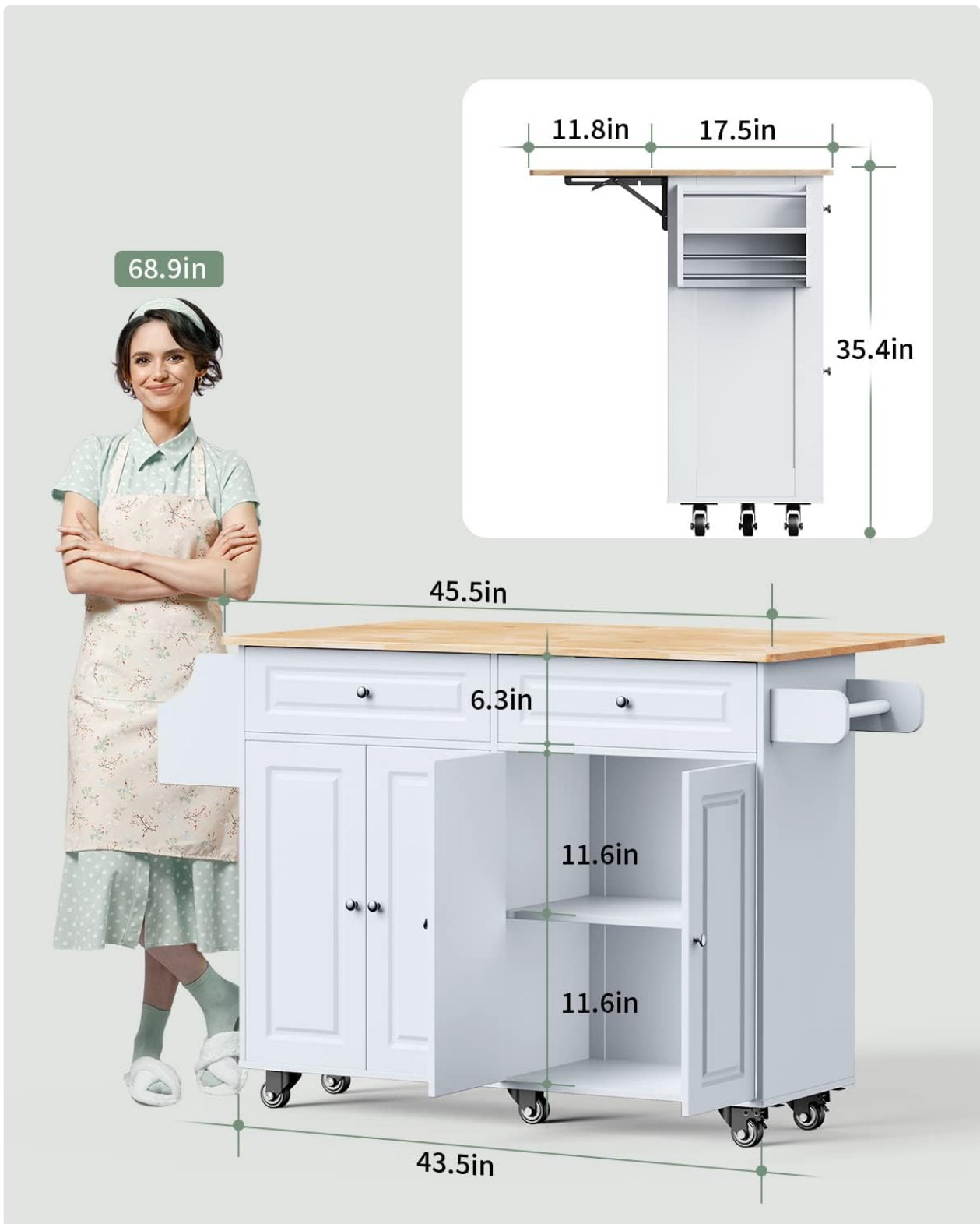
Image: A diagram illustrating the overall dimensions of the kitchen island, including the main body, the extended countertop, and the height, providing a visual guide for placement.