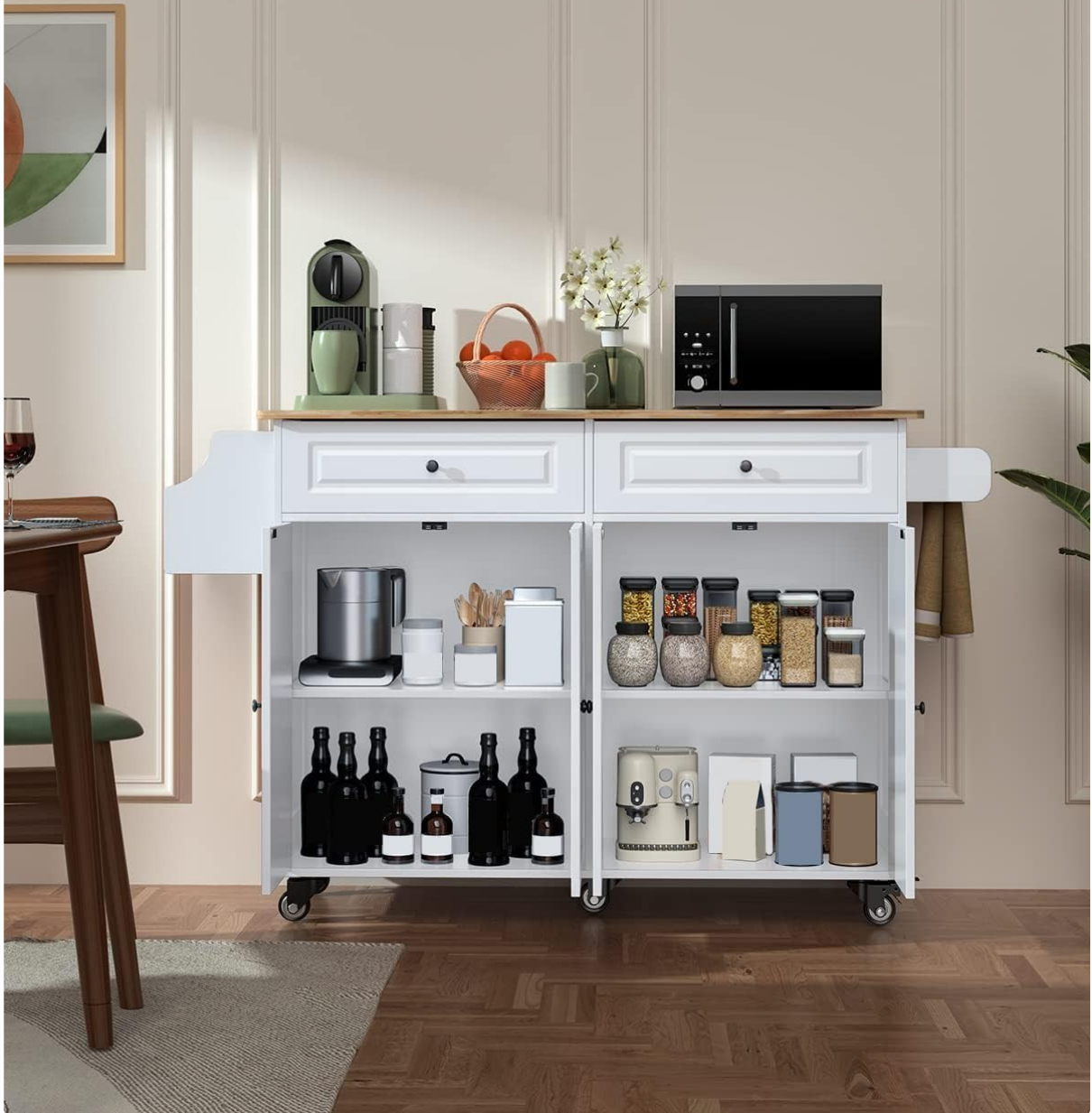
Image: The kitchen island with its double storage cabinets and two large drawers open, revealing organized kitchen utensils, bottles, and containers. This illustrates the generous storage capacity.