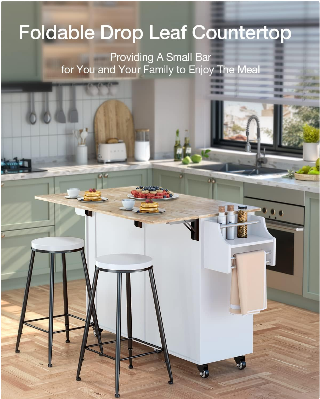
Image: The kitchen island with its drop-leaf countertop fully extended, demonstrating its use as a compact dining or bar area, complete with two stools.

Providing A Small Bar for You and Your Family to Enjoy The Meal