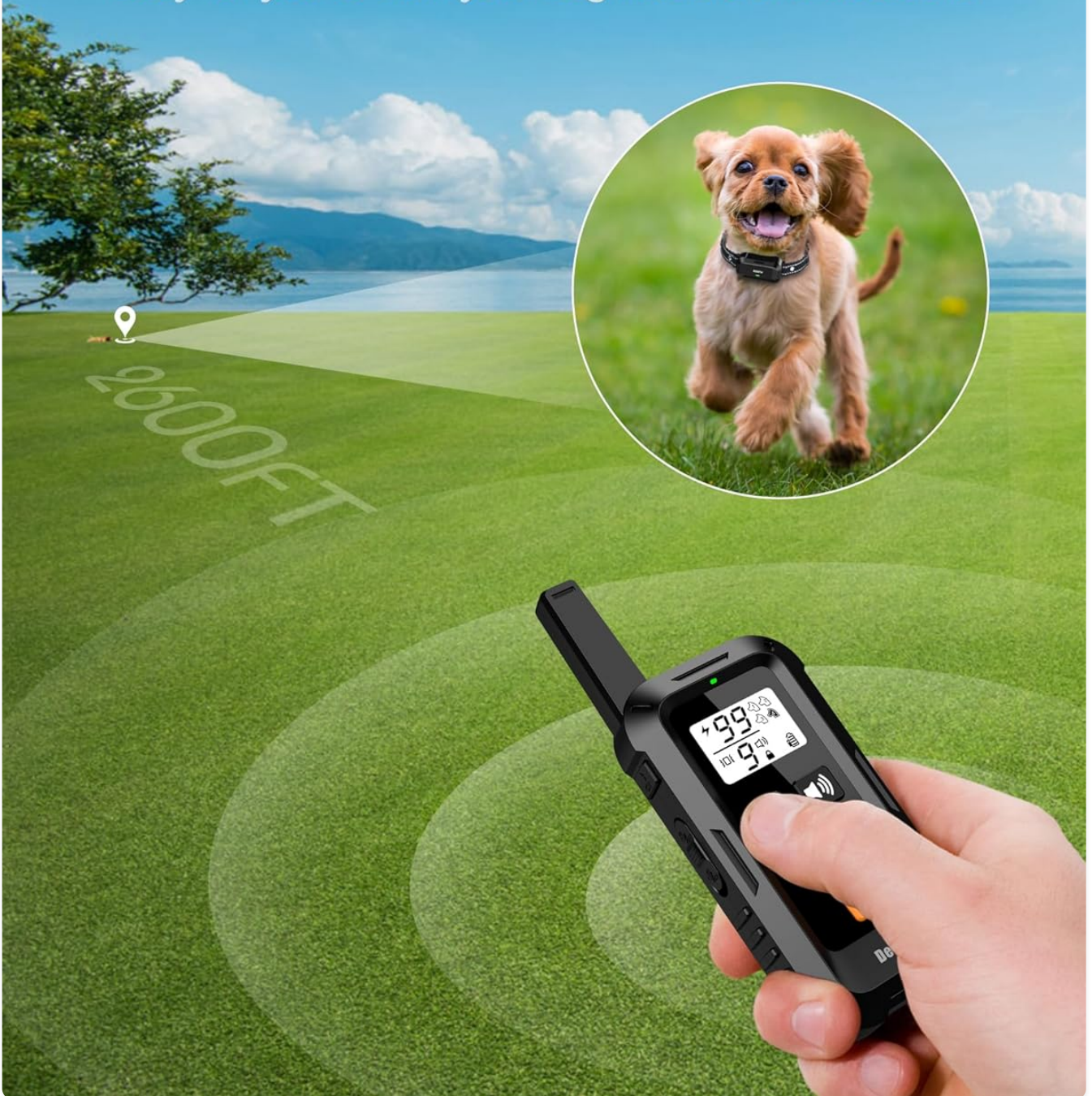
Figure 3: The remote control offers an impressive 2600ft range, allowing for effective training even when your dog is at a distance.

Easy for you to train your dog indoors and outdoors