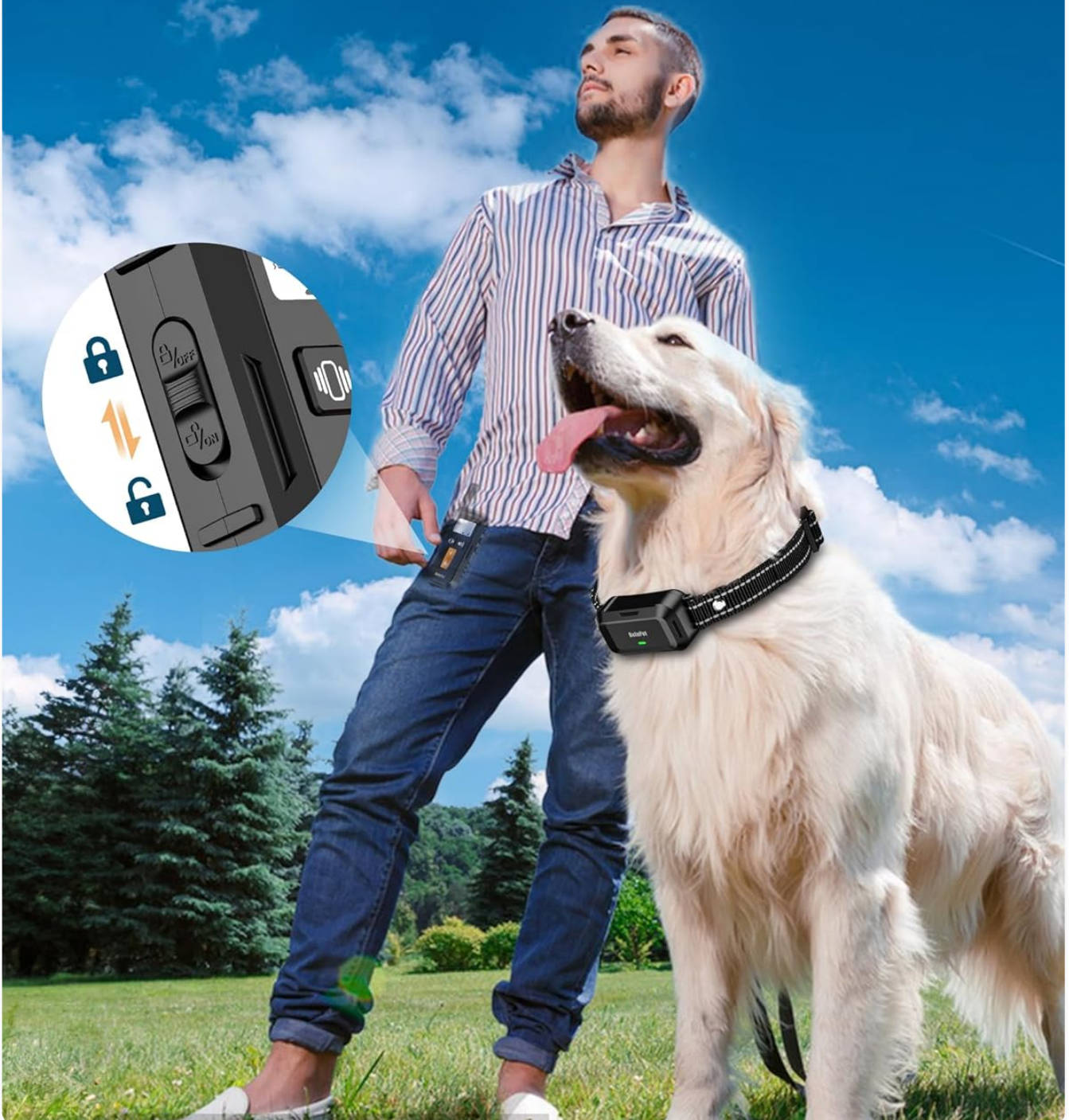
Figure 5: The remote features a security keypad lock to prevent accidental activation of commands, ensuring safe handling.