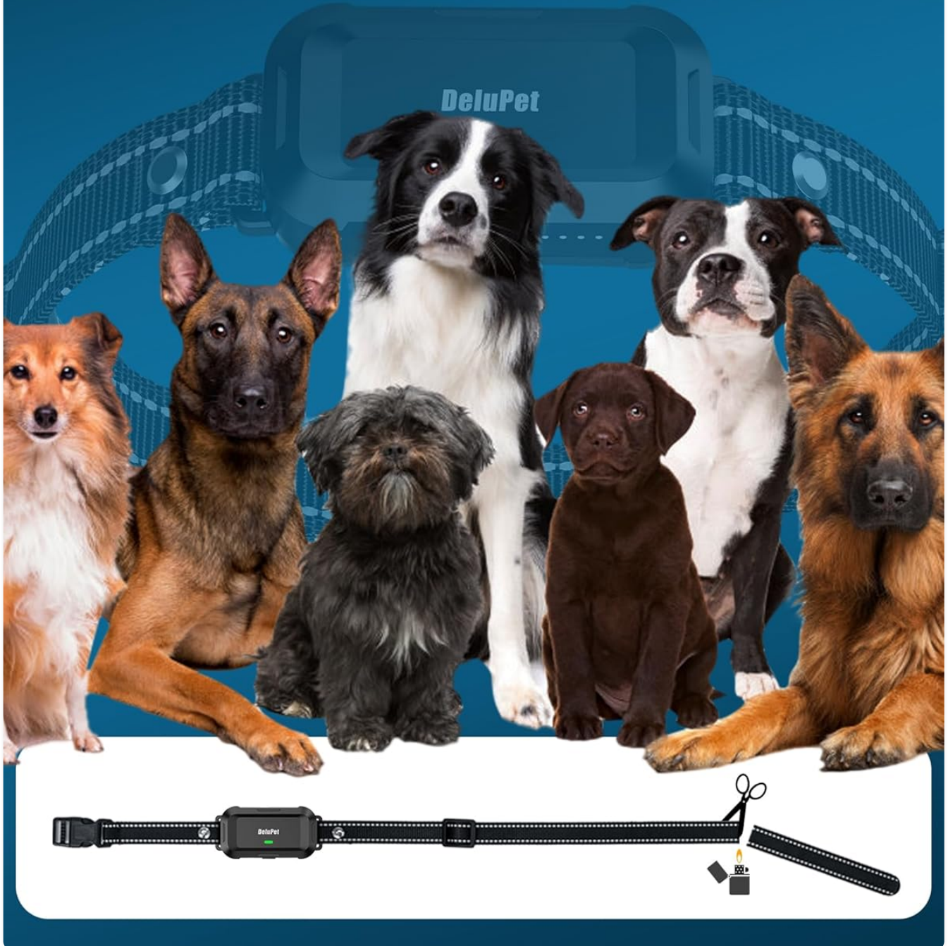
Figure 6: The adjustable collar is suitable for a wide range of dog sizes, from 15 lbs up, with neck sizes between 8 and 25 inches.

27.5 inch (The extra part of the collar can be cut off)