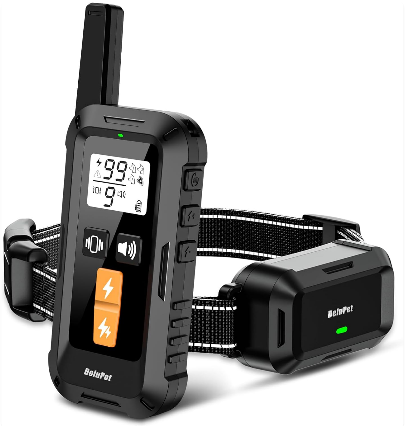
Figure 1: DeluPet DT-68 Dog Training Collar Remote and Receiver. The remote features a clear display and intuitive buttons for various training modes, while the collar receiver is compact and designed for comfort.