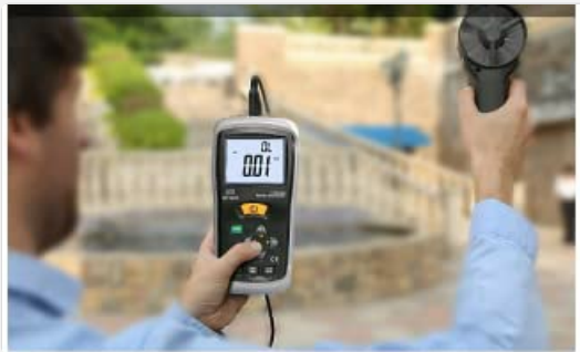
Image: The VIHELM DT-619 Digital Anemometer, showcasing its compact design and clear display.

The VIHELM DT-619 Digital Anemometer is a precision instrument designed for measuring air velocity, air flow (CFM/CMM), and ambient temperature. This manual provides detailed instructions for the proper use, setup, and maintenance of your DT-619 anemometer to ensure accurate readings and long-term performance.