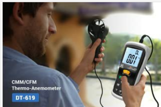
Image: The DT-619 main unit connected to its vane probe, ready for use.