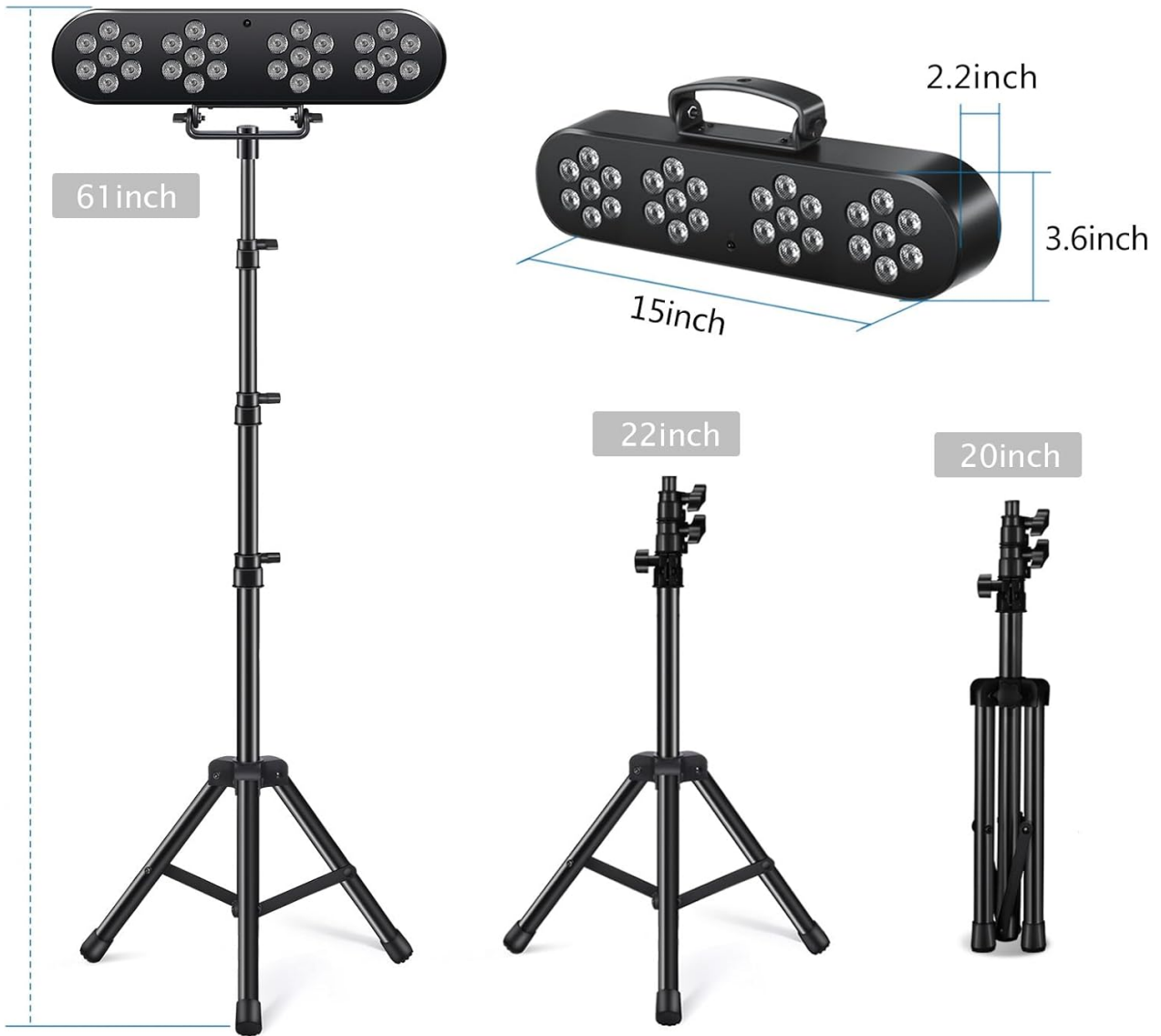
Image: Product dimensions for the light bar and tripod stand.