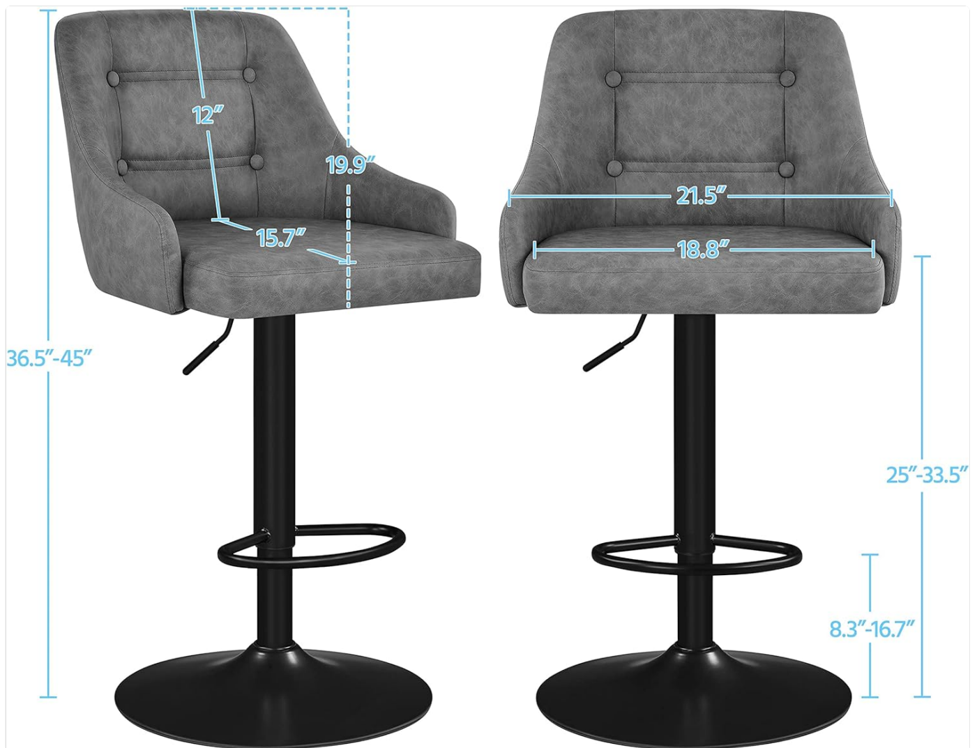
Image: Dimensional diagram of the barstool, useful for understanding assembly and fit.