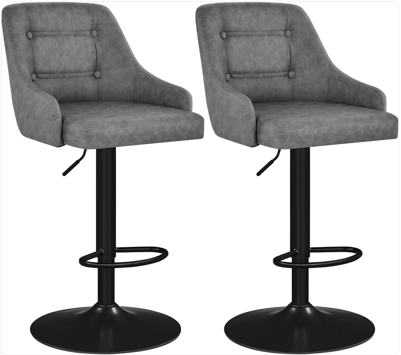
Image: The Yaheetech Barstools, featuring a light gray upholstered seat with a black adjustable base.