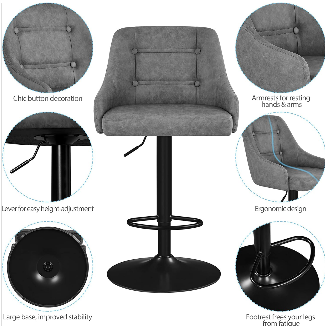
Image: Comprehensive view of various design elements and functional parts of the barstool.