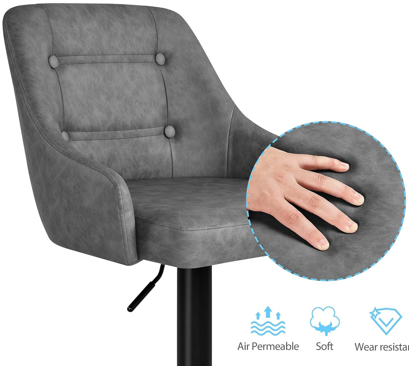
Image: Detail of the premium faux leather material, emphasizing its breathable, soft, and wear-resistant properties.