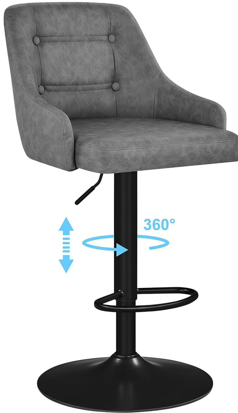
Image: Visual representation of the barstool's free height adjustment and 360-degree smooth rotation capabilities.