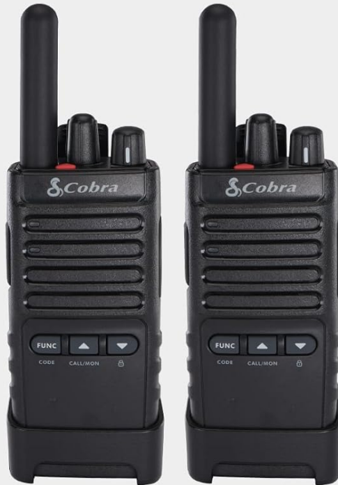
2x PX650 Radios