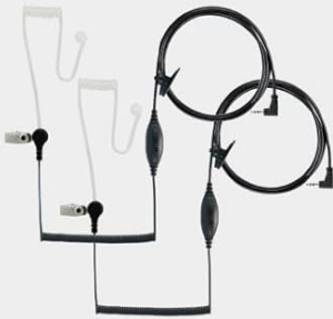
2x Surveillance Headsets