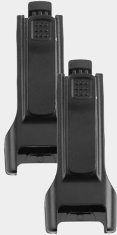
2x Belt Clips