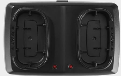
2-Way Dock Charger