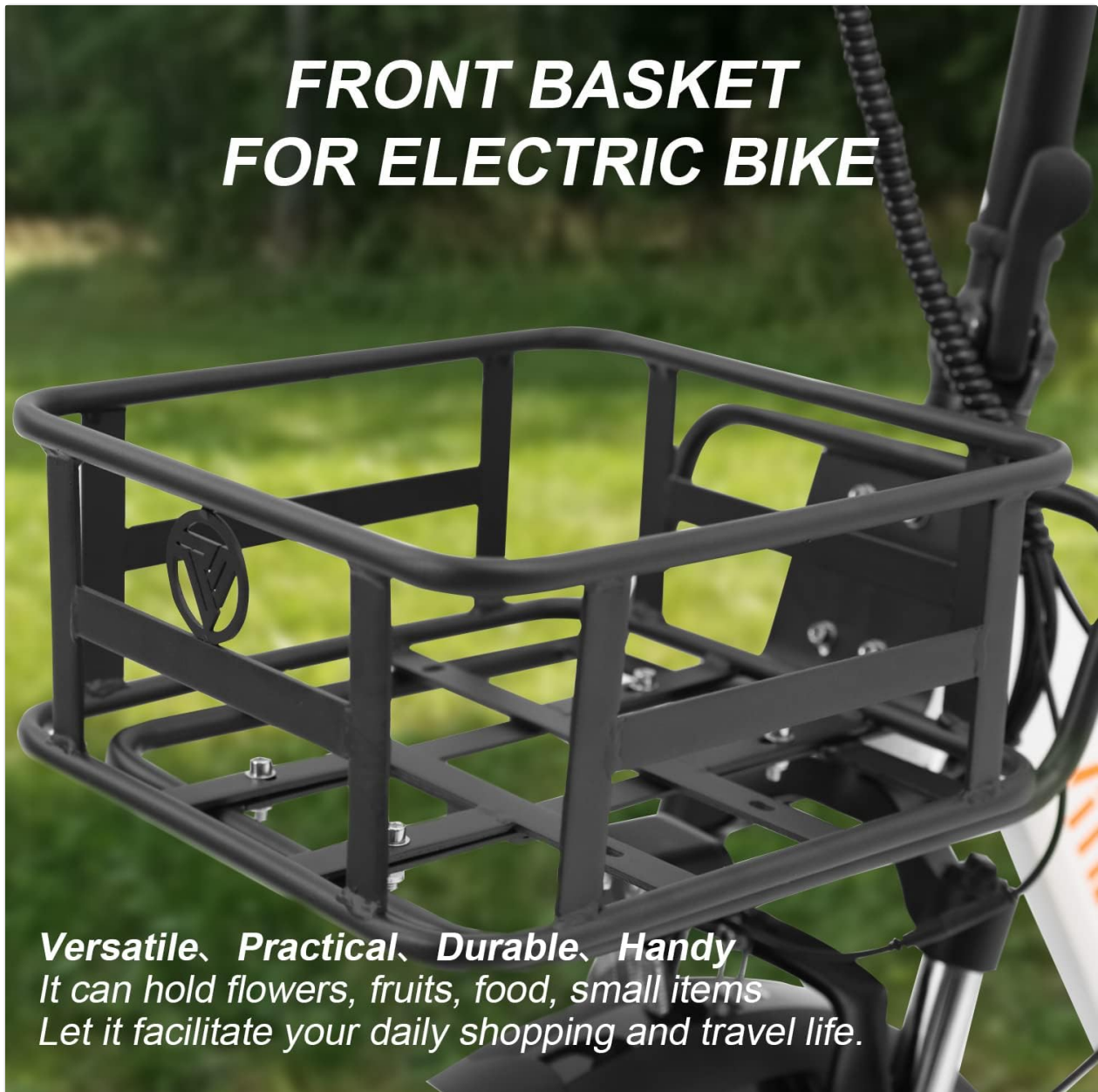
Image: A detailed view of the front basket securely mounted on the ebike's front rack, showing the attachment points.