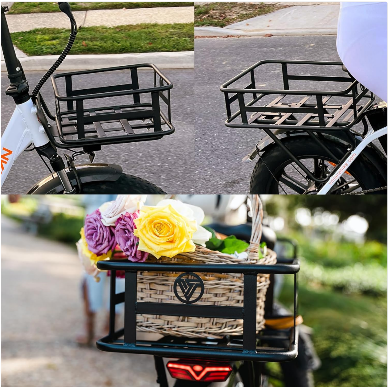
Image: The front and rear baskets shown in practical use, carrying various items like flowers, demonstrating their utility.