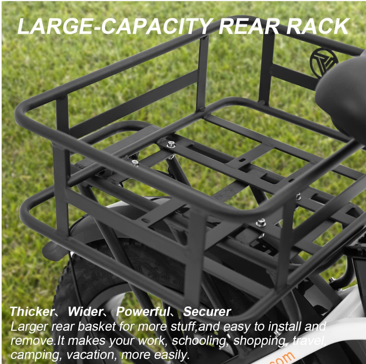
Image: A close-up shot of the rear basket mounted on the e-bike's rear rack, highlighting the secure fastening.

and tighten them with the wrench. Verify that the basket is firmly attached and does not wobble.