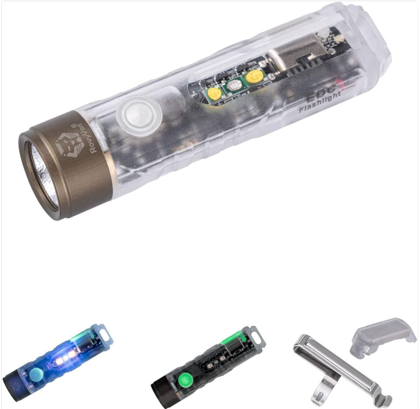
Image: The RovyVon Aurora A6 flashlight, showcasing its compact design and transparent casing.