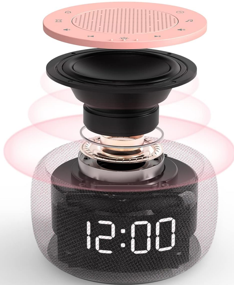
Image: An exploded view illustrating the internal 5W upward-firing speaker for rich, detailed sound.