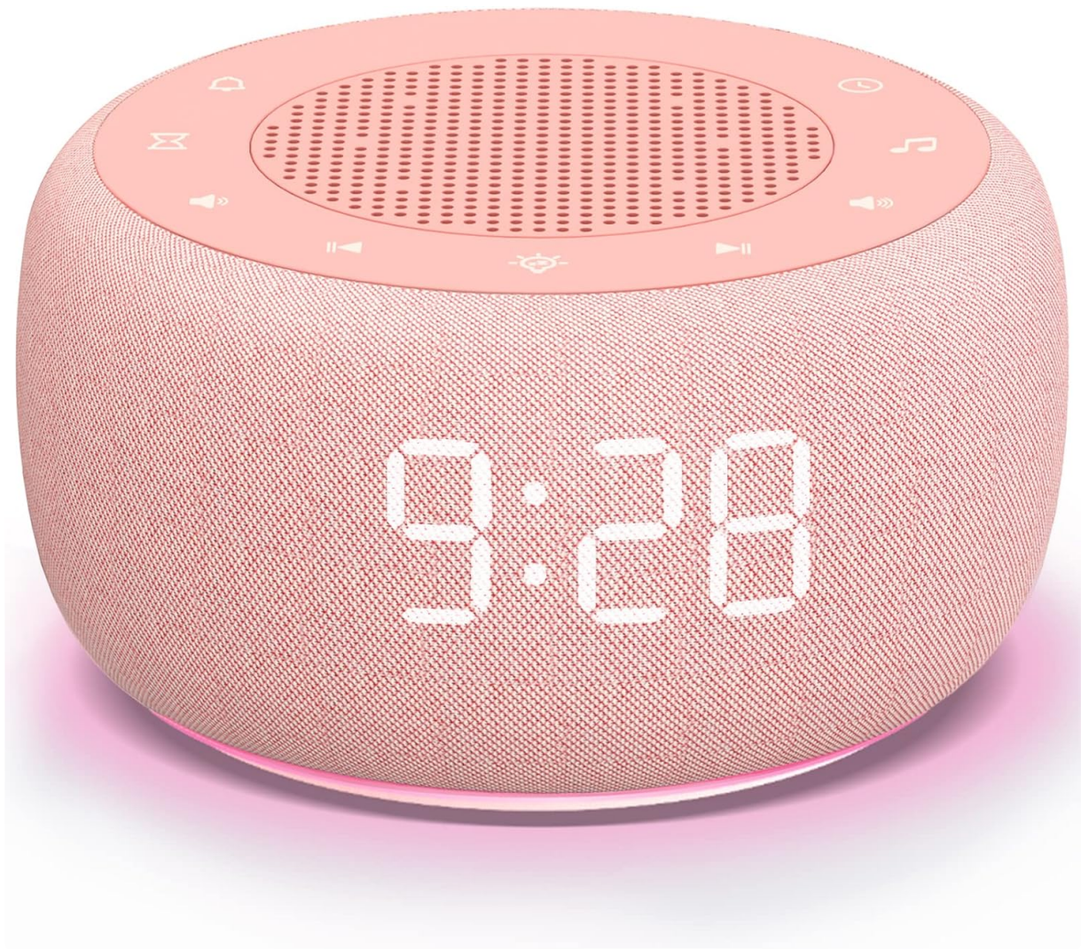
Image: The Buffbee Sound Machine and Alarm Clock, showcasing its compact design and digital time display.