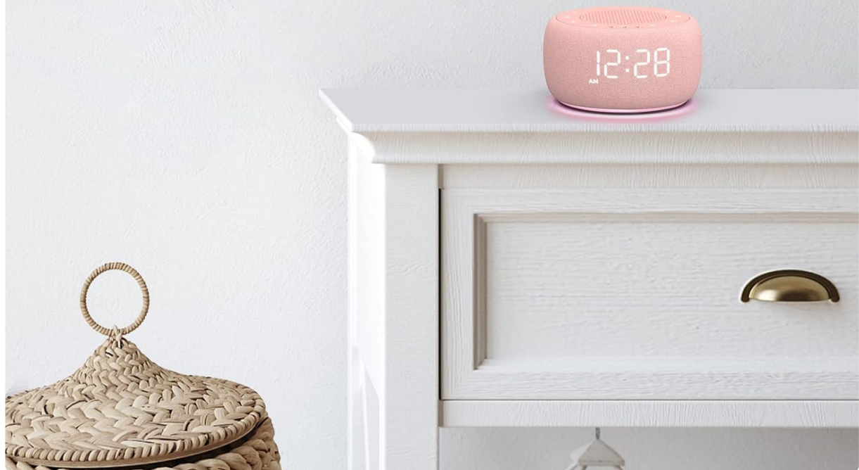
Image: Visual representation of the 2-in-1 functionality, emphasizing 18 soothing sounds and alarm clock features.