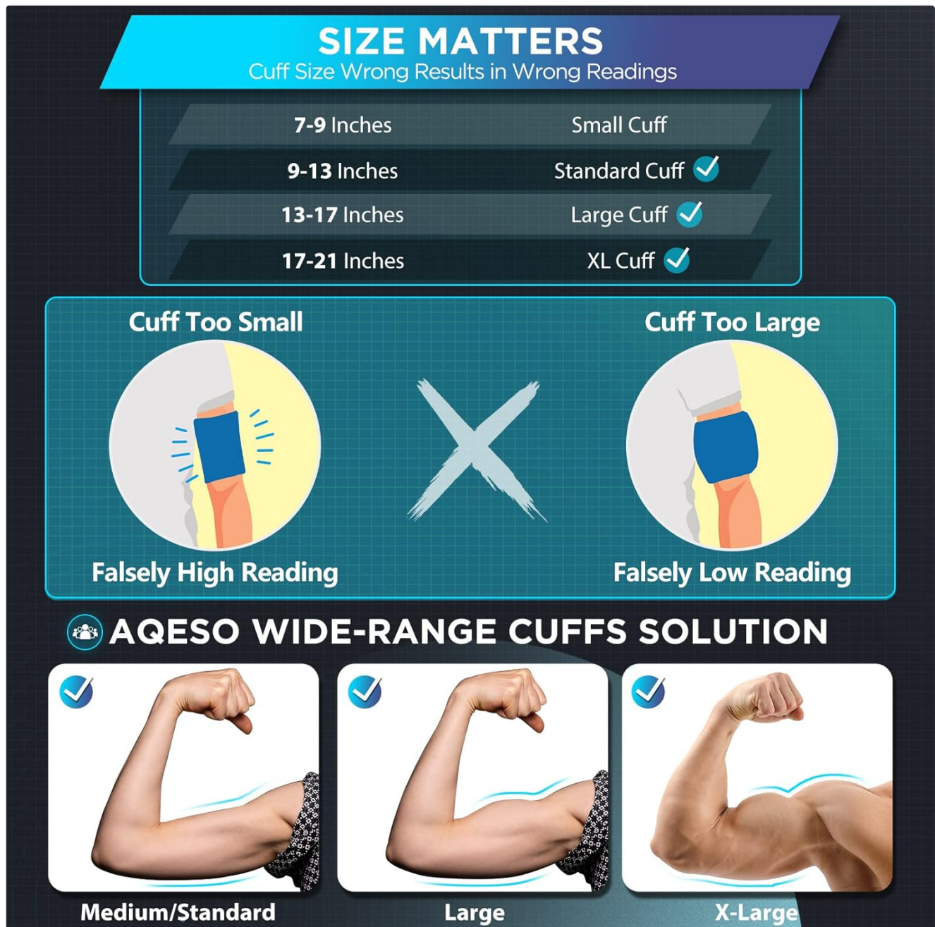
Figure 4: Visual guide to proper cuff sizing and placement for accurate readings.