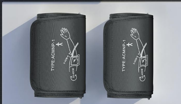
2 Upper Arm Cuffs