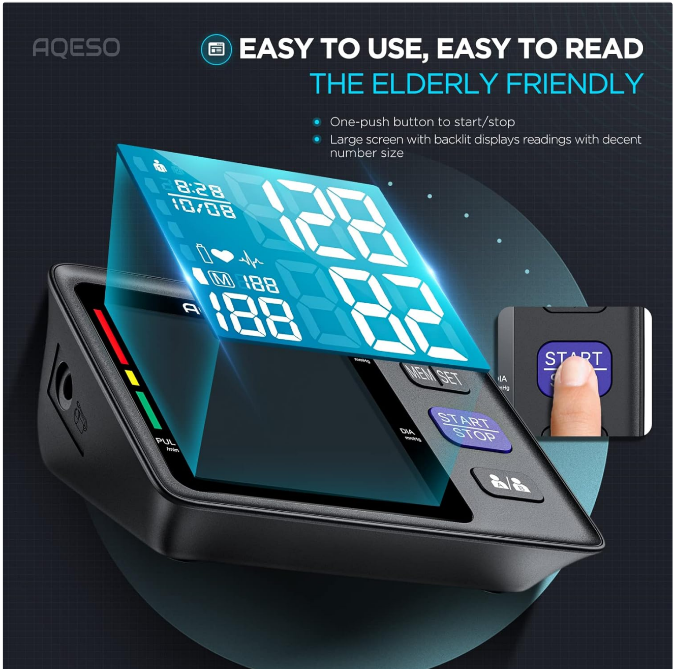
Figure 2: The large backlit LCD display and one-touch operation for ease of use.