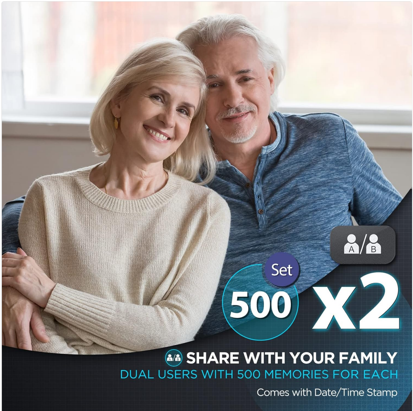
Figure 3: The dual-user mode allows two individuals to store their readings separately.