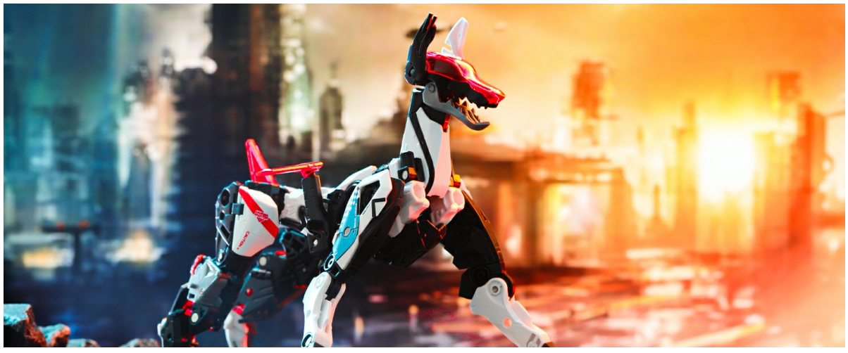
Image: An illustration demonstrating how ROARMEO and other Beastbox figures (Boney, Clawde, Jawliet) can combine to form the larger 'Massive Attacka' figure.