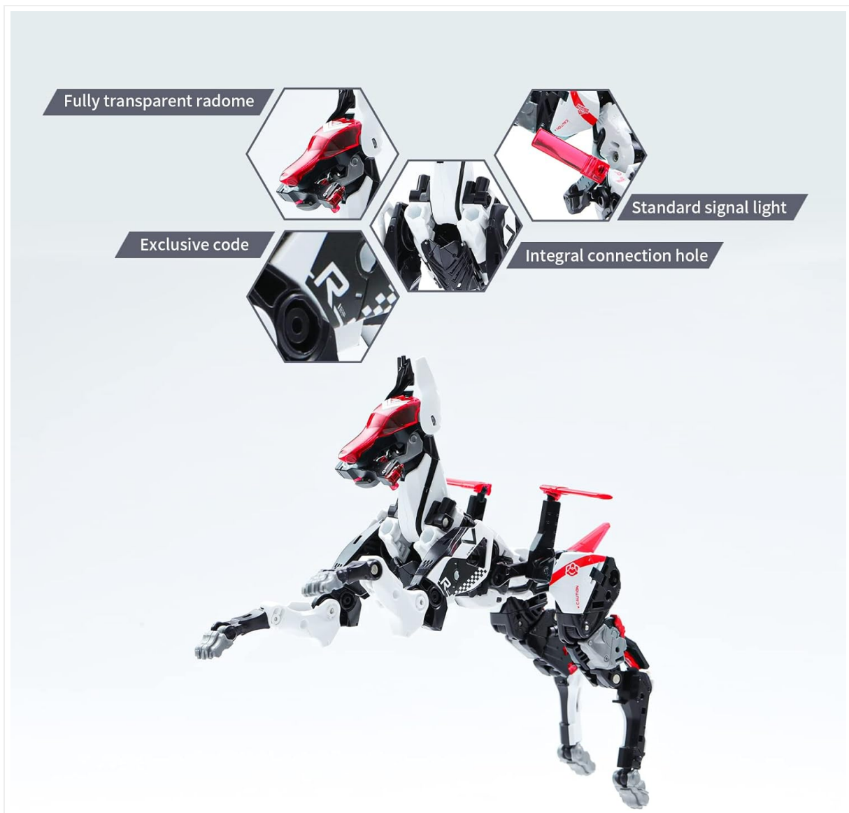
Image: Detailed views of the ROARMEO figure, showcasing its transparent radome, standard signal light, exclusive code, and integral connection holes.