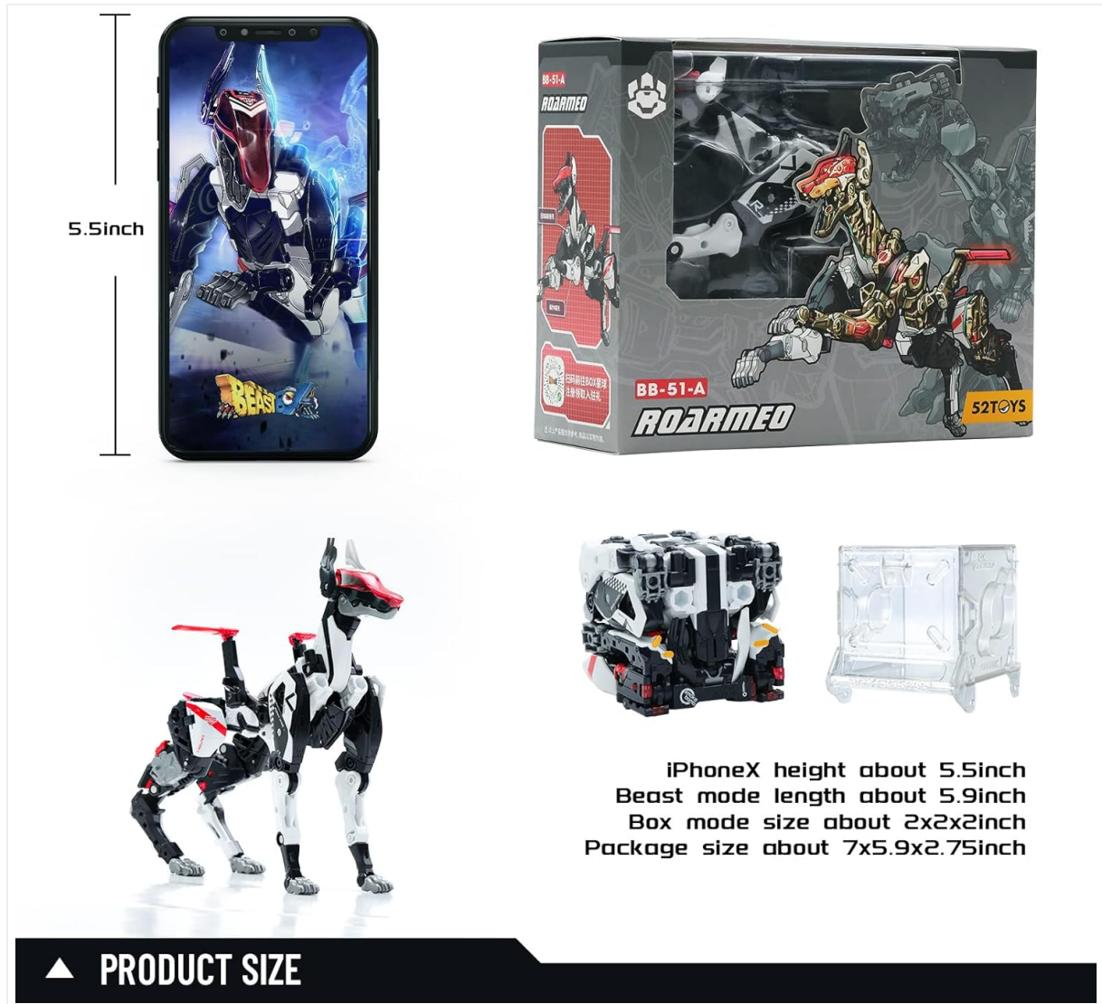
Image: The ROARMEO figure shown next to a smartphone for size comparison, along with its retail packaging, indicating dimensions.