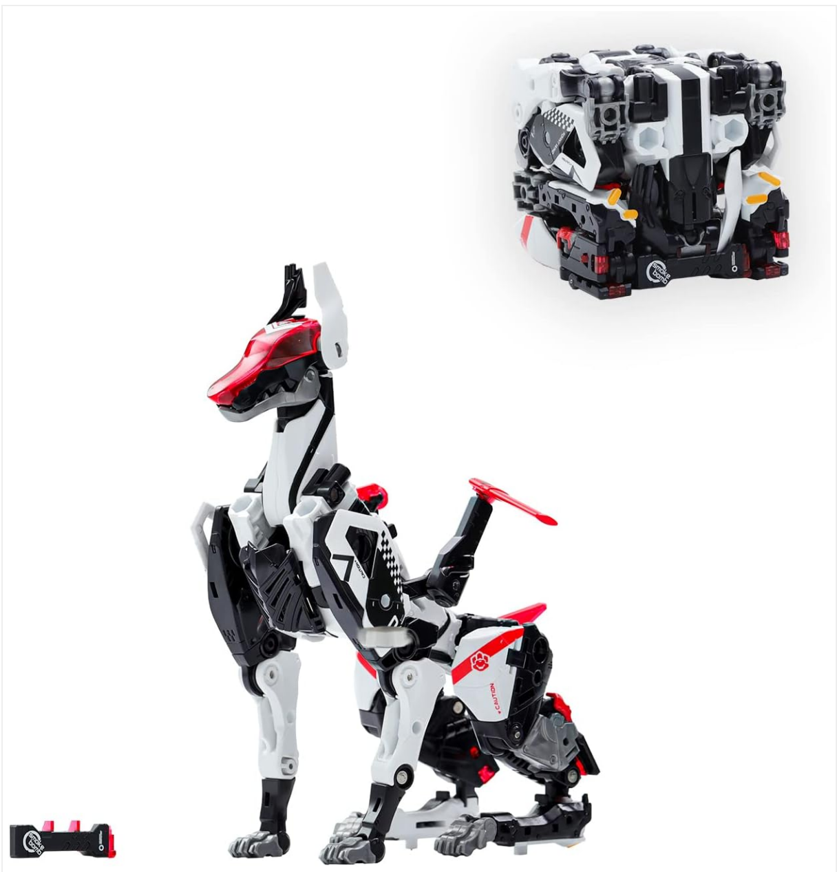
Image: The ROARMEO figure displayed in its mecha dog form alongside its compact cube form, illustrating its dual functionality.