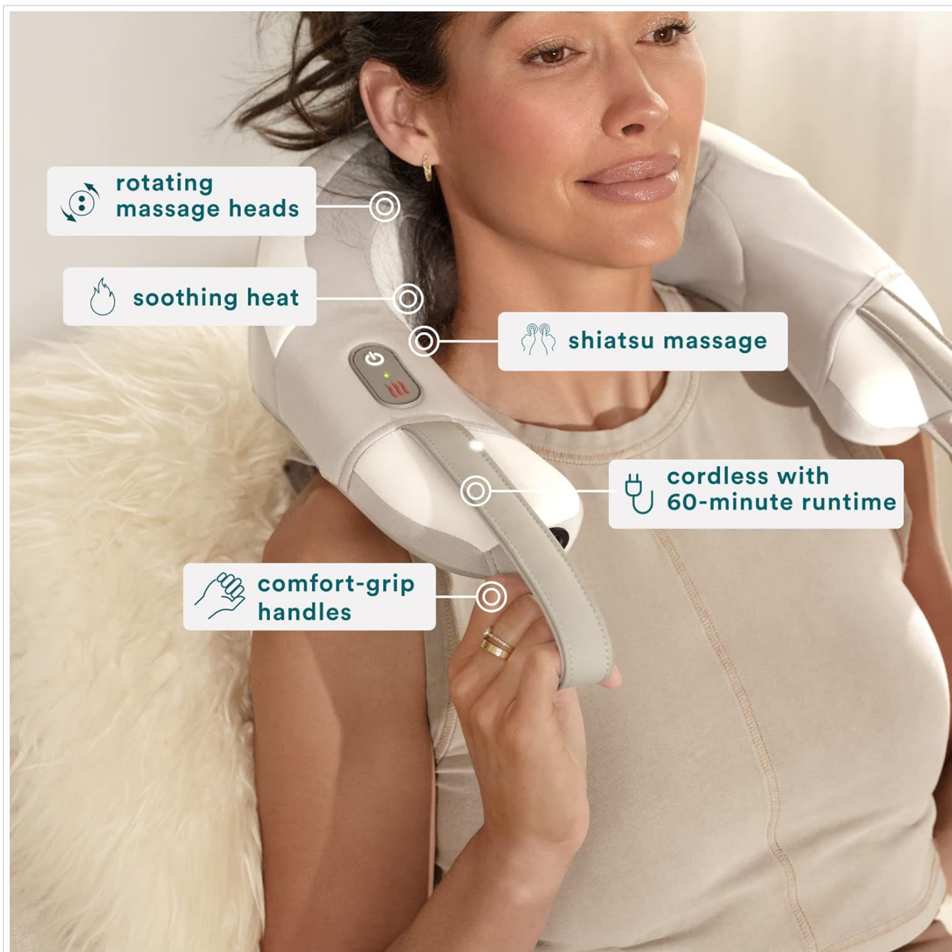
This image highlights key features of the massager, including rotating massage heads, soothing heat, shiatsu massage, comfort-grip handles, and its cordless design with a 60-minute runtime.