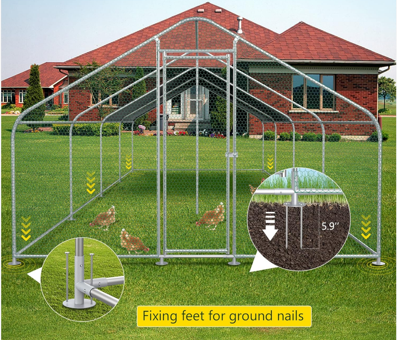
Image: Close-up view of the stable ground pegs and fixing feet, demonstrating how they secure the coop to the ground for enhanced stability.

Ensure structural stability from the bottom