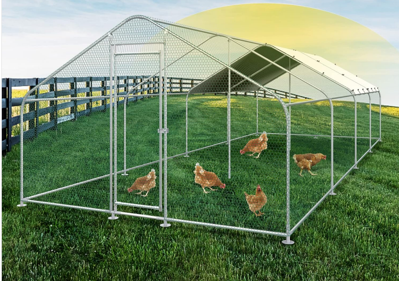
Image: The Lyromix chicken coop featuring its waterproof and UV-resistant cover, providing protection from rain, sun, wind, and snow.