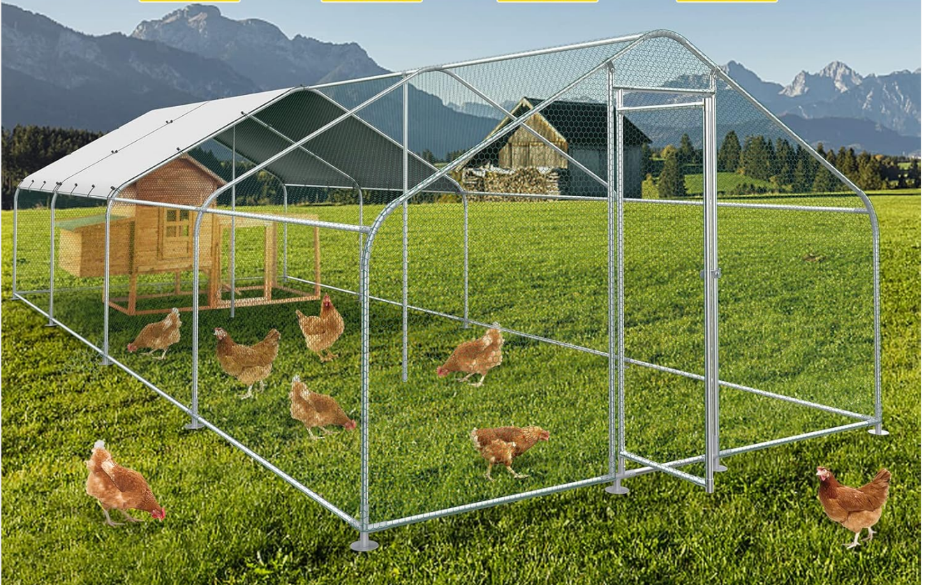
Image: The spacious interior of the Lyromix chicken coop, demonstrating its suitability for rabbits, chickens, ducks, and geese, and its potential use with an existing wooden coop.