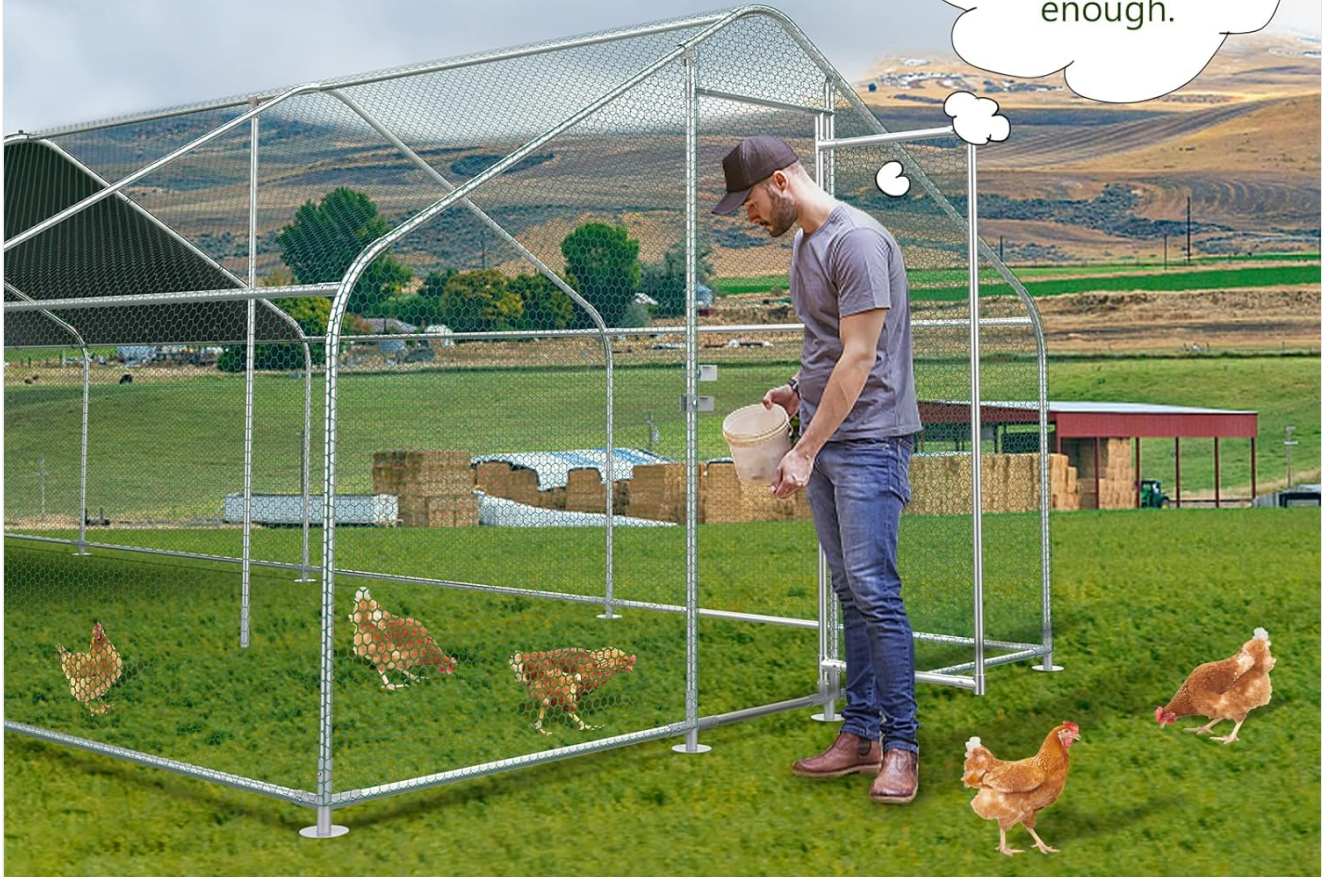
Image: A person standing inside the Lyromix chicken coop, illustrating the convenient walk-in feature for easy feeding and access.

Dude, this door is really convenient enough.