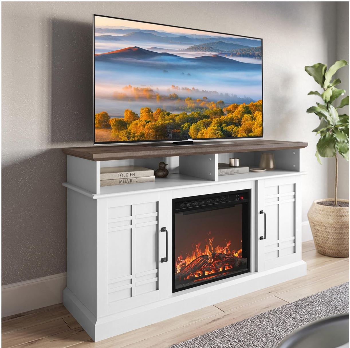
Figure 1: BELLEZE 48-inch TV Stand with 18-inch Electric Fireplace Heater.