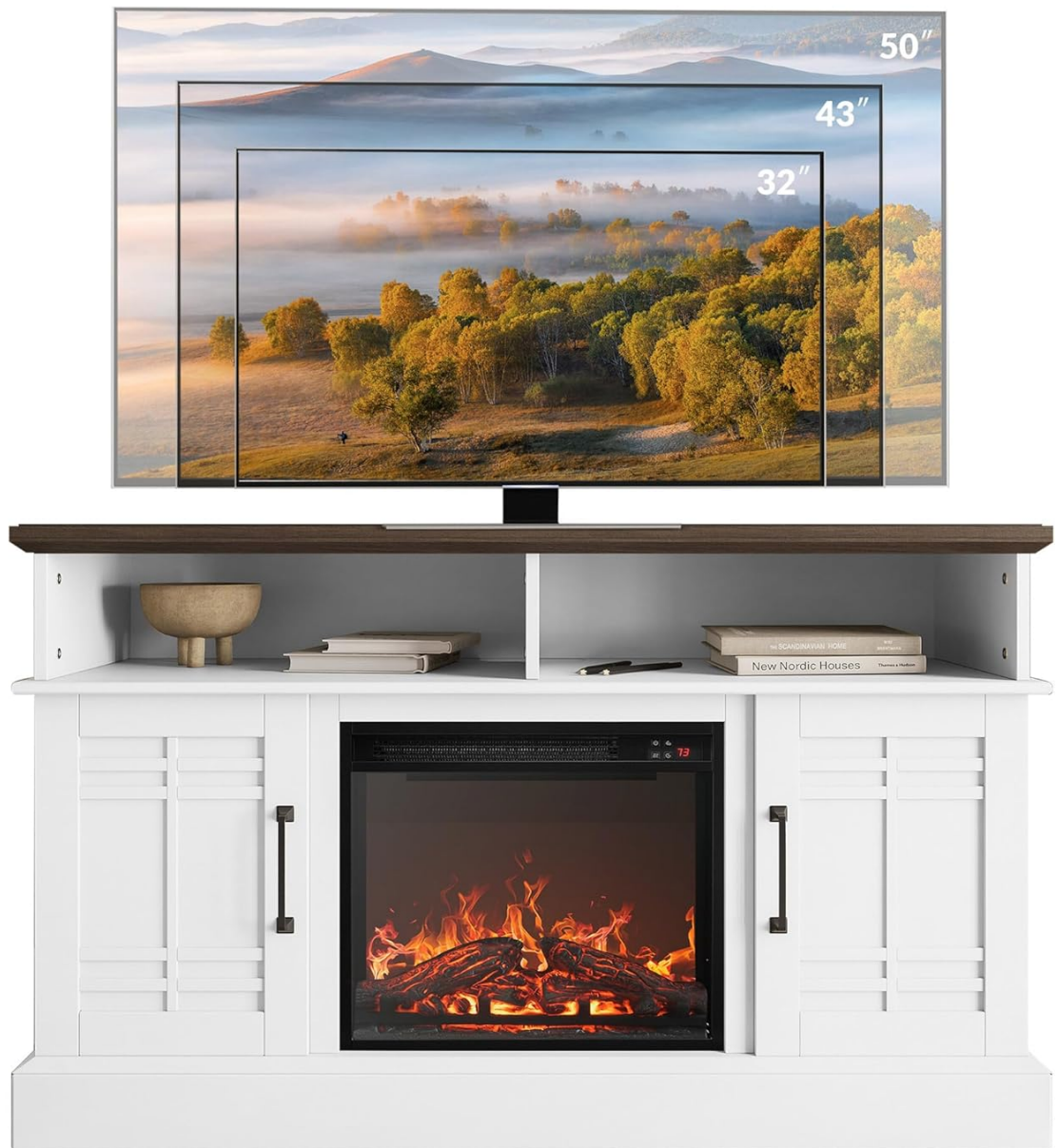
Figure 4: Product dimensions.