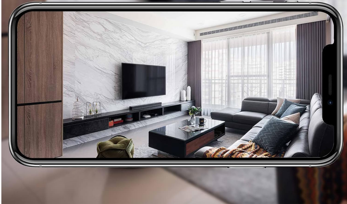
Image: A smartphone screen showing a clear and smooth 1080P resolution video feed of a modern living room, demonstrating the camera's video quality.