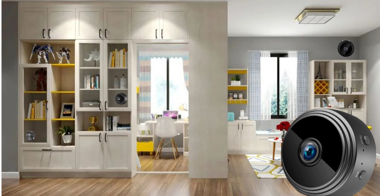
Image: A collage demonstrating the camera's versatility across multiple scenarios, including home, baby, car, pet, elderly care, and office environments.