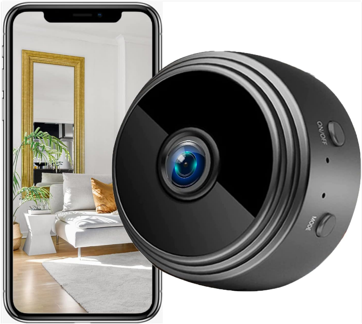
Image: The SCOORNEST A9 Mini Camera shown next to a smartphone displaying its live video feed.