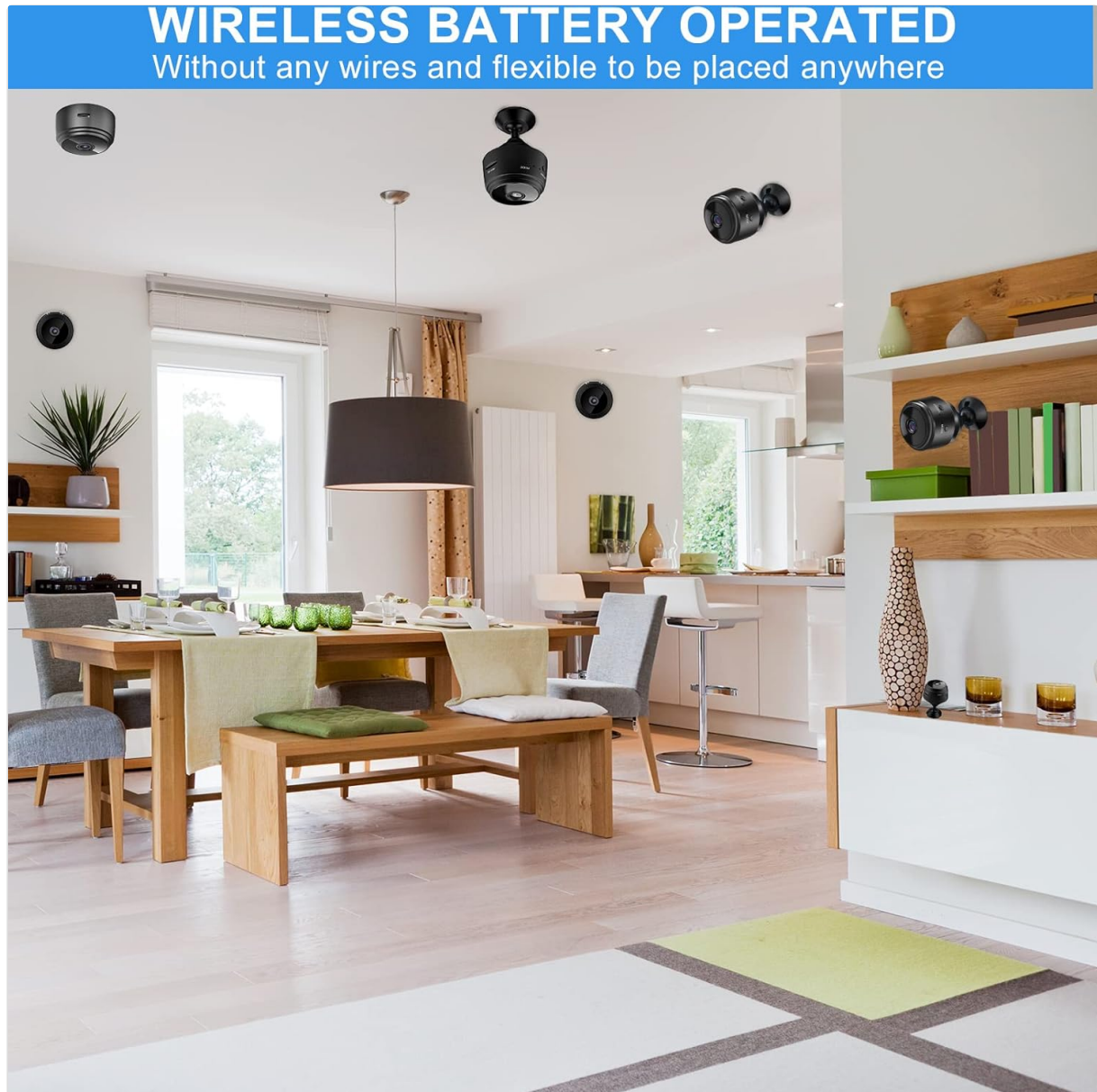
Image: Several mini cameras are shown discreetly placed in different areas of a home, highlighting their wireless and battery-operated nature for flexible installation.

The camera's wireless and compact design, along with the magnetic bracket, allows for versatile placement in various indoor settings.