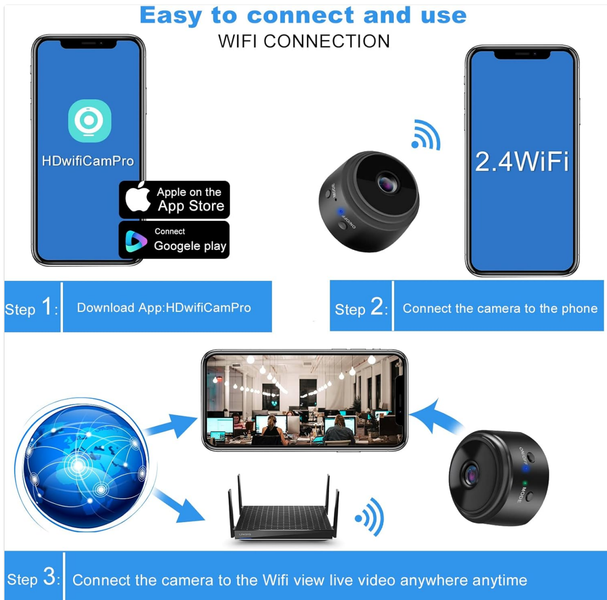
Image: A visual guide illustrating the three-step process for connecting the camera: downloading the HDwifCamPro app, connecting the camera directly to the phone, and then connecting the camera to a 2.4GHz Wi-Fi network for remote access.