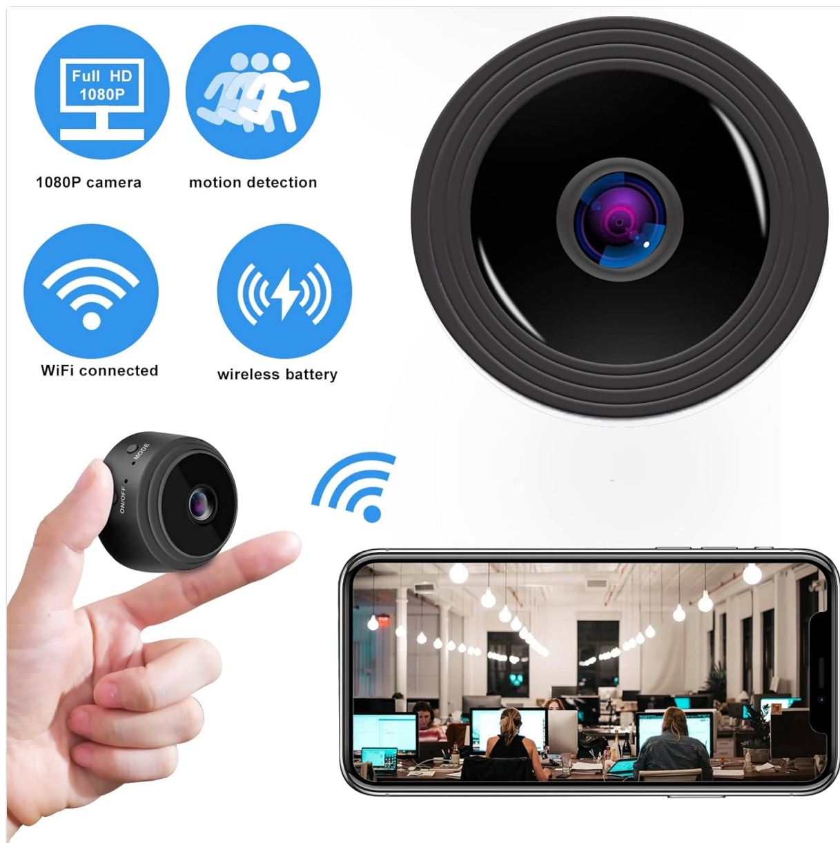
Image: Visual representation of the camera's main features: 1080P resolution, motion detection, WiFi connectivity, and wireless battery operation.