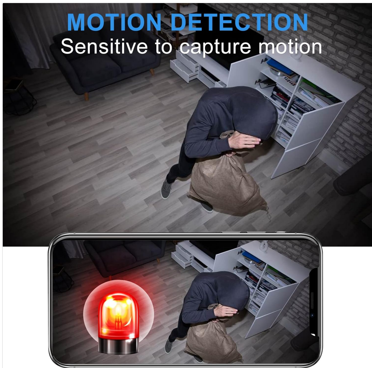
Image: A scene depicting motion detection, where a person is shown in a room, and a red alarm icon signifies that motion has been captured by the camera.