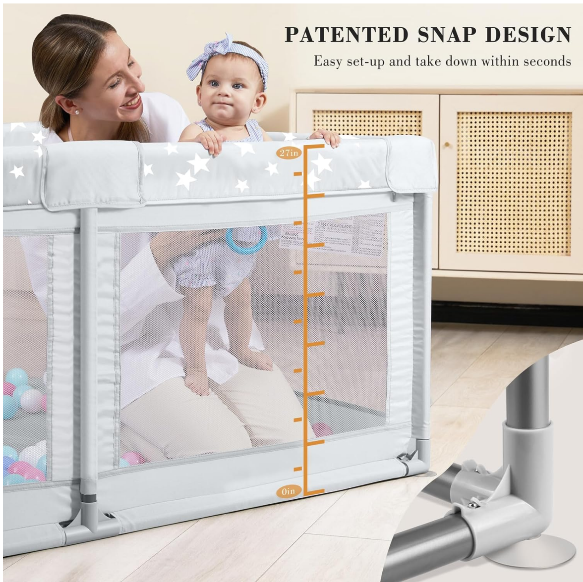
Image: A baby playing happily inside the spacious playpen, surrounded by toys.