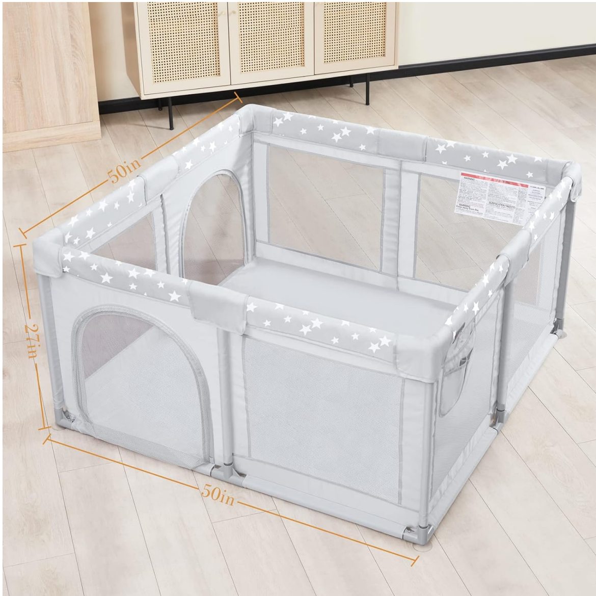
Image: A diagram illustrating the key dimensions of the playpen for reference.