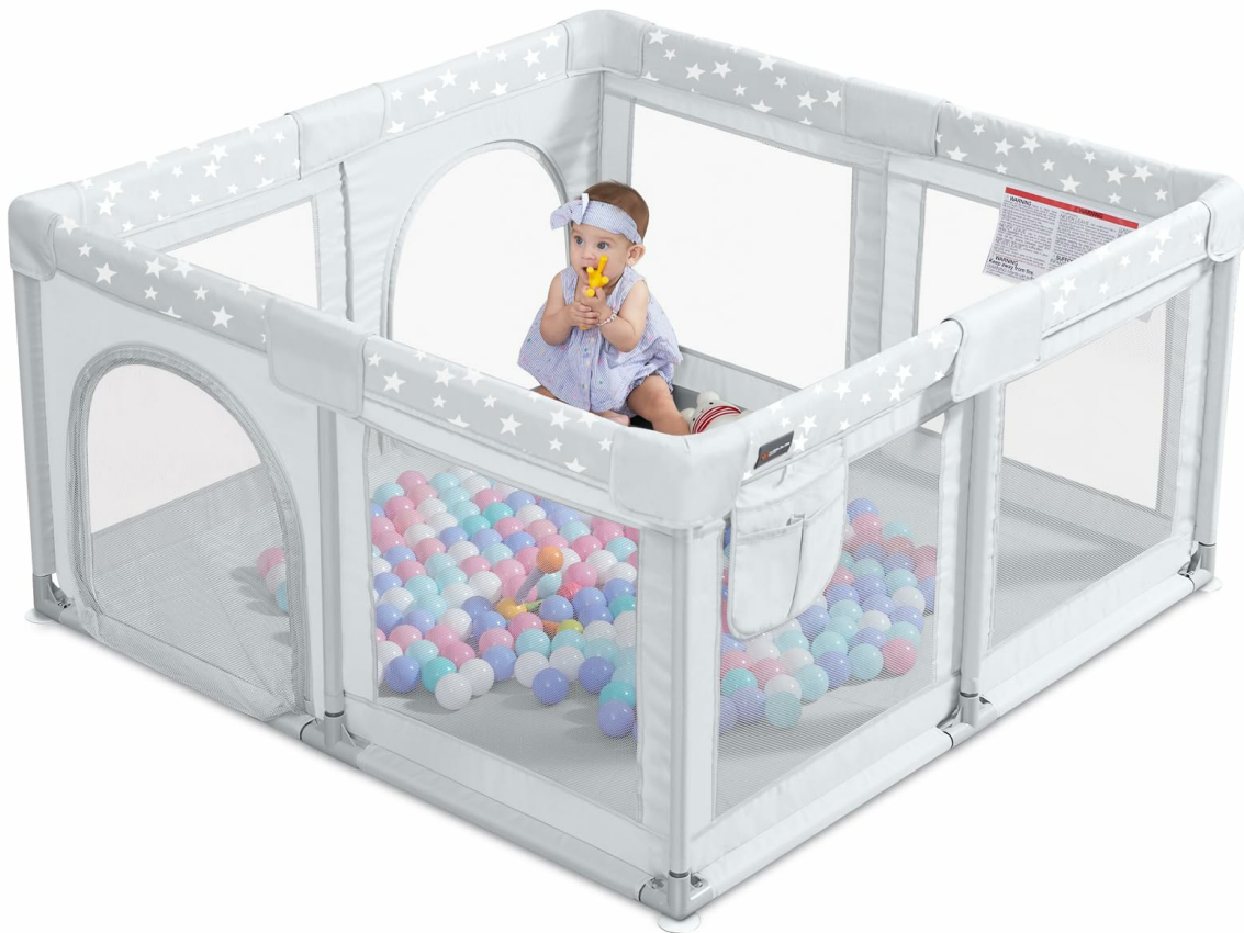
Image: The ANGELBLISS Baby Playpen set up in a home environment, showcasing its large play area.