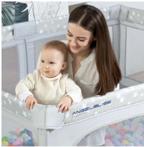
Image: A baby playing inside the playpen, highlighting the secure mesh walls and safe environment.