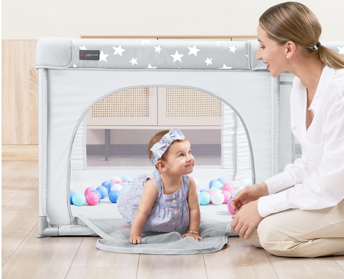
Image: A baby crawling through the zip-open side panel, demonstrating easy access.