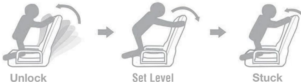
Image: The STHOUYN floor chair folded for compact storage. This image illustrates how the chair can be easily collapsed to save space, making it convenient for storage in smaller living areas.