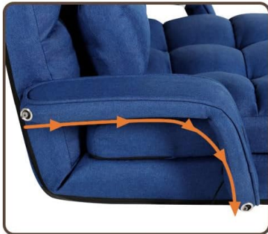
Comfortable handrail curves