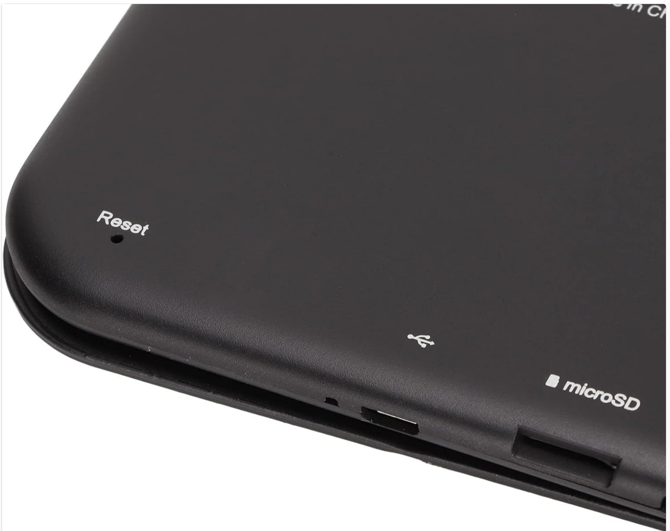
Image: A detailed view of the bottom edge of the Vbestlife BK6006 E-Reader, showing the Reset pinhole, Micro USB charging/data port, and the MicroSD card expansion slot.

The device includes the following ports and slots: