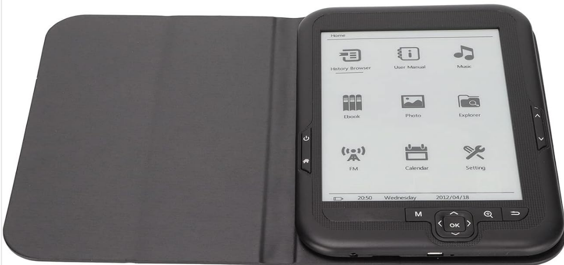
Image: The Vbestlife BK6006 E-Reader displaying its main menu, which includes icons for Ebook, Photo, Explorer, FM Radio, Calendar, and Settings.