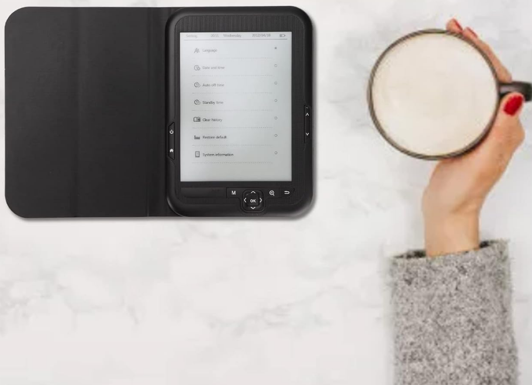
Image: The Vbestlife BK6006 E-Reader in its protective case, displaying the settings menu with options for Language, Date and Time, Auto-off time, Standby time, Clear history, Restore default, and System information.