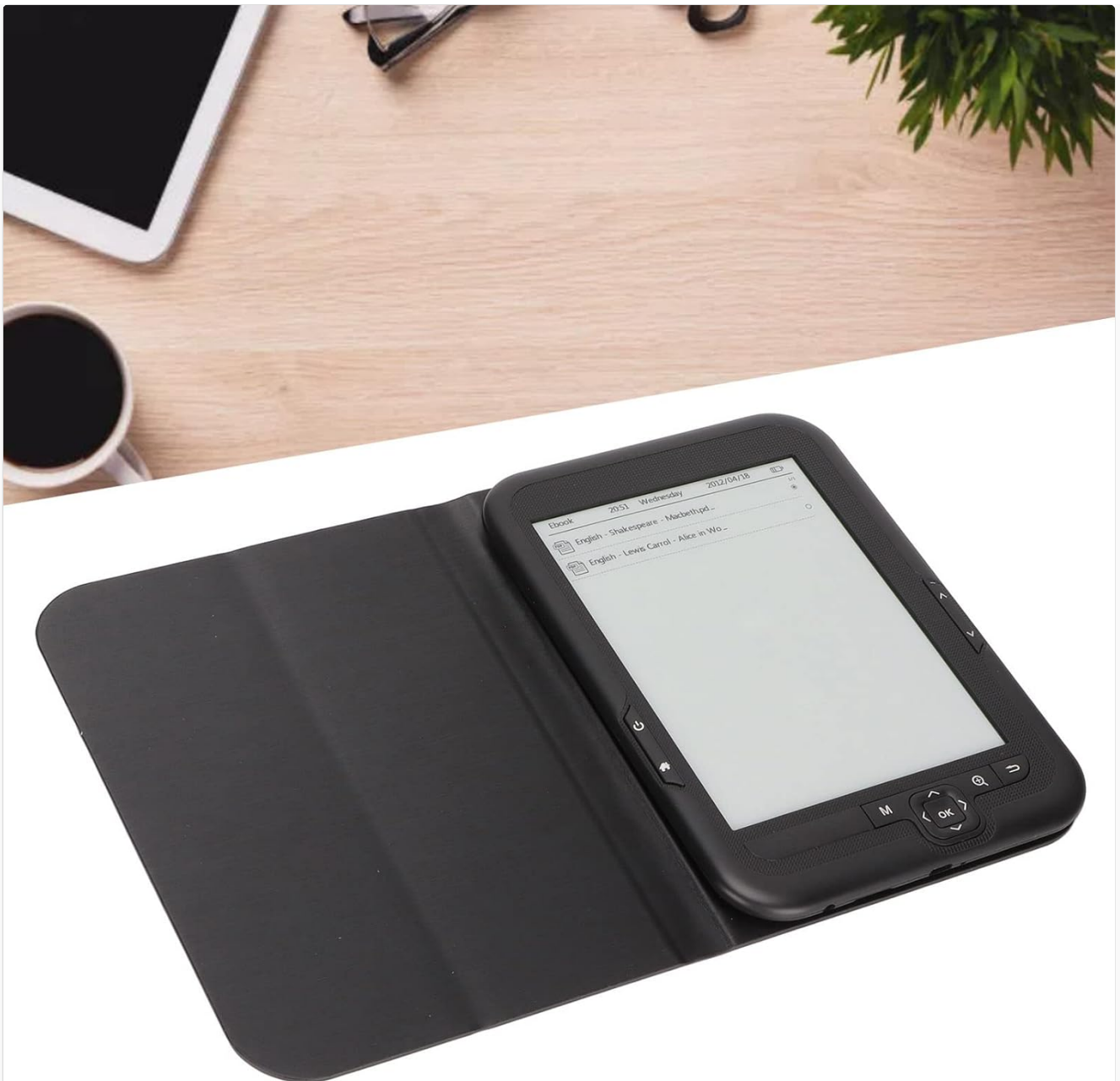
Image: The Vbestlife BK6006 E-Reader screen showing a list of available books, including "English - Shakespeare - Merchant of Venice" and "English - Lewis Carroll - Alice in Wonderland."