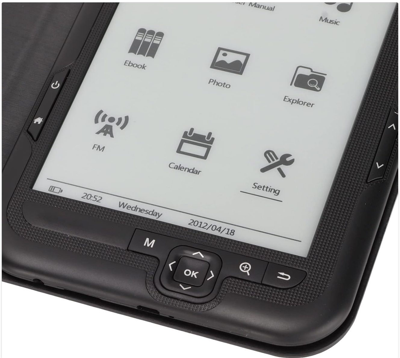
Image: A close-up view of the Vbestlife BK6006 E-Reader's lower section, highlighting the navigation buttons (left/right arrows, OK, M, Home, Return, Search) and the main menu interface on the E-Ink screen.

The Vbestlife BK6006 E-Reader features a 6-inch E-Ink display and a set of mechanical navigation buttons for easy interaction. Key controls include: