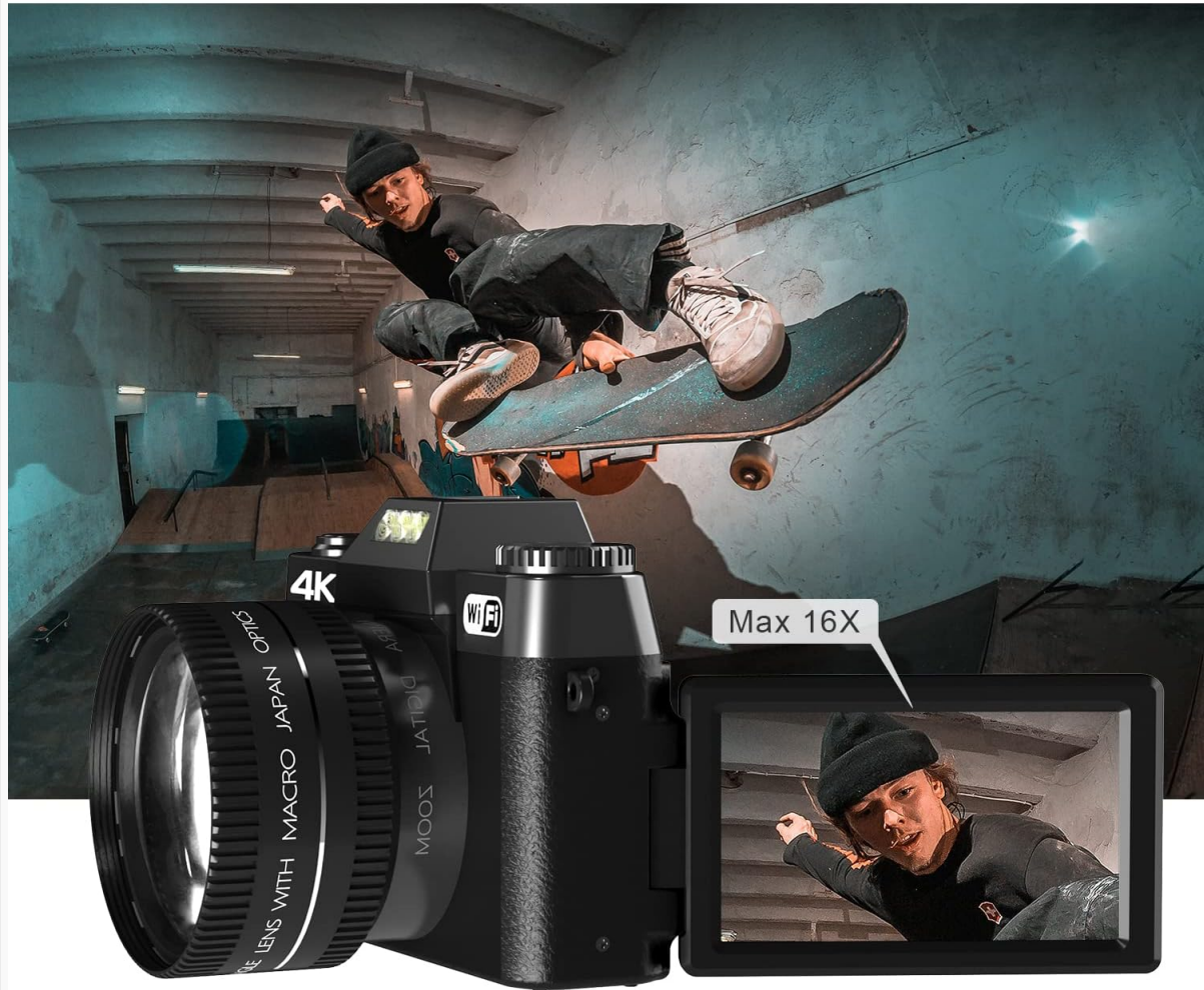
Image: Demonstrates 48MP shooting and 16X digital zoom capability.