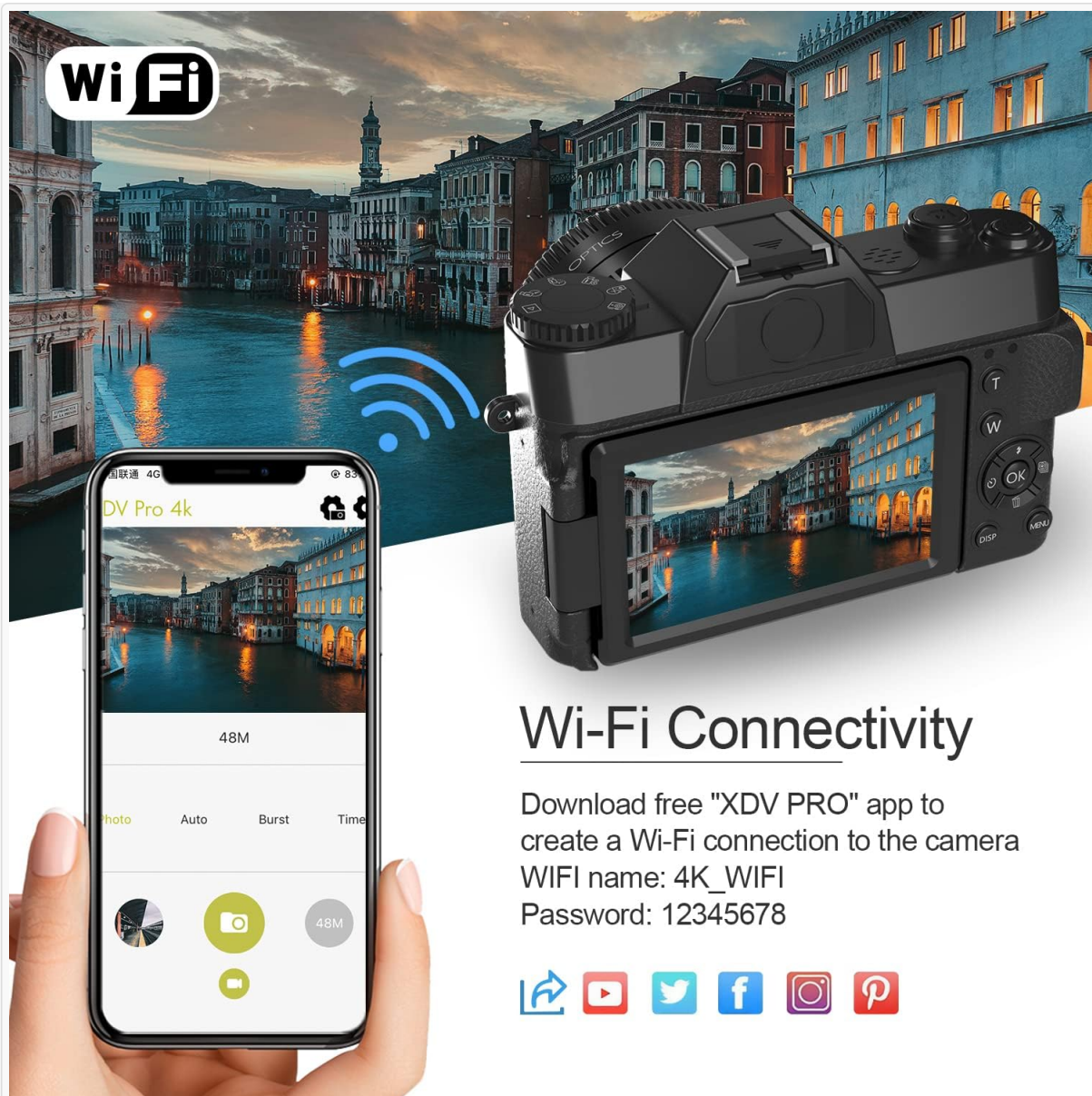
Image: Steps for connecting the camera to a smartphone via Wi-Fi.