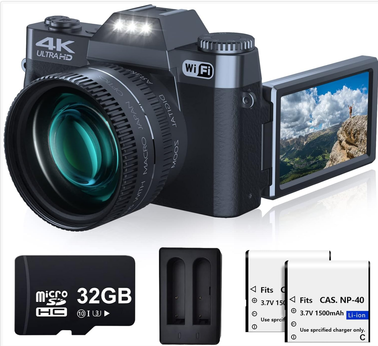
Image: VJIANGER 4K Digital Camera W02 with its complete set of accessories.