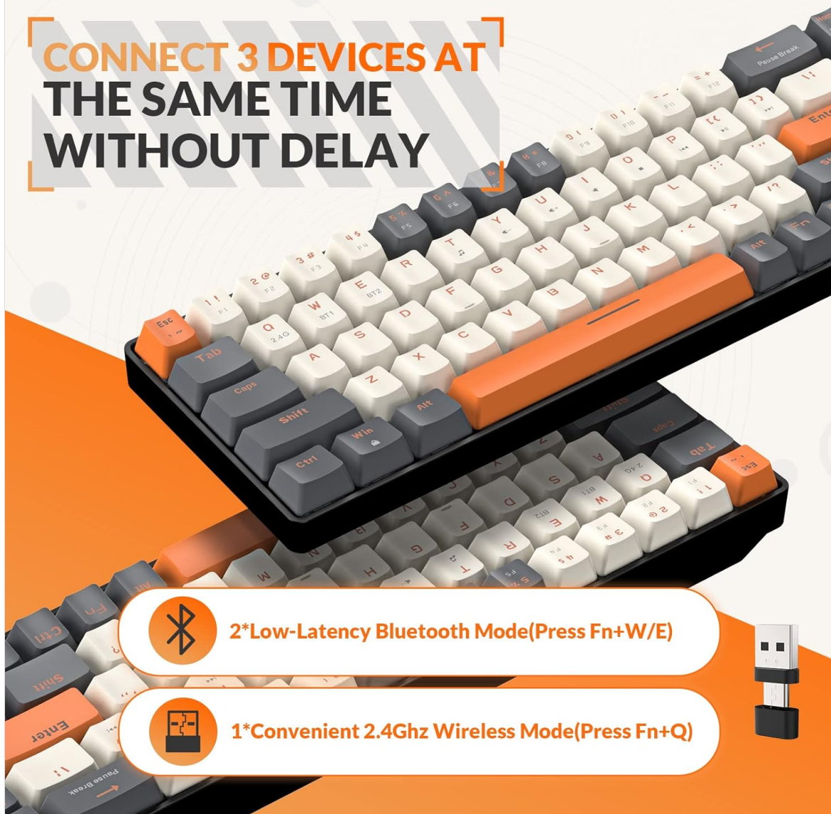
Image 3: A visual representation of the MAGIC-REFINER RK68 keyboard's ability to connect to three devices simultaneously via Bluetooth (Fn+W/E) and one via 2.4GHz wireless (Fn+Q).

CONNECT 3 DEVICES AT THE SAME TIME WITHOUT DELAY