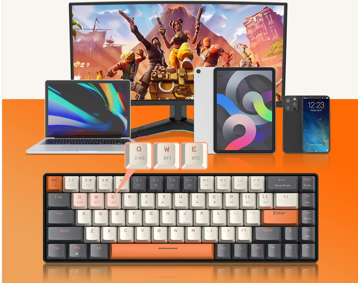
Image 2: The MAGIC-REFINER RK68 keyboard shown with its 2-in-1 USB-A and Type-C dongle, illustrating compatibility with desktop computers, laptops, tablets, and smartphones.

Support for Desktop/Laptop/MAC/Smartphone, etc