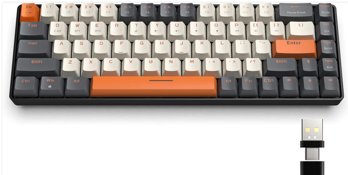
Image 1: Top-down view of the MAGIC-REFINER RK68 keyboard, showcasing its compact 68-key layout with off-white, orange, and dark grey keycaps.

The MAGIC-REFINER RK68 is a compact 60% wireless mechanical keyboard designed for versatility and performance. It features dual-mode connectivity (2.4GHz wireless and Bluetooth 5.0), hot-swappable switches, and a 68-key layout with dedicated arrow keys. This manual provides instructions for setup, operation, maintenance, and troubleshooting.