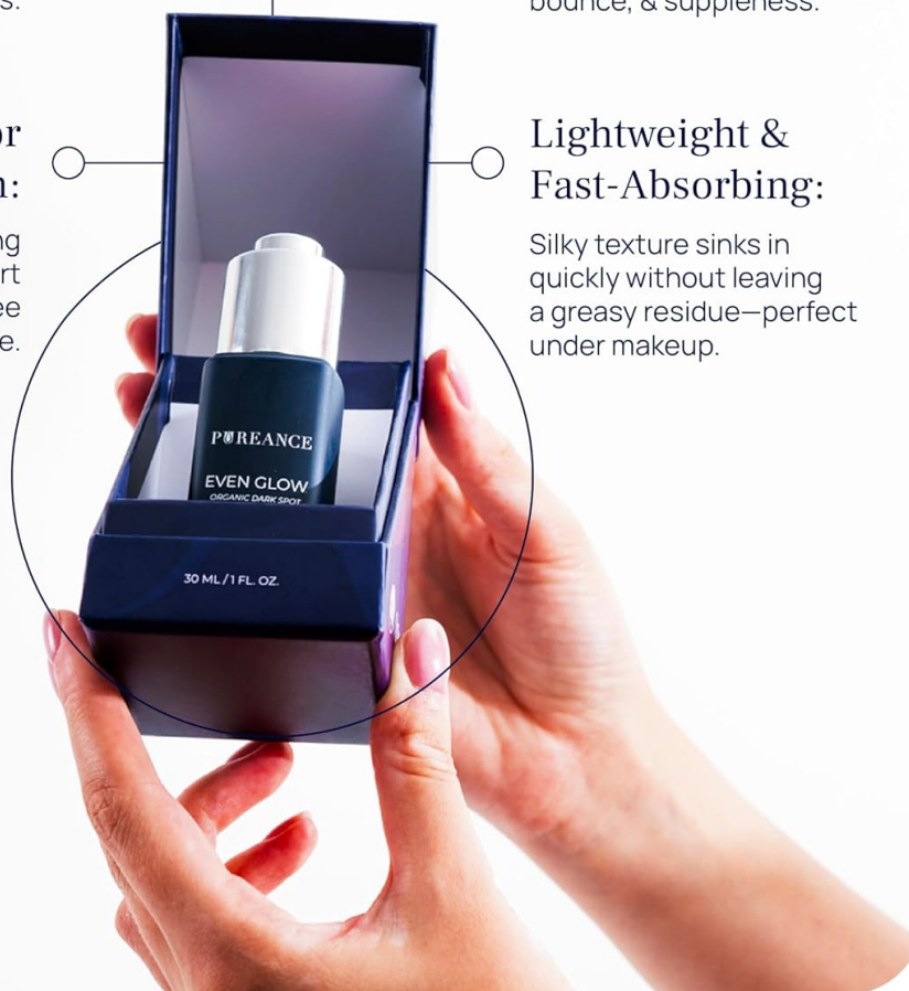
Image: Infographic detailing the key benefits of the Even Glow serum, including dark spot reduction, hydration, gentleness for sensitive skin, and fast absorption.

Silky texture sinks in quickly without leaving a greasy residue—perfect under makeup.