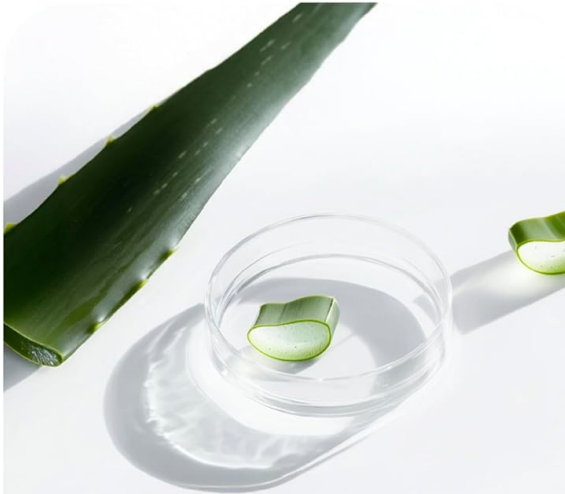
Aloe Leaf Juice:

Deeply hydrates and soothes irritation—perfect for calming sensitive or post-treatment skin.