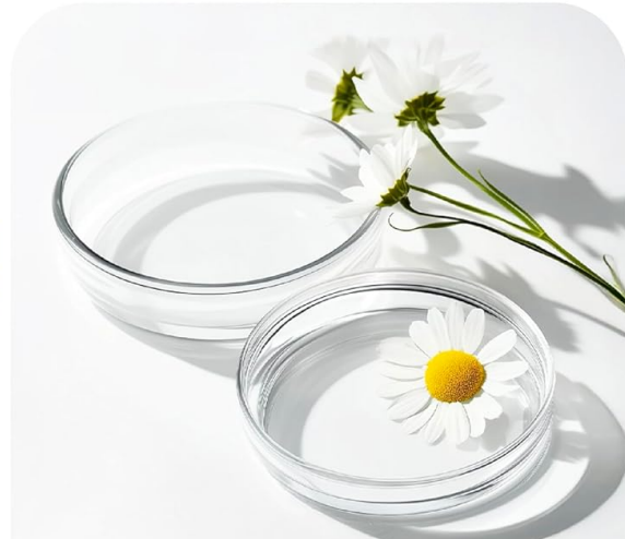
Matricaria Flower Extract:

Deeply hydrates and soothes irritation—perfect for calming sensitive or post-treatment skin.