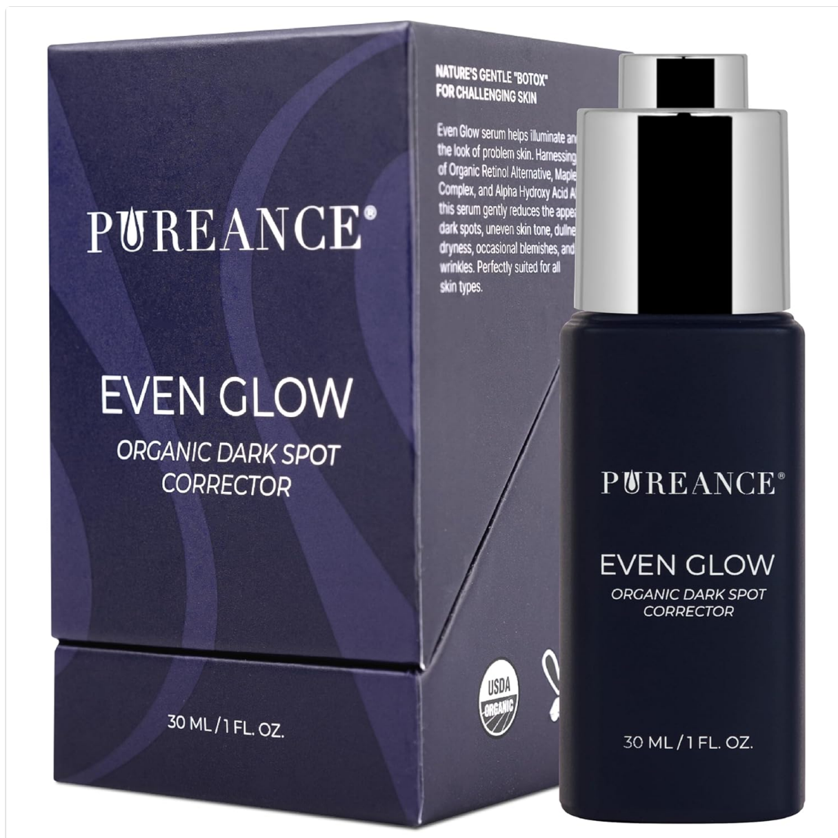
Image: PUREANCE Even Glow Organic Dark Spot Corrector serum bottle and its packaging box.