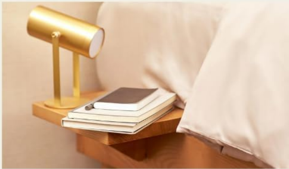
Image: A bedside table attached to the Koala Urban Bed Frame, showcasing its utility for holding a lamp and books, enhancing convenience.

スマホやランプなどちょっとした小物を置くのに便利な専用のベッドサイドテーブル（別売）。ベッドフレームのサイドレールにはめ込むだけで簡単に取り付けすることができます。シングル・セミダブルは片側に1つ、ダブル・クイーンは両側に1つずつ付けることをお勧めします。