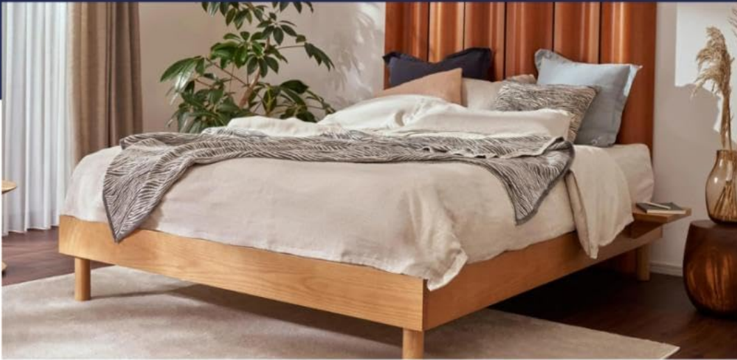
Image: A Koala mattress placed on the Koala Urban Bed Frame, showcasing the minimalist design and how a mattress fits within the frame.

人生は変化の連続。だからこそ、自分にとって一番心地よい空間でしっかり休むことが大切。コアラアーバンベッドフレームは、洋室、和室、どんな空間にも自然に馴染む、誰にとっても「ちょうどいい」シンプルなデザイン。家族が増えたり、引っ越ししたり、ライフステージが移り変わっても、コアラアーバンベッドフレームはずっとあなたの毎日に寄り添います。